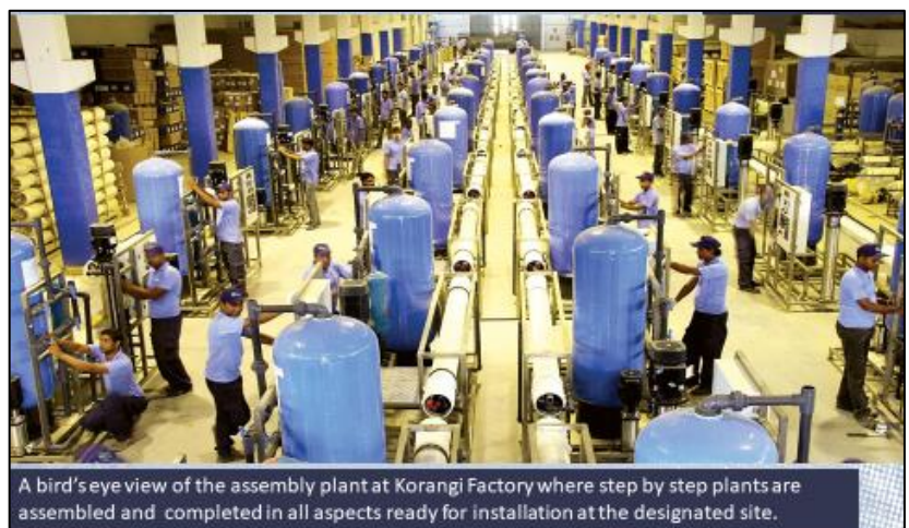
A bird's eye view of the assembly plant at Korangi Factory where step by step plants are assembled and completed in all aspects ready for installation at the designated site.

Pak Oasis has strived to develop work flow designs that ensure plant operations are monitored to the highest degree of safety as well as efficiency, while minimizing impact on adjacent populations.