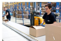
A recognized sustainable performance