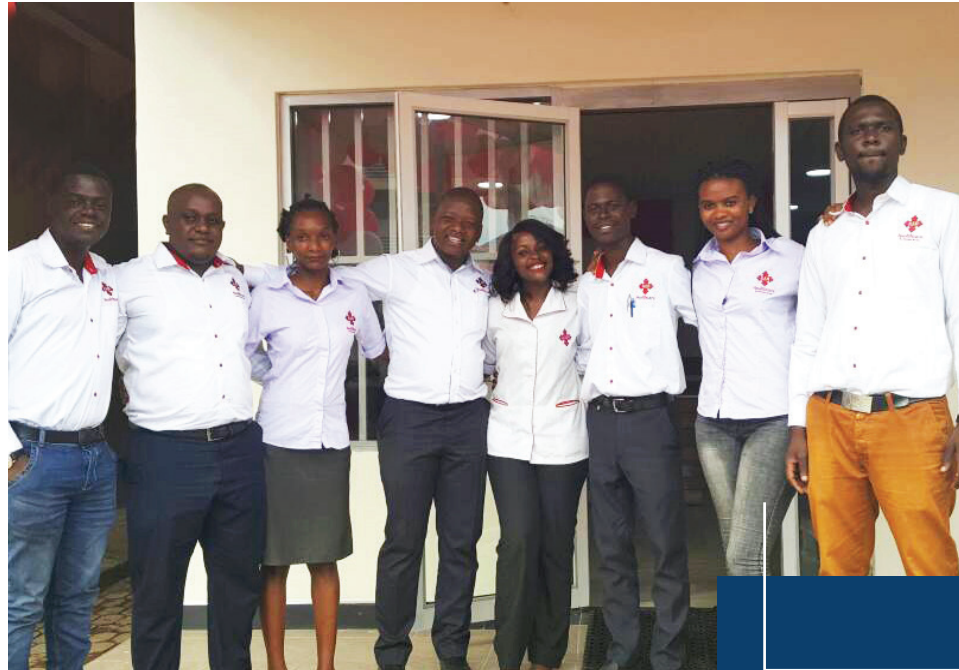
A staff training

Our policies cover anti-corruption and bribery. Every staff member signs a this policy. External and internal audit has also shown that there is no issue as far as this is concerned. We also have in place an online whistle blowing policy which the management staff have been trained on.