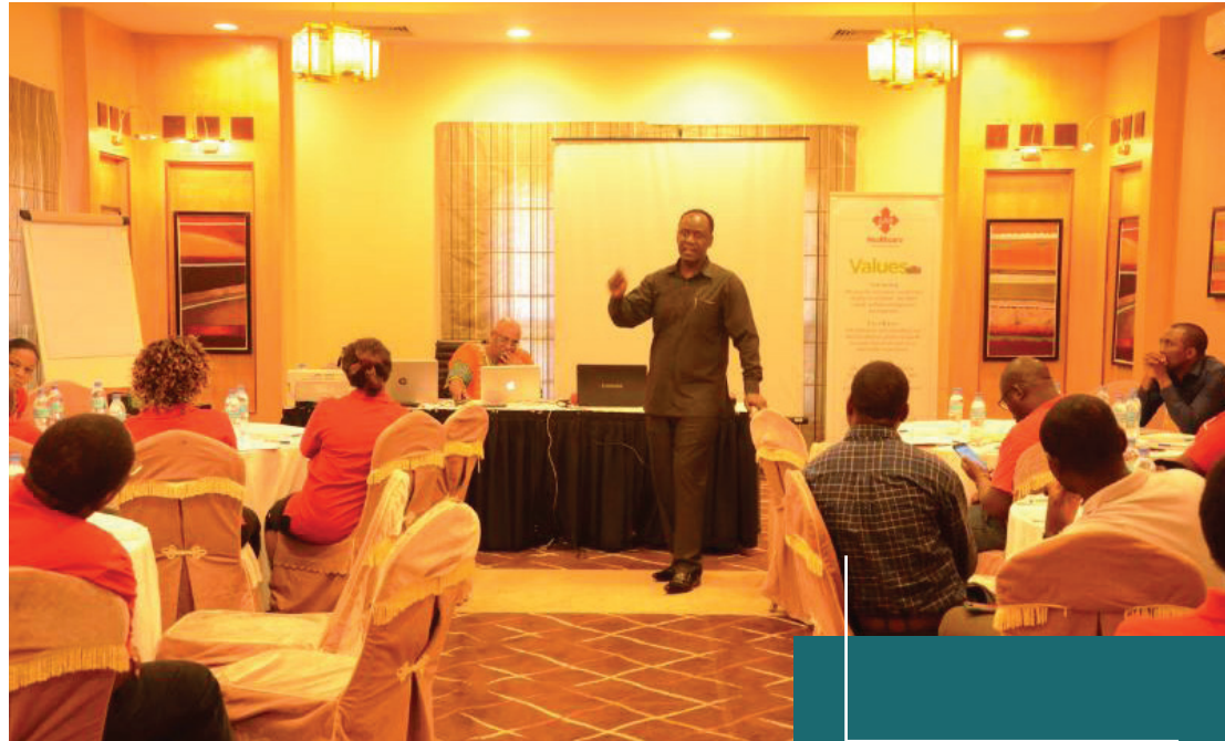
AARHC Tanzania management team in a training

The whistle blower policies ensures that all staff and our partners can voluntarily provide information on any intended or occurred events that may be perceived as accomodating corruption or unacceptable practices.