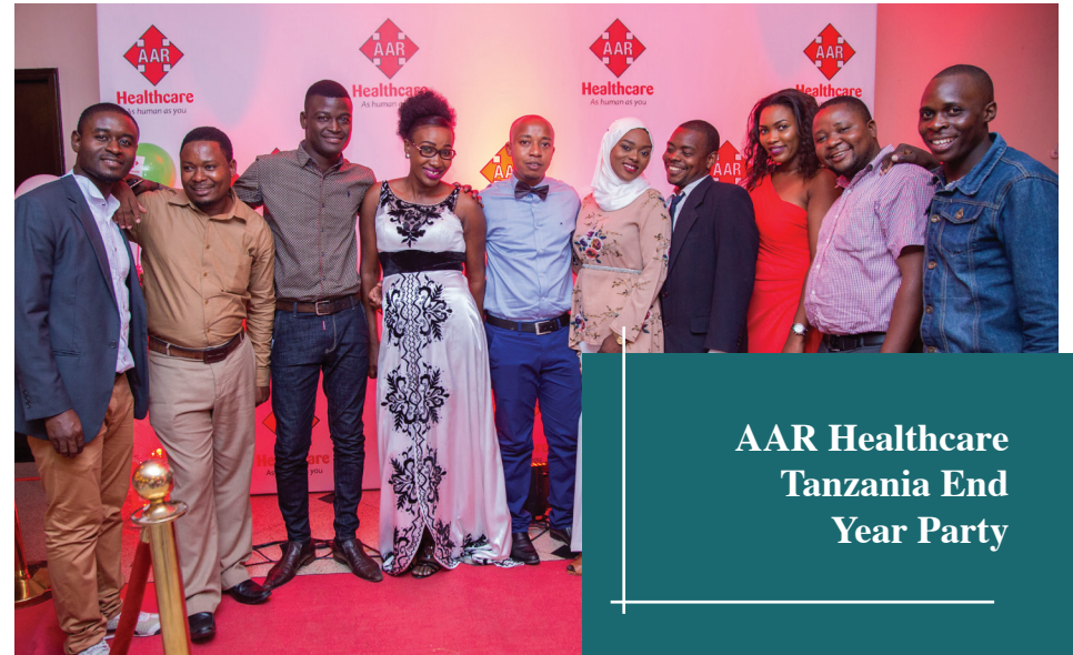
AAR Healthcare Tanzania End Year Party

grievance procedures are followed to address complaints, handle appeals and provide recourse for employees. We provide staff training on non-discrimination policies and practices, including disability awareness. We commit to reasonably adjust the physical environment to ensure health and safety for employees, customers and other visitors with disabilities and provided by ELRA , 2004 under section 7 (1) "Every employer shall ensure that he promotes an equal opportunity in employment and strive to eliminate discrimination in any employment polict or practices"