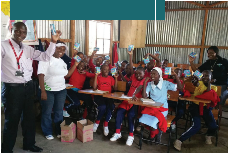
AAR Healthcare Tanzania staff donating sanitary towels to a Primary school in Arusha Region

including civil society organizations, and finally the company have an explicit policy to ensure that its security arrangements do not contribute to human rights violations, adhering lay off by involving trade unions without impeding staff rights due payments and fairly compensation for salary rise based on assessed performance and non performer awarded accordingly