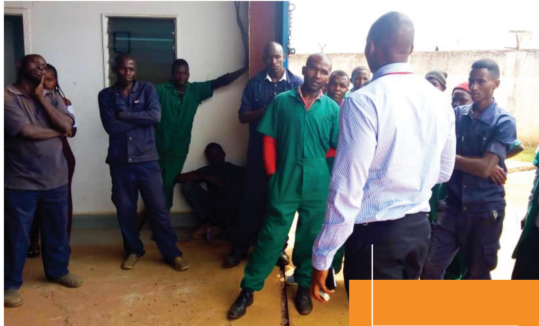
A staff stakeholder activity with institutional corruption as one of the key topics discussed

Our policies cover anti-corruption and bribery. Every staff member signs this policy. External and internal audit has also shown that there is no issue as far as this is concerned. We also have in place an online whistle blowing policy which the staff have been trained on.