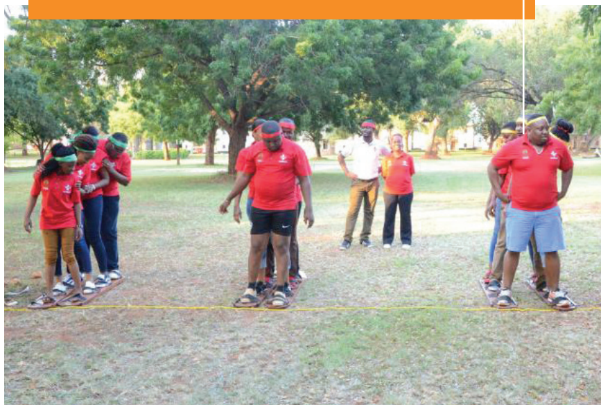
AAR Healthcare Uganda staff in one of our team building activities

AAR Healthcare Uganda also operates under internal systems and policies that promote protect human righty like; The grievance policy and whistle blower's policy among others. AAR subscribes to and upholds the patients' right charter to maximize benefits and protect rights of all clients that walk through our doors.