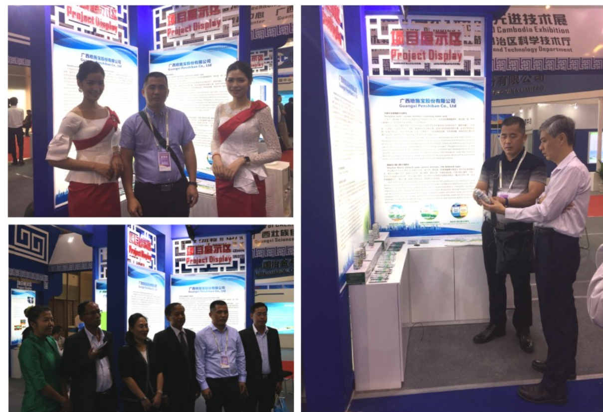
3月30日 喷施宝公司出席2018年中国-东盟博览会柬埔寨展。 March 30 Peshibao attended the China-ASEAN Expo 2018 Cambodia Exhibition.