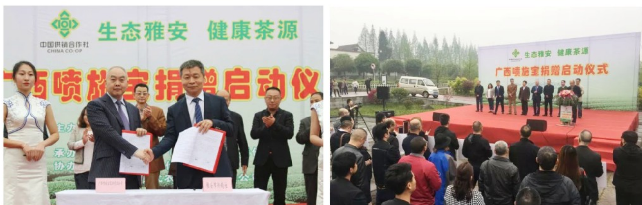
3月30日 喷施宝公司与四川省雅安市供销合作社在雅安市名山区举行绿色农资捐赠仪式。 March 30 Peshibao and Sichuan Ya'an Supply and Market Cooperative held the donation ceremony of green agricultural materials.