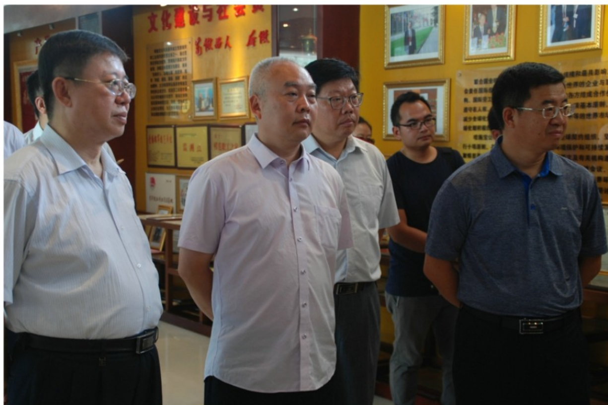
7月6日 国家“十三五”海洋经济创新发展示范工作第二批示范城市督导小组前来公司考察指导。 July 6 The Supervision Panel for the 2nd group of demonstrative cities for National "13th Five-Year Plan" Maritime Economy Innovation, Development and Demonstration visited Peshibao for investigation.