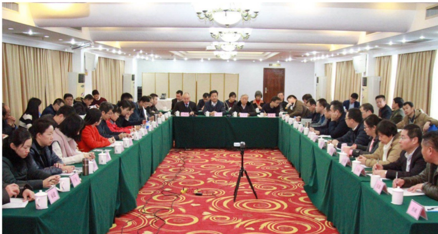
2月2日 农业农村部耕地质量监测保护中心在北海召开2017年喷施宝优质耕地培育技术培训会。 February 2 Penshibao High-Quality Farm Cultivation Technology Training Session 2017 was held in Beihai by Ministry of Agriculture and Rural Affairs Farm Quality Supervision and Protection Center.