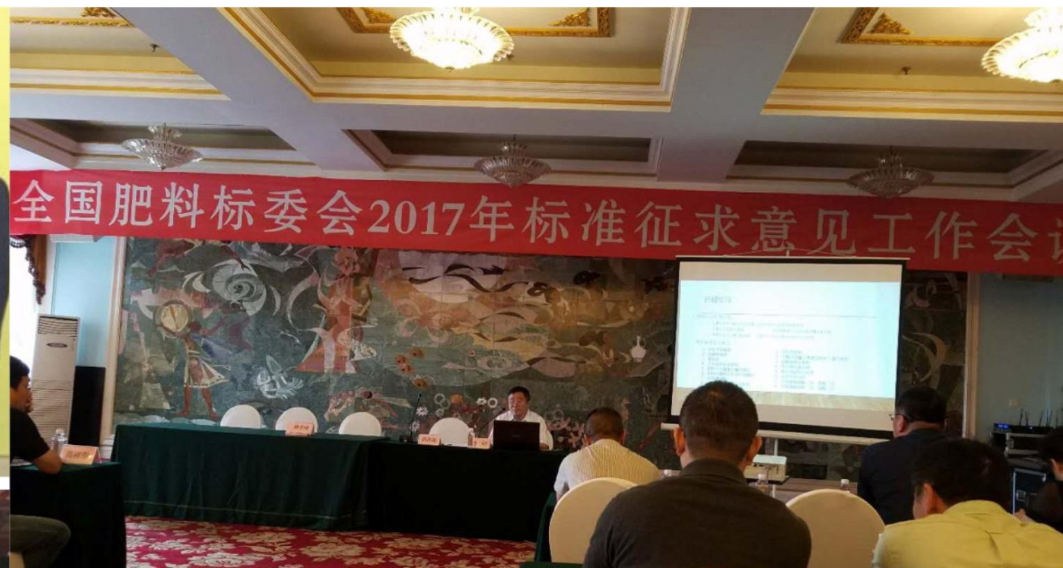
4月25日 喷施宝公司应邀出席生物刺激素国际法规及标准论坛。 April 25 Penshibao was invited and attended the International Laws, Regulations and Standard Forum for Biostimulant.