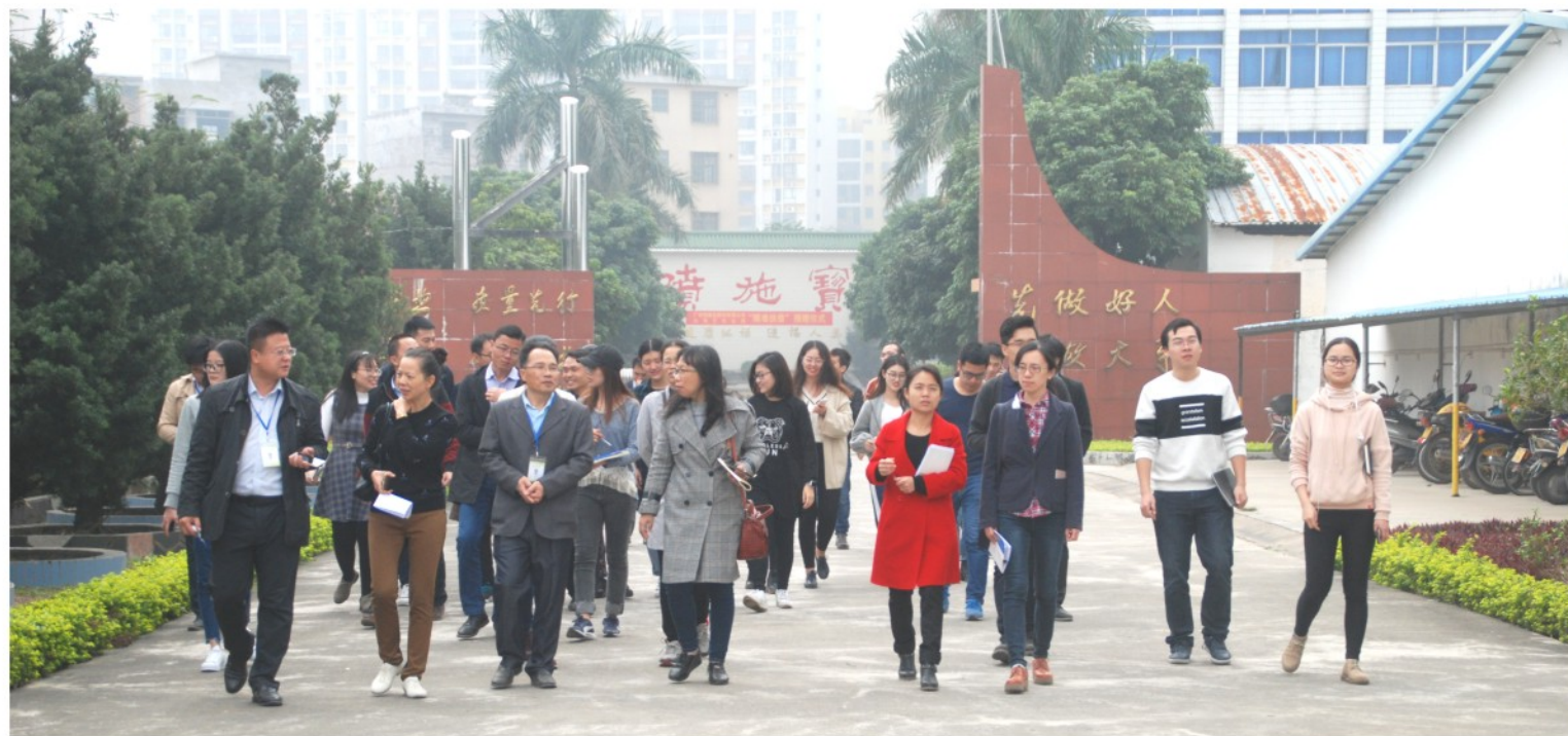
1月25日 广西大学课题组就参与全国特色海洋项目前来公司考察调研。 January 25A research group from Guangxi University visited Penshibao for investigation in relation to the participation in the national feature marine programs.