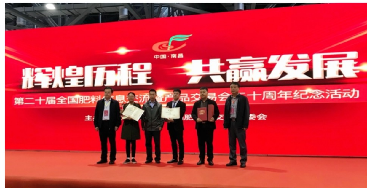
10月16日 喷施宝公司被授予赞助协办全国肥料双交会特殊贡献奖。 October 16 Peshibao was granted Special Award for sponsoring and assistance in the national fertilizer trade affairs.