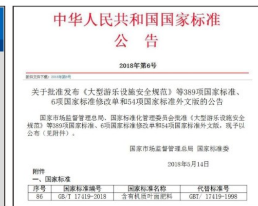
5月14日 喷施宝公司参与起草的有机叶面肥国家标准正式发布。 May 14 Penshibao attended, as a compiler, the official issuance ceremony of national standard on Foliar Fertilizer with Organic Matter.