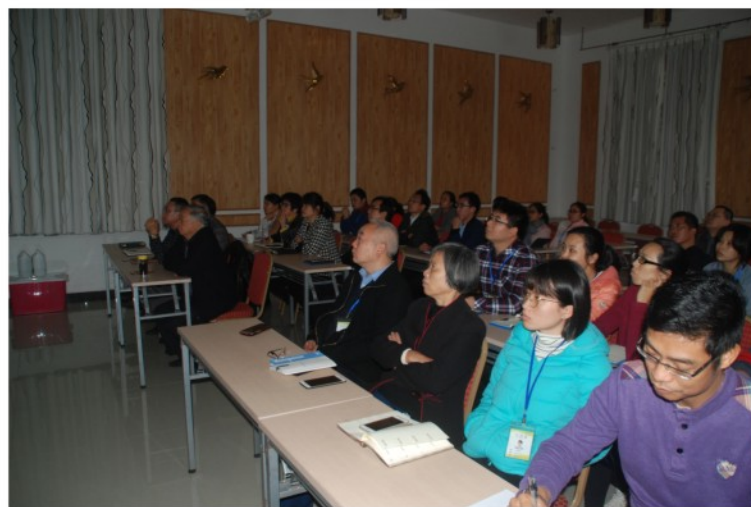
1月15日 2018喷施宝公司新战略研讨会在北海总部举行。 January 15Penshibao Seminar on New Strategies 2018 was held at the headquarters in Beihai.