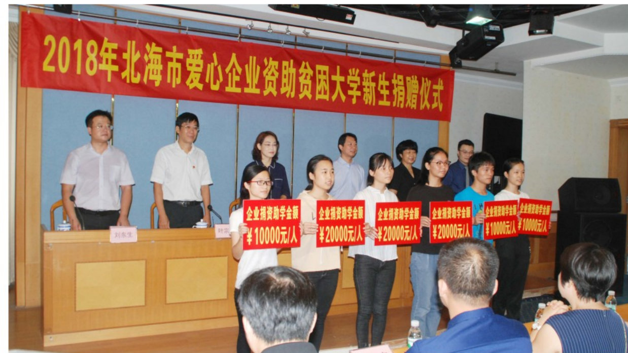
8月22日 喷施宝公司参与北海市爱心企业资助贫困大学生捐赠活动。 August 22 Peshibao participated in the donation activity of Beihai enterprises to impoverished university undergraduates.