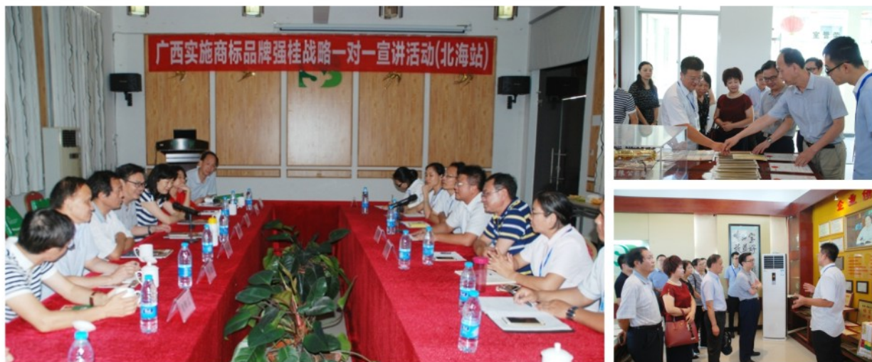
6月3日 广西商标品牌强桂战略宣讲团前来喷施宝公司进行实地调研宣讲活动。 June 3 Strong Guangxi Strategy Promotion Group for Guangxi Brands visited Peshibao for field investigation and strategy promotion.