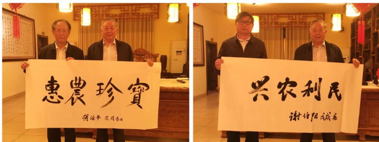
3月15日中央统战部原副部长、全国工商联原党组书记胡德平一行前来公司了解创新发展情况。 March 15 Mr. Hu Deping, former Minister of the United Front Work Department of CPC Central Committee and former Secretary of CPC Committee of All-China Federation of Industry and Commerce visited Peshibao for investigation of latest development of company innovation.