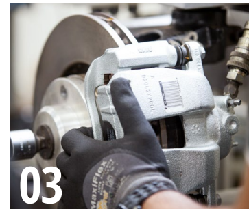
CHASSIS BRAKES INTERNATIONAL A GROUP WE ARE PROUD OF

WE BENEFIT SOCIETY AS A WHOLE, EVERYWHERE IN THE WORLD