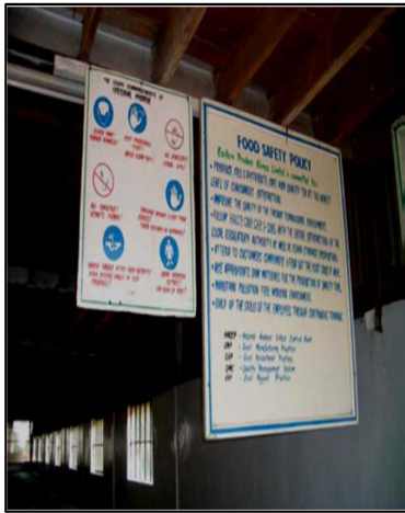
Photo 10: Safety signage within the factories promotes awareness and enhances food handling practices.

product safety and also participate in voluntary initiatives.