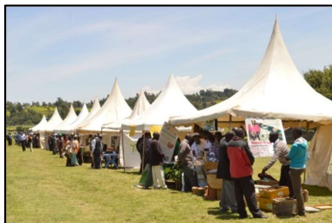
Photo 6: farmers and neighboring communities during one of the Field days

In all our businesses, employees were trained on various aspects of Human rights and their rights as employees. This included communication on their right to join a recognized workers union, right to a safe work environment and right to be considered for employment without discrimination. EPK enhanced this communication by erecting notice boards at strategic points for communicating policies related to social, environmental and safety issues. Trainings and capacity building for employees on human rights issues were conducted and refresher trainings will be conducted in the coming year. Security personnel were trained on conducting body searches to enhance humane treatment of colleagues.