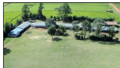
Photo3: One of the 15 primary schools constructed by the company for employees and surrounding communities children of school going age to prevent child labor

While focused on the commercial need to procure goods and services of the required specification and quality on the most favorable terms, we work collaboratively with our suppliers to ensure that availability is sustainable in the long term and that contracts are fair and business relationships are mutually beneficial.