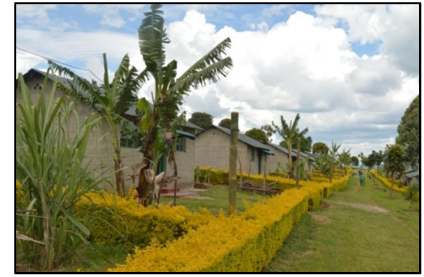
Photo1: Employee housing units in one of our estates

In 2009, the board adopted a new Corporate Social Responsibility Policy to replace the Statement of Business Principles that had been in place since 2005. The Corporate Social Responsibility Policy is available on the Camellia plc.'s website.