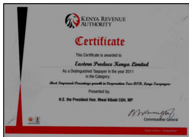
Photo 8: Copy of the certificate awarded to the Company as a distinguished tax payer in Kenya in 2011

Our Core value: - To act honestly, fairly and with integrity and respect in all business dealings. Acting lawfully and honestly is fundamental to our business philosophy. The management of each unit is responsible for compliance with the company codes, thereby ensuring that social and environmental issues are integrated into daily business. The codes are in form of confidential standing instructions referred to as Company Blue, Red, Green, Yellow, white and black books.