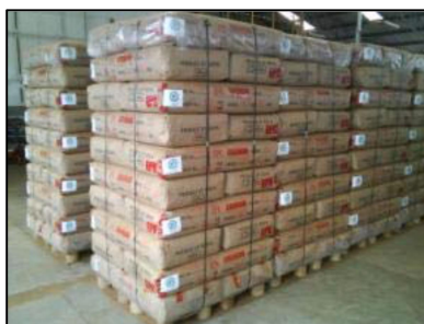
Photo 9: Hygienically packed teas with correct labeling and all relevant information indicated.

Product safety is paramount in all operations from farm, transportation, processing, packaging and freighting to customers destinations. The Operations Director has the overall responsibility for ensuring that the objectives on food safety are met. This responsibility has been communicated to the management in charge of the units. All our tea factories have attained FSSC certification and currently in the preparation phase for FSSC 22000 surveillance audits