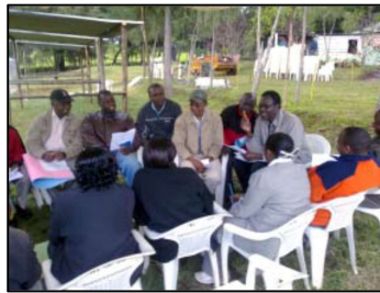
Photo 7: One of the many consultative meetings held by Management for planning purposes, grievance hearing, and monitoring and evaluation purposes

any issues of concern with the concerned and reports to the Top management.