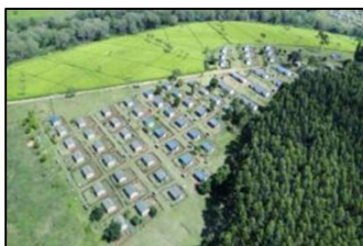
Photo 2: Aerial view of employees housing units in our estates in Nandi Hills

EPK directly supports over 10,000 jobs in a wide variety of positions involving tea plucking and tea bush management, specialist skills, different crafts and the full range of business activities and machinery operation in the tea factories. However, the people depending on our business for their livelihood are much more than listed above.