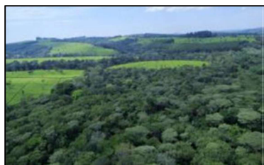
Photo 4: Aerial view of the tea field intertwined with forestry cover in a bid to enhance biodiversity.

Apart from the indigenous forests there are no other natural resources of significance in the area. No mineral resources have been found