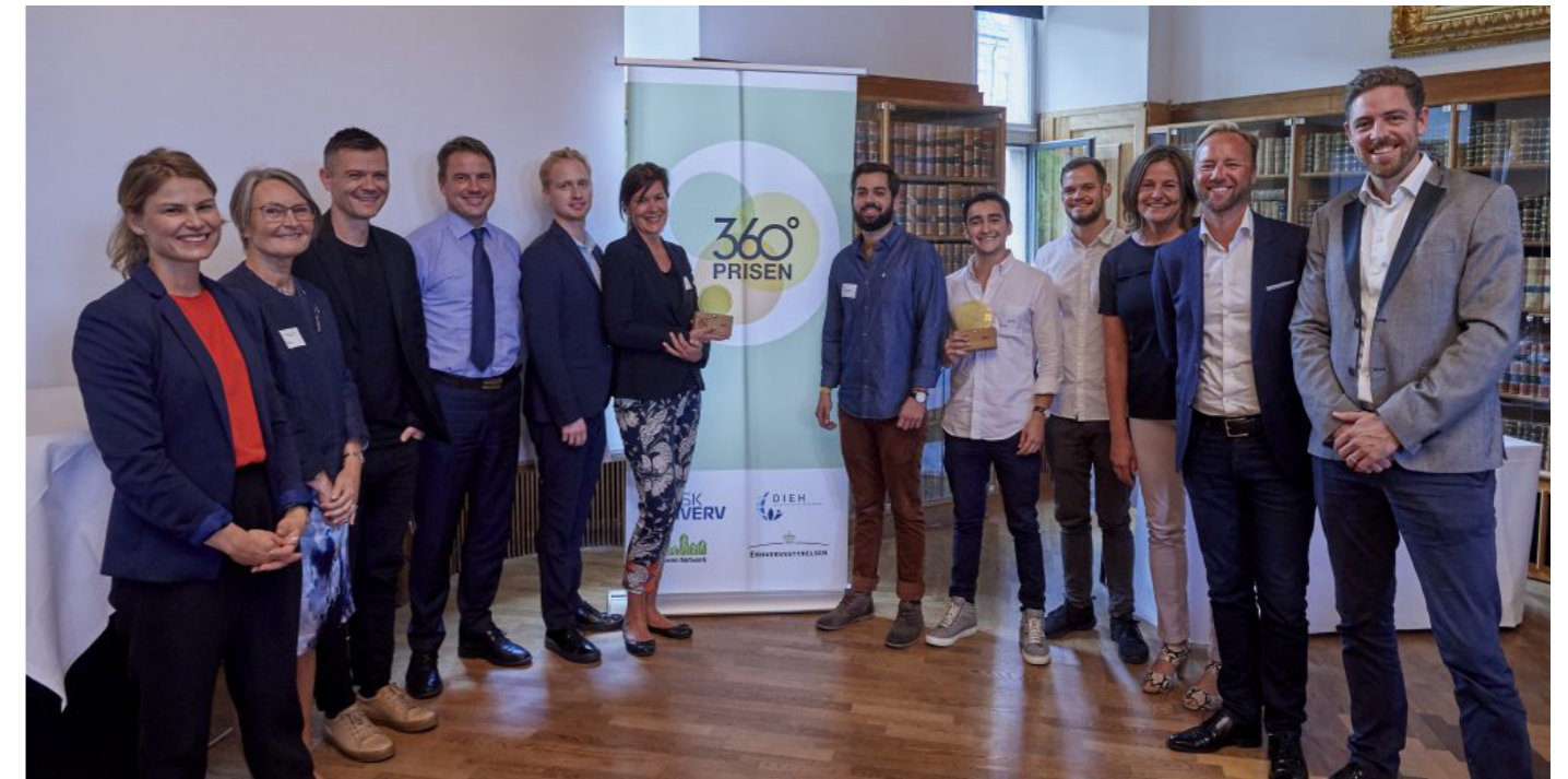
The 360 degree prize was in 2018 awarded to Bluetown and Kaffe Bueno at Børsen in Copenhagen.

The global agenda and the complexity of the issues does, however, pose a challenge, especially when it comes to the small and medium sized enterprises. Therefore, we have started to offer introductions to the SDG's as a permanent activity in our event programme. Furthermore, we have integrated the SDGs in our Sustainable Business Partner-certification and training and in our custom advisory services.