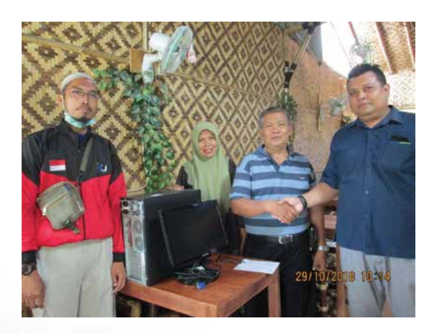
Supporting the local government for 1 set personal computer and Printer at Ciracas Village, residential environment near Head Office Jakarta . 29 Oktober 2018