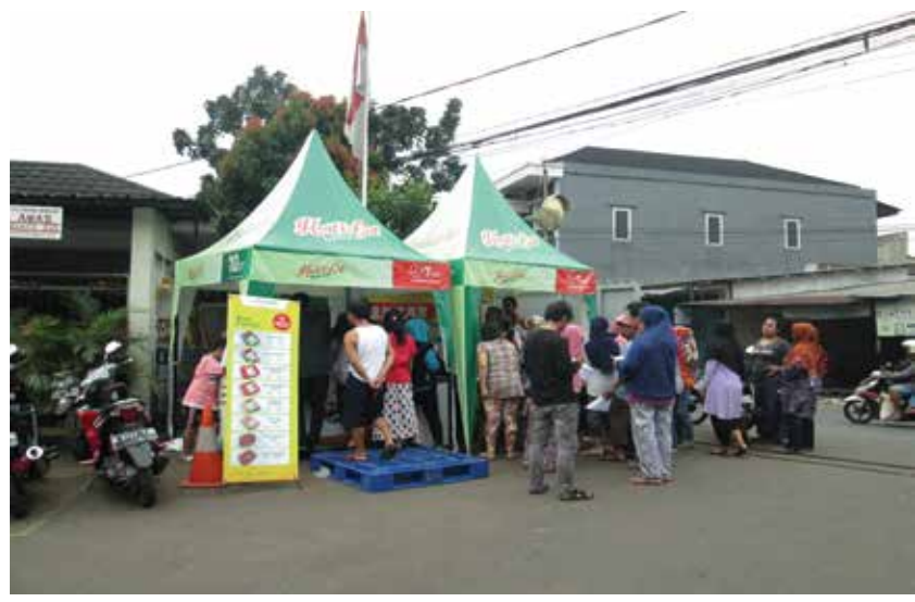
Bazaar Ramadhan of our product to people surround office Area - Jakarta