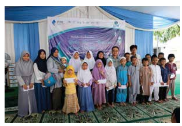
Donating for Orphanage at surround environment of Head Office Jakarta - Ramadhan Season 2018