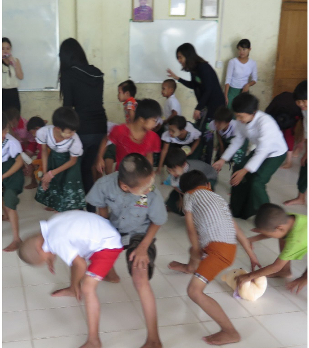
The team teaching kids how to play harmoniously as a team.