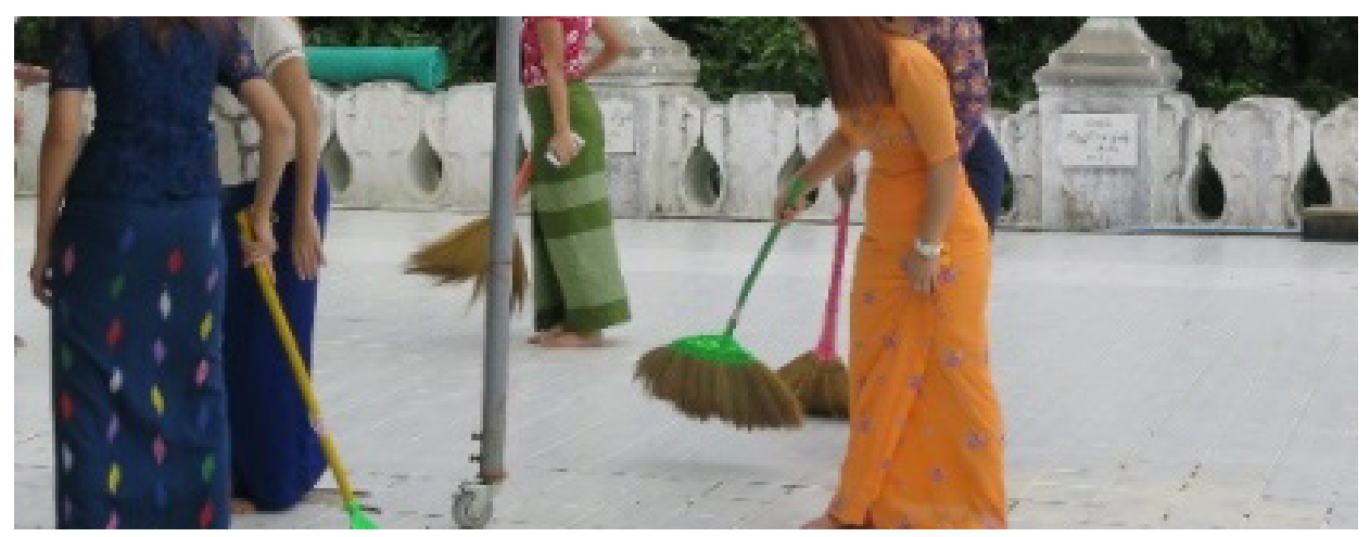
Our team sweeping at the walkways and praying area of the Alan Pya Pagoda.

The MCC team swept and cleaned at this pagoda for the first time in July this year. We were in awe by the majestic image of the reclining Buddha.