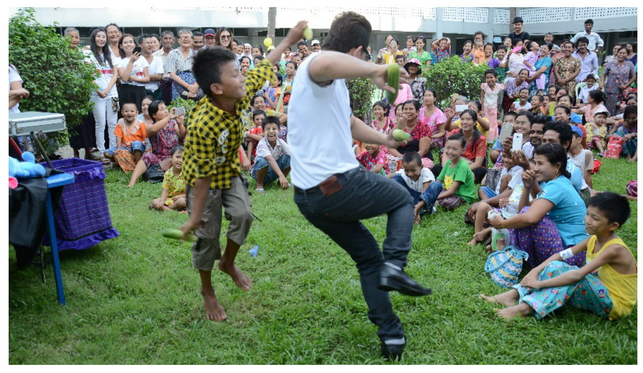
A magical dance performed together with the magician and a volunteer kid.

The magic of the day continued with a fun game of ball tossing. Winners of the game could then have the chance to win one of these thoughtful prizes including coloring books and crayons, lunch boxes, water bottles, stuffed toys, baby mild powder sets, and two grand prizes of giand stuffed toys. It was a sunny afternoon and the air was filled with laughter and cheers. It is a blessing to be able to show our care and put smiles on the faces of children with medical conditions.