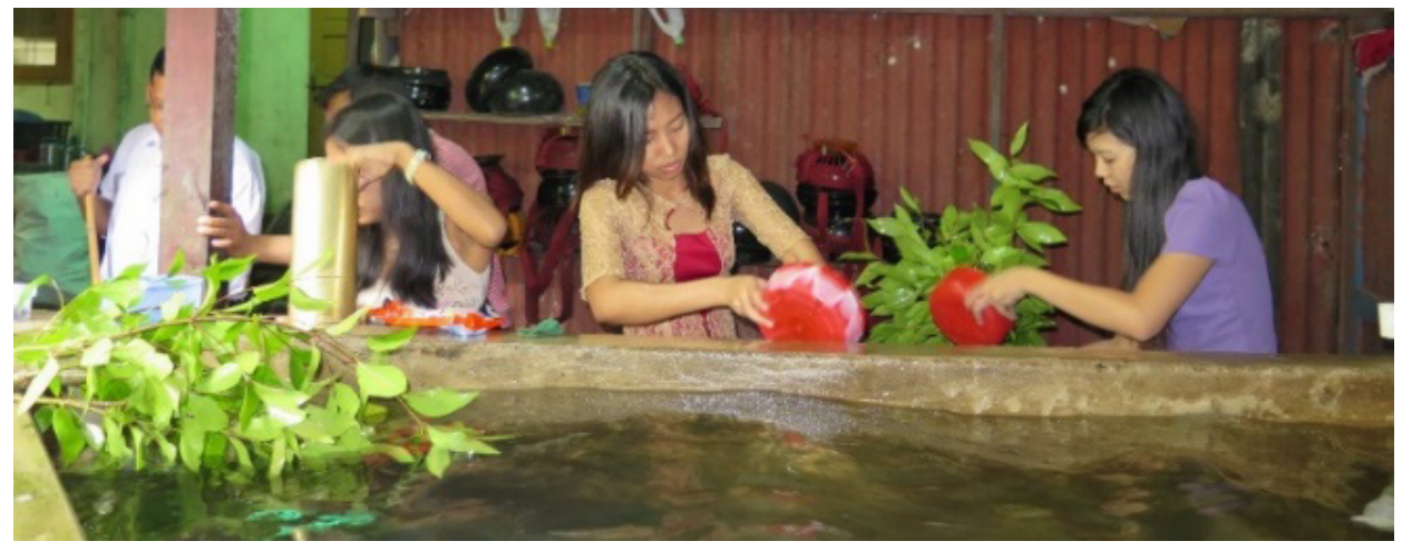
The girls cleaning vases which are placed at the Buddha shrine.

The Tant Taw Mu Monastery is located near a small pagoda near the Mahawizaya Pagoda. Being in the neighborhood of the two most famous pagodas, the monastery and the pagoda itself do not get many visitors. Marga has made several visits and has been donating daily lunch to this monastery. The MCC team made our visits more meaningful by offering our cleaning service, sweeping the floors, cleaning the bathroom area and scrapping off the weeds on the driveway.