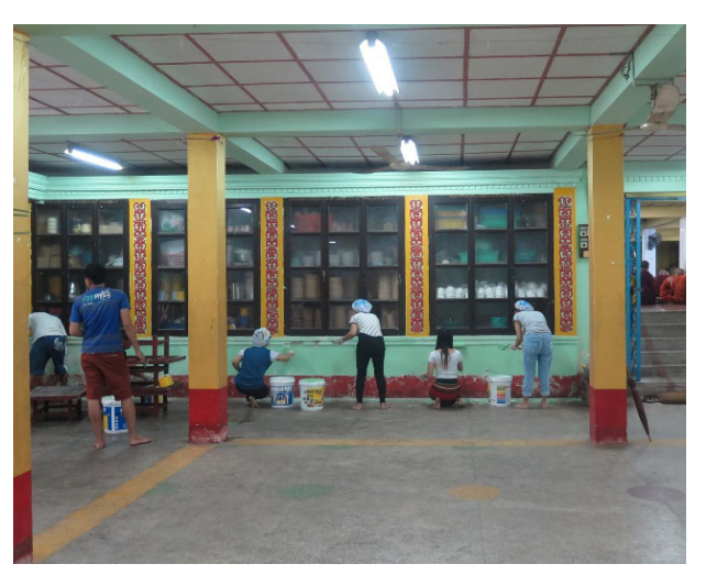
The team pride themselves on giving back to community.