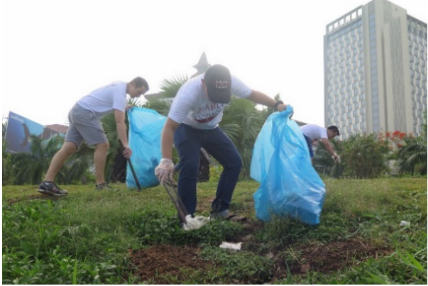
MCC team collecting the trash along the bank of Inya Lake