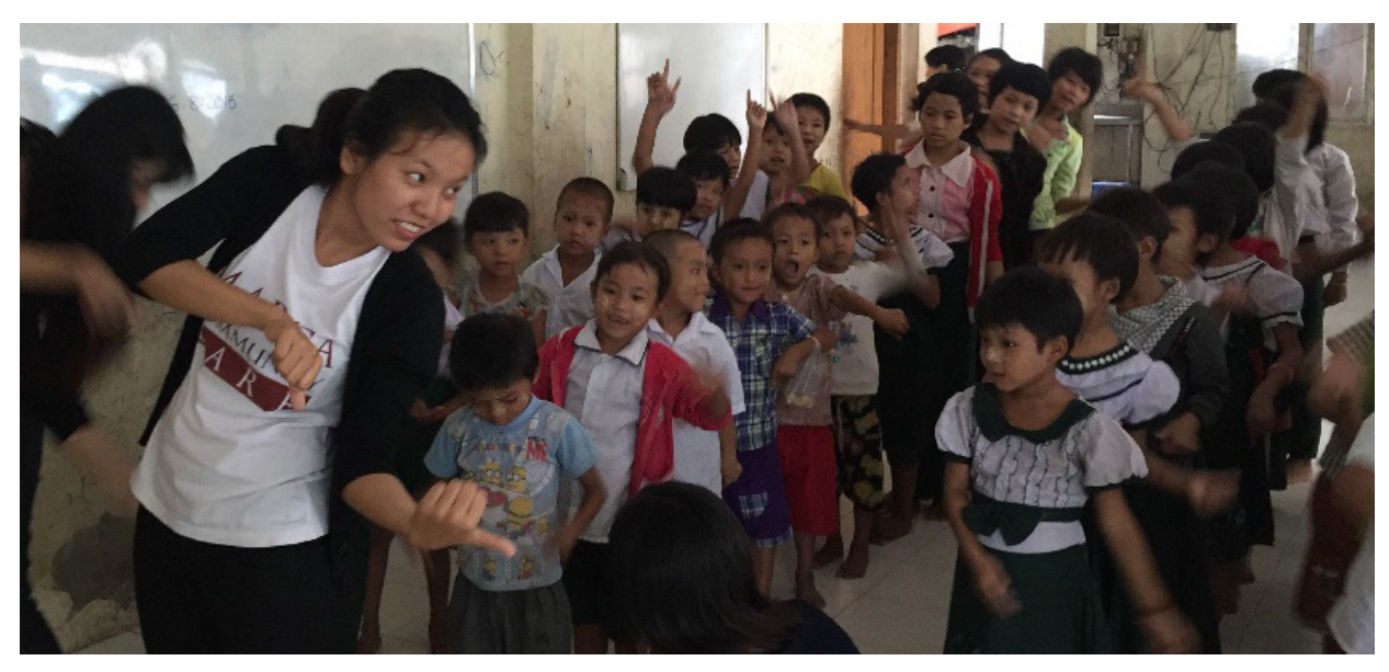
The team teaching the children to dance.