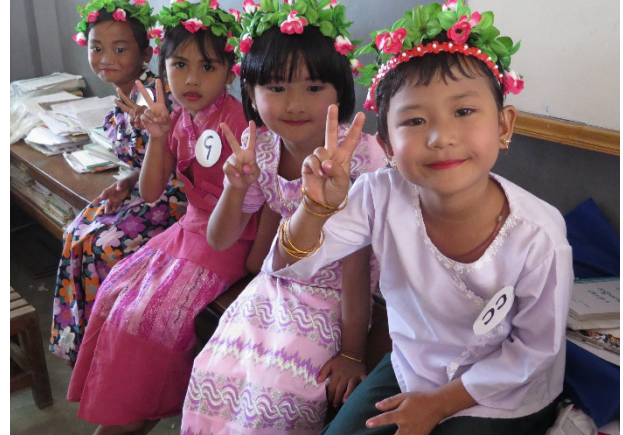
Super cute kids waited excitedly to show off their talents at the "beauty pageant"