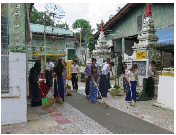
The team sweeping at the walkways of the Sein Yaung Chi Pagoda under the hot sun.