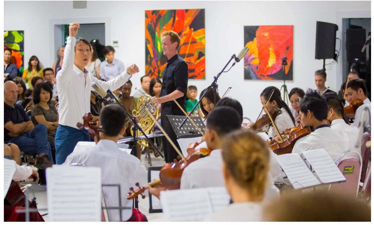
Marga Community Care (MCC)

To date, Marga Landmark implements and maintains one of the country's most comprehensive CSR programs that benefit the lives and address the needs of different groups and communities ranging from disaster victims, orphans, elderlies to young musicians and professionals.