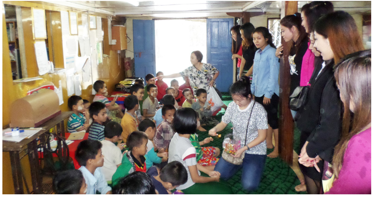
The team distributing the small gifts to the children.

The MCC team visits different orphanages and child care centers on a regular basis because we firmly believe that every child deserves care and affection regardless of their backgrounds.