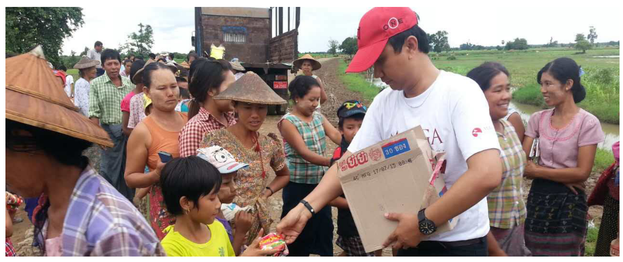
MCC team member passed the relief supplies to flood victims at Pay-Gone Village, Kantbalu Township.

Marga Community Care (MCC) team responded quickly to the victims' call for help and mobilized two teams comprising 15 staff members in total to deliver emergency aid to victims at Sagaing Division and Magway Divisions, two of the worst hit areas.