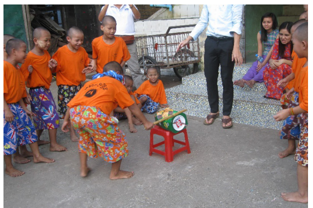
The team-mates of the winning team watched anxiously as he hit The team excitingly cheered a kid as he was preparing to hit the the tin at the final round.