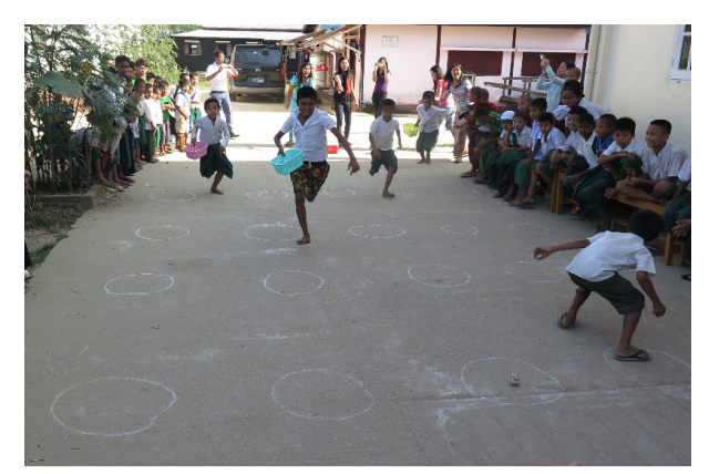
Look who is the fastest collector of potatoes!

We understand that a fun day wouldn't be complete without delicious food. So our team made a few pots of milk porridge for the children to enjoy before the games, and then quenched the thirst of the sweaty children after the "actions".