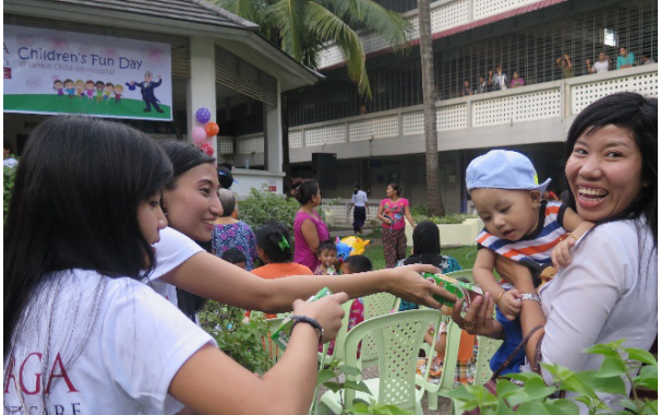
Happy faces of children and their guardians participating in our Children lining up to participate in basket-ball-throwing game children's fun day event