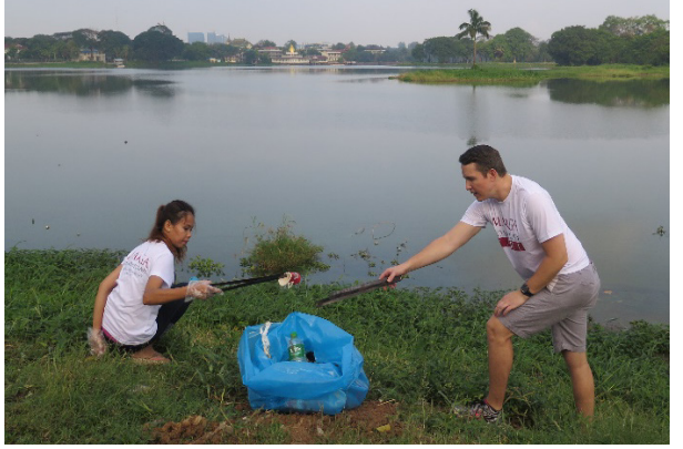
Volunteers collecting the trashes along the lakeshore