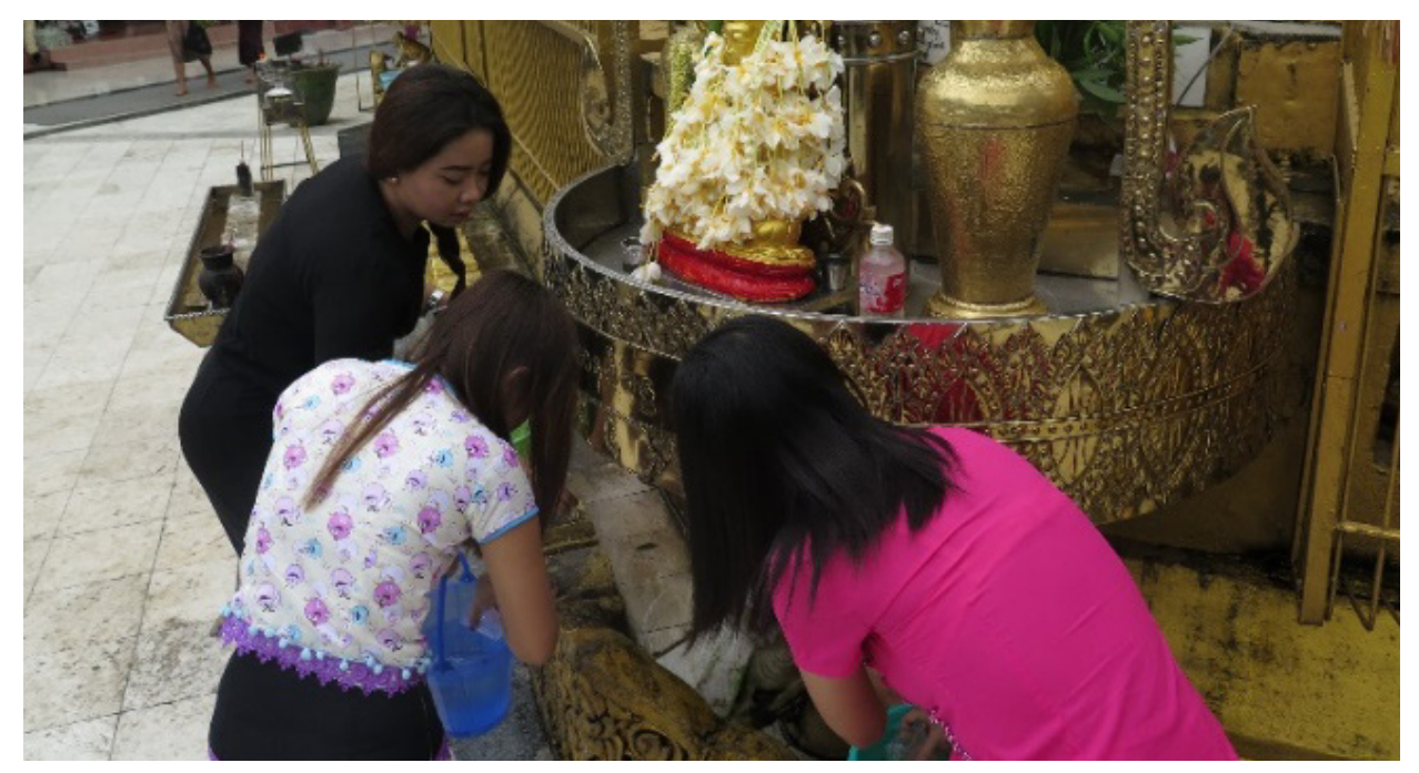
The team refilling the urn with water.

The Moe Kaung Pagoda, located in the Yankin Township. The MCC team swept the walkways, the corridor and the praying area of the pagoda with the good wish for the visitors of the pagoda to be able to worship and walk in the clean pagoda premises.