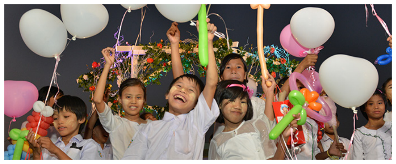
Marga Youth Foundation Donation (MYF)

Since its inception in 2013, MCC had reached out to more than 20 schools and orphanages, 3,000 elderly people and 2,000 disaster afflicted households with donations of cash and supplies, and direct care-taking and assistance.