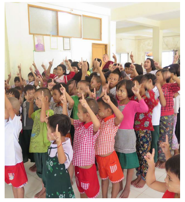
The group who had the best dance moves got the grand prize.

Their happy, genuine smiles are the best reward for us, motivating us to do more good.