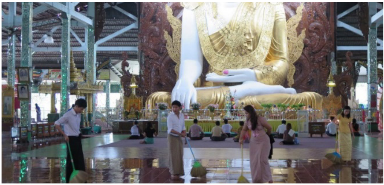
Our team sweeping at the praying area of the Ngar Htet Gyi Pagoda.

The sitting Buddha is a historic feature of this pagoda that dated back to the year 1558. The Buddha image is housed in a pavilion of iron structure with a five-tiered roof. Hence Ngar-Htat-Kyi Pagoda also means the pagoda with five-layered roof.