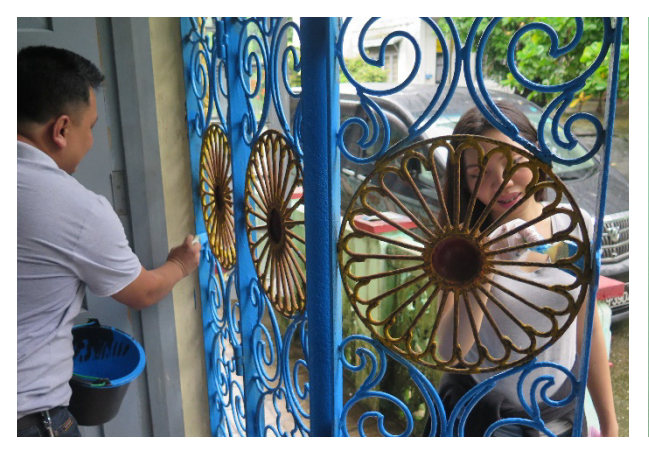
The weather was really nice, a perfect day for painting.

The over-30-year-old Pyinsanikaya Monastery is located on a 6.5-acre compound in Yankin Township. The monastery is comprised of numerous buildings and houses a number of sayadaws and scholar-monks. Maintenance of the monastery is not easy, given its size. As soon as our company learnt about the need for maintenance of the monastery's assembly hall that frequently holds Dhamma talks and ceremonies with attendance by hundreds of pilgrims from the neighborhood and from other parts of Yangon, we promptly responded by donating the necessary cost for the repainting and repair and arranged for a site inspection by a professional contractor. Although much of the repainting works will be done by the professional workers, the MCC team was eager to offer a hand as a way to pay respect to the decades-old establishment.