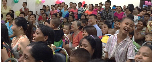
The children and their parents had a fun time together.

"We sincerely hope the laughter we shared, the songs we sang together and the excitement of the magic show would give a boost to the confidence and vitality of the hospitalized children. We also pray that they have a speedy recovery and stay happy and healthy in the days to come."