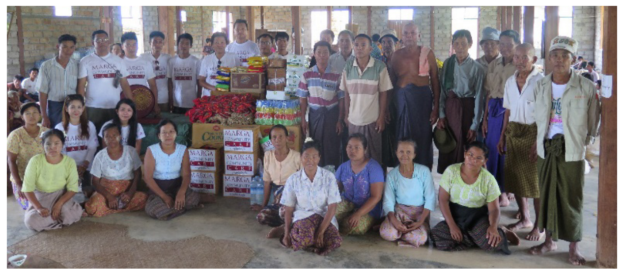
MCC flood relief team with the flood victims at one of the shelters.