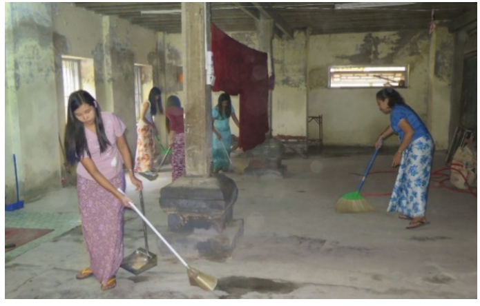
Our team sweeping at the basement of the Danyawadi monastery.