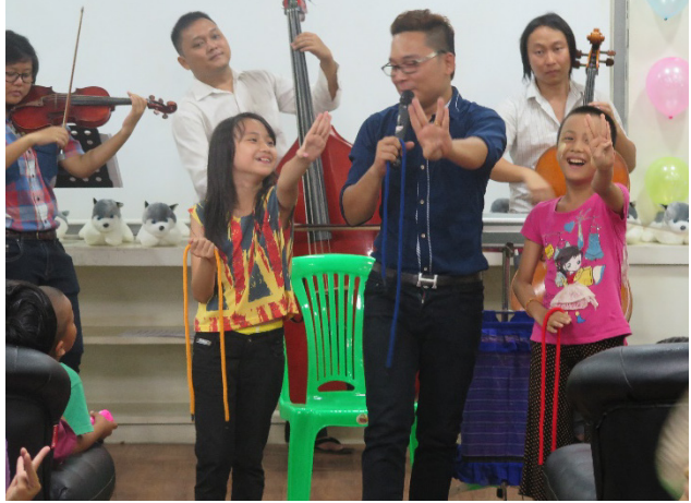
Children enjoyed co-performing with the magician.