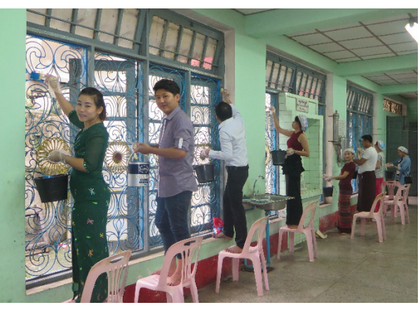
The team had a good time offering helping hands in restoring sacred Buddhist establishment.

In consideration of the need of the monastery as well as the seasonal factor, we decided to finish the repainting in two phases with the first that targeted on the interior of the assembly hall to be finished during the rainy season. The last phase would be completed when the dry season returns with focus on the exterior of the hall so as to prevent the new paint from being washed away by the torrential rains that are common in the wet season.