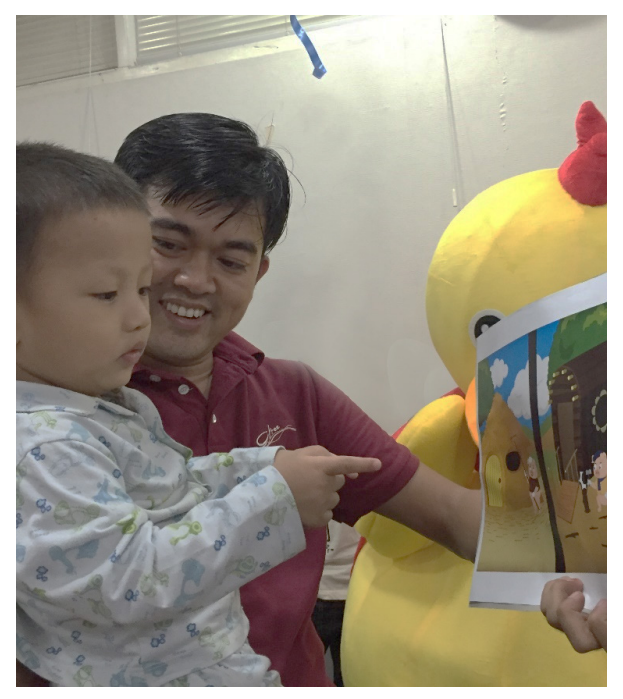
A little boy listened to a MCC member telling the story of "The Three Little Pigs"

The day's program ended with more warm smiles when the children received the soft toys we specially brought for them, and took pictures with the chicken characters. We also got toys for the children who were not able to join us due to their special conditions. "My daughter told me that it is her happiest day in the hospital ever," a smiling mother told us. These words of encouragement really warm our hearts.