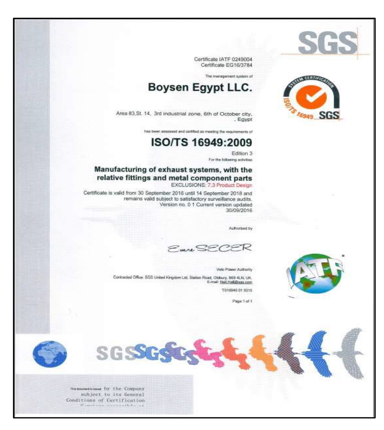
Figure 1. ISO/TS 16949:2009 Certificate