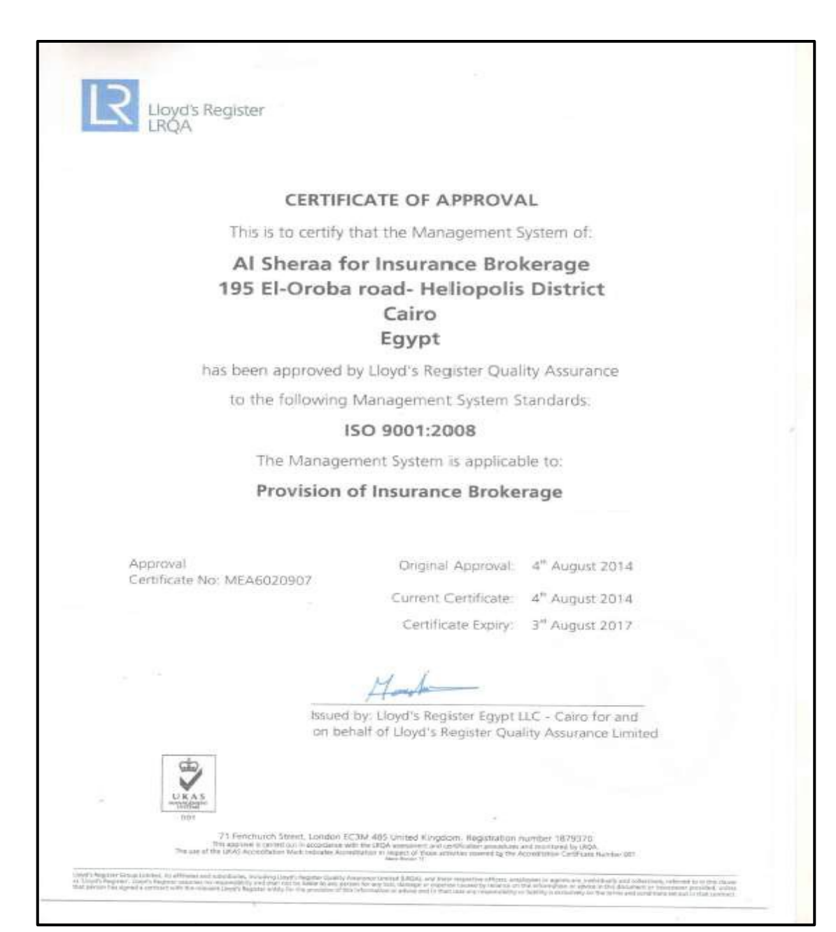
Figure 2. ISO 9001:2008 Certificate