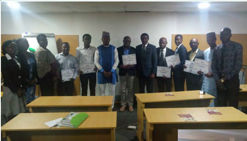
Picture Clips from the Sustainable Finance and Investment Masterclass

In fulfillment of our mandate towards achieving a sustainable world and future, we co-hosted with Fritaz Resources Ltd, on the program: SUSTAINABLE FINANCE AND INVESTMENT SEMINAR for the financial services sector in Nigeria on 20th -21st November 2018. Sustainable finance & Investment is a main topic on the international agenda. Financial decisions worldwide are increasingly influenced by the scarcity of resources, the search for profits through efficiency, and climate change. We observe an increasing investment appetite for green bonds. Investment funds and asset managers worldwide search for innovative products that increase profitability but also create environmental and social value. We are also now in the era where environmental and social risks become reputational risks, credit risks, and financial risks to financial institutions. In view of these new developments, we identified the urgent and imperative need to educate operators in the financial services industry in Nigeria on why Sustainable Finance is most critical for the well-being of their various institutions and the country in general.