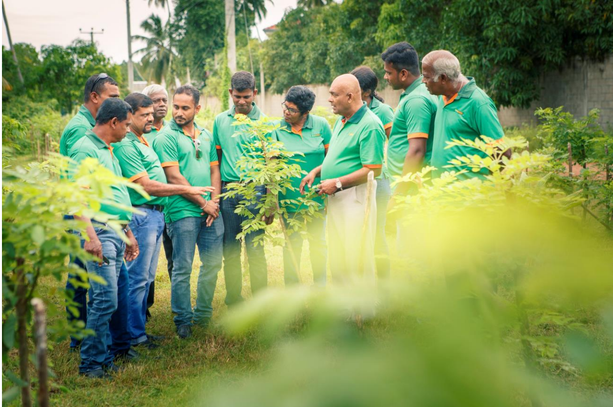
Picture 3- Field Officers are trained well by experts as they are the face of the Company at ground level.

Farmers shall freely decide without any manipulation or coercion on their participation in the project activities (including trainings). Field Officers seek prior consent of farmers by endorsing the data uploaded on the registration form and by signing the Agreement before starting any activity. In addition, PLanT IT Platform through which the farmer registration is done has a Data Consent Agreement attached with the registration through which the farmer gives his/her consent to participate in the program. Farmers' decision to participate is based on the information provided by the Field Officers (about the company and its activities) and the terms of the Agreements. Also Biomass Supplies (Pvt) Ltd ensures that farmers fully understand the Agreement by translating it into local languages (Sinhala and Tamil).