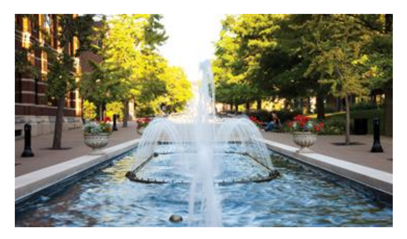
Dean B. McFarlin, Ph.D.

Green power is zero-emissions electricity that is generated from environmentally preferable renewable resources, such as wind, solar, geothermal, eligible biogas, biomass, and low-impact hydro. Using green power helps accelerate the development of new renewable energy capacity nationwide and helps users reduce their carbon footprints. Thirty-six college conferences and 98 schools in this year's challenge collectively used nearly 3.2 billion kWh of green power.