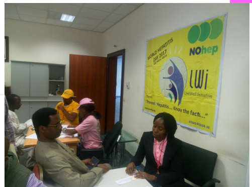
WIHA & LWI Screening / Counselling at Aso Rock