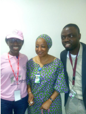
Senior Special Adviser to the President at Aso Rock with LWI and WIHA