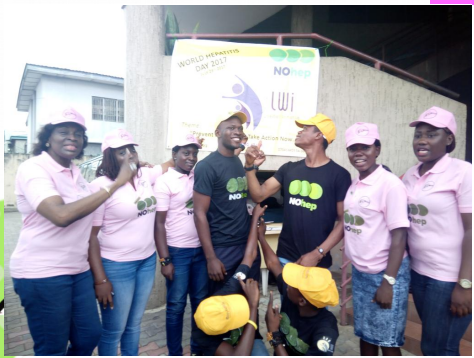
LWI & WIHA in Corporate Neighborhood Hepatitis Screening Advocacy and Awareness Programme at Gbagada Lagos