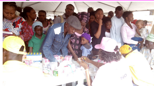
Screening, Awareness, Advocacy and Provision of General Awareness, Free Medicines at Faithbased Community Health Outreach