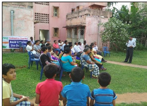
Residents of Ukkunagaram