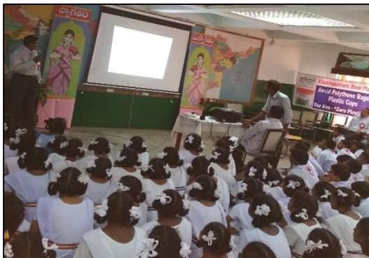
Visakha Vimala Vidyana

Awareness sessions were conducted on plastic waste and its proper disposal to the Students in Schools and the Residents in Ukkunagaram township. The program was organized in association with the Town Administration Department.