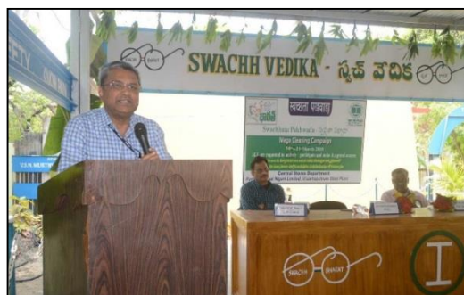
Inauguration of "Swachh Vedita" at Central Stores