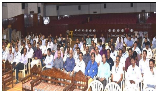
Workshop on 'Slag and Waste Disposal' at RINL