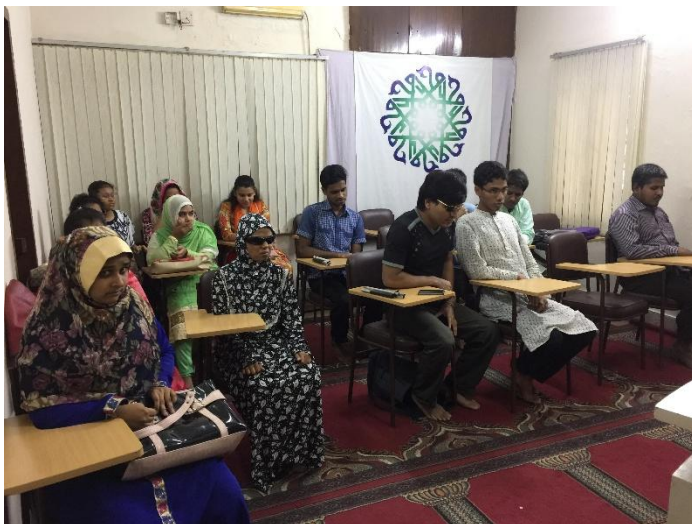
Orientation Class for the Visually Impaired Trainees

Training for visually impaired on Information Technology, PABX & Call Center, and Spoken English: The Institute of Hazrat Mohammad SAW is a think tank which focuses on improving the lives of persons with disabilities through different projects. It provides free-of-charge IT training and free access to its IT center/lab for visually impaired persons. The main components of the IT program is to acquaint students to computer screen reading software, speech synthesizers, and self-voicing software, web surfing, using Microsoft Word, Excel, PowerPoint with JAWS and DAISY. These lessons are aimed towards helping them gain better access to information and enhance their knowledge and learning. Since 2013, the Institute has started training on telesales and call center operations to help visually impaired persons gain employable skills. Till date the Institute has provided training for over 400 visually impaired trainees since its inception in 2003.