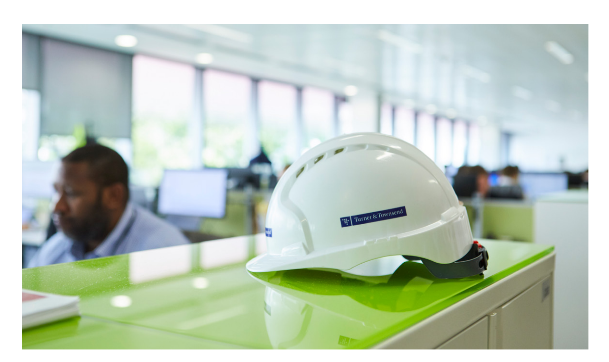
UN Global Compact Communication on Progress 2017–2018