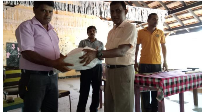
Donation of First Aid boxes to schools