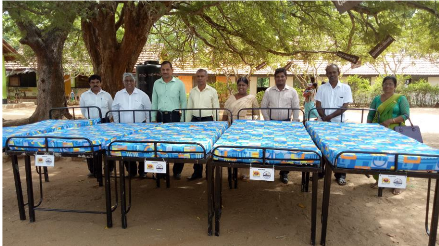
Principals of 5 schools with Aspirations staff (one school Principal was not present)

4 beds were donated by Nawaloka College of Higher Studies and one bed by Aspirations Education Foundation. This is the second step after the training programme conducted by St. John's Ambulance in May 2018. The third step would be to fully train 12 teachers (training of trainer- TOT) and thereafter to set up 6 St. John's Brigades in each of the 6 schools.