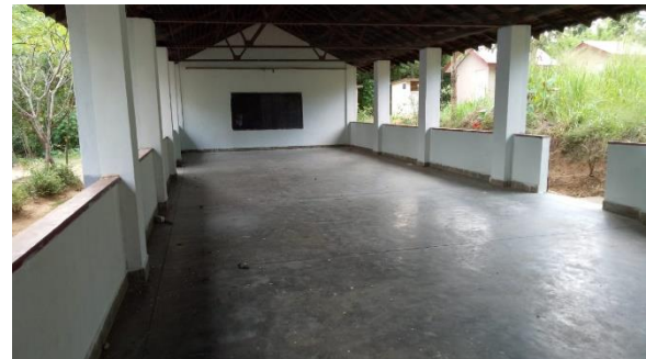
Wire mesh to prevent Pigeons from coming back The Building after the renovation ready for occupation