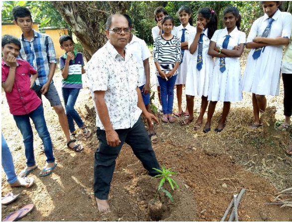
Pethiyagoda school – 50 mango plants