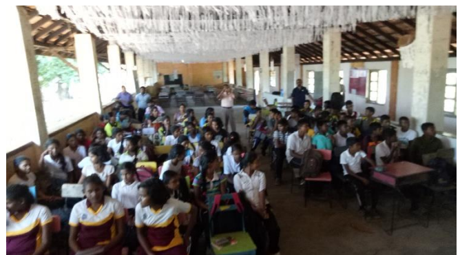
Participants at the session