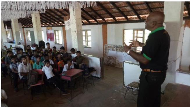
St. John's Lecturer conducting a session