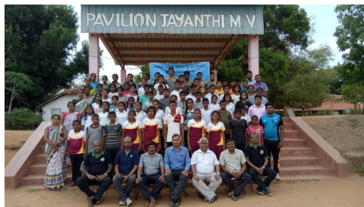
The entire group of participants with the Principal of Padavi Jayanthi Maha Vidyalaya

Lack of First Aid knowledge is a severe problem in rural schools. To bridge this gap in this area, AEF conducted First Aid training programmes for Teachers and Students. AEF has now trained 60 students and 12 teachers (male & female in equal numbers) from 06 Schools in Padaviya with the assistance of St. John Ambulance, Colombo.