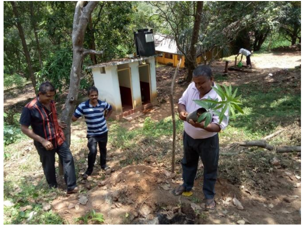
Ritigaha Arawa school - 50 mango plants