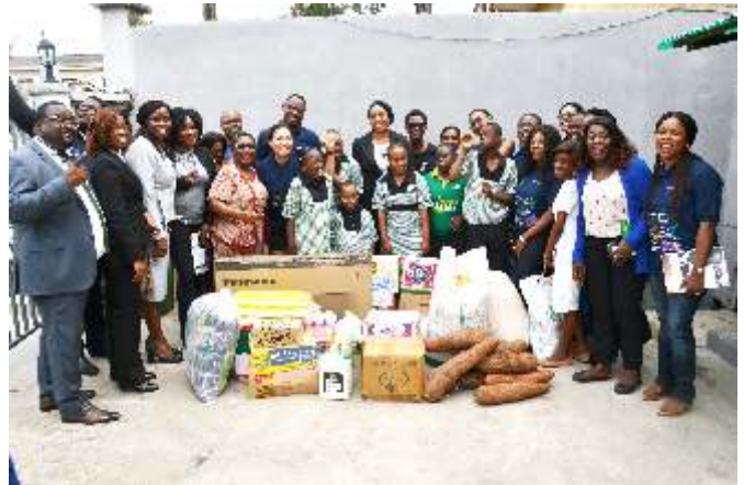
Visit to Down-Syndrome Foundation during the Corporate and Sustainability Week