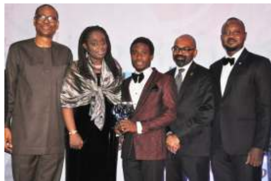
Winner of the FirstBank CFA ethics challenge competition receiving an award