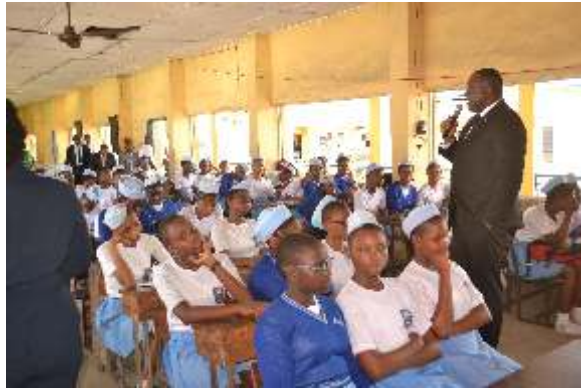
Beneficiaries of FirstBank's Financial Literacy Exercise for Financial Literacy and World Saving's Day.