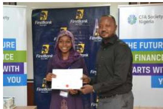
One of the Beneficiary of FirstBank's CFA ethics challenge receiving an award

The Ethics Challenge took place at FirstAcademy, FirstBank's strategic platform for competence development, knowledge management and workplace culture change, on November 9 and 10, 2017; and the final results of the Ethic Challenge was announced during the CFA Society Nigeria's 2017 Charter Award Dinner scheduled for November 12, 2017 at the Grand Banquet Hall, Civic Centre, Lagos.