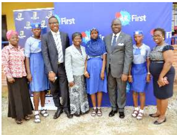
Participant of the Career Counselling session during the Corporate Responsibility and Sustainability week