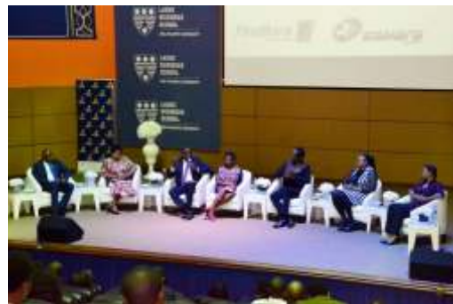
Panelists at the FirstBank's International Sustainability Conference in partnership with Lagos Business School