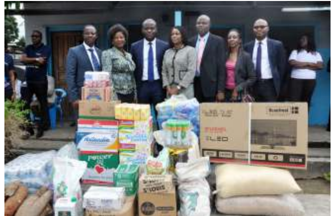
Visit to Old people's Home uring the Corporate and Sustainability Week