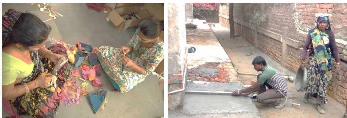
Two women helping with the production of Jugaad products (to the left) and work on the new monsoon wall (to the right).

We also support the orphanage in other ways. The last couple of years we have given the children Christmas gifts and a Christmas party. But in 2017 their Christmas wish was a repair of their monsoon wall, so that was our gift. We also acquire other products from them to give as Christmas presents for partners and other business purposes.