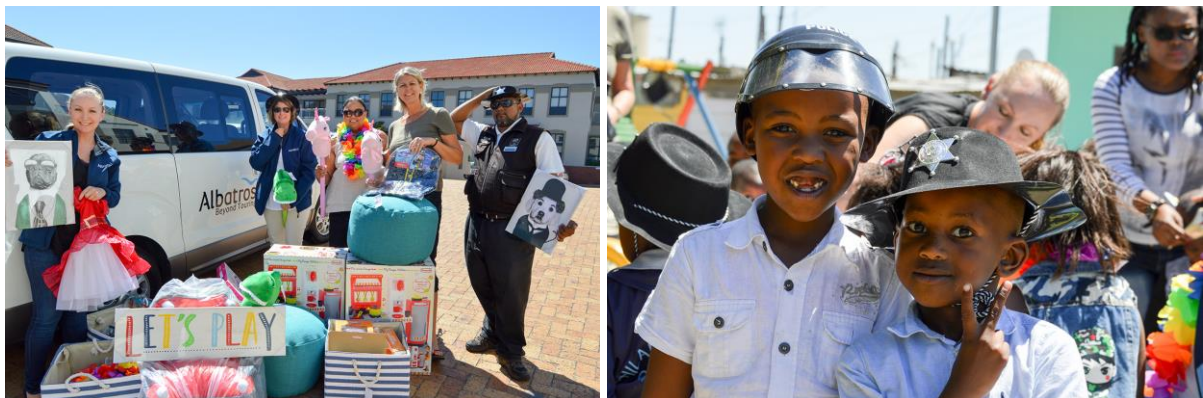
Albatros employees from our Cape Town office with the new toys (on the left) and two boys at the Philani kindergarten wearing the new police costumes.

We try to help where we think the need is big and where we think our small scale contributions can be of help. We are not philanthropists but we help to make a small difference. In this sense, we donated toys for a kindergarten in Cape town run by the organization Philani. Both Albatros and employees contributed to this small Christmas project. We also built a new staircase for a school in a rural area in Colombia.