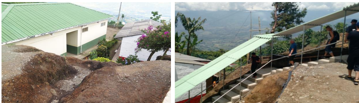
Pictures from the project in Colombia; The muddy slope down to the school with no staircase (the left) and the new cemented staircase with sheltering roof (the right).