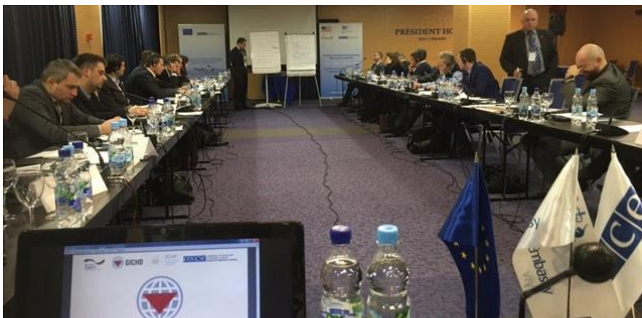
Picture 11.0: Presentation to the Ukraine National Mine Action Authority (NMAA) legislation workshop, Kyev.

Principle 10: businesses should work against corruption in all its forms, including extortion and bribery.