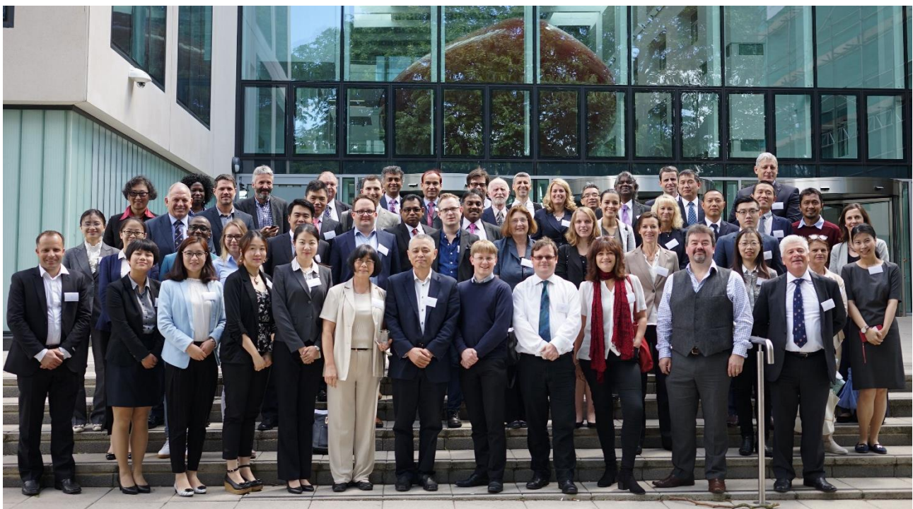
Figure 9.0: Future in Partnership and presentation with Southampton Business School, Southampton Solent University.

Continued Board Membership status with the Department for Food and Rural Affairs (DEFRA) Marine Industry Liaison Group (MILG) for dealing with explosive contamination in the offshore environment.