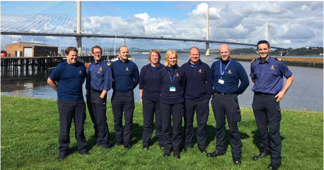
Picture 4.0: Delivery of Operational Response training to Her Majesty's Coastguard (HMCG) service Senior Managers, Queensferry, Scotland.