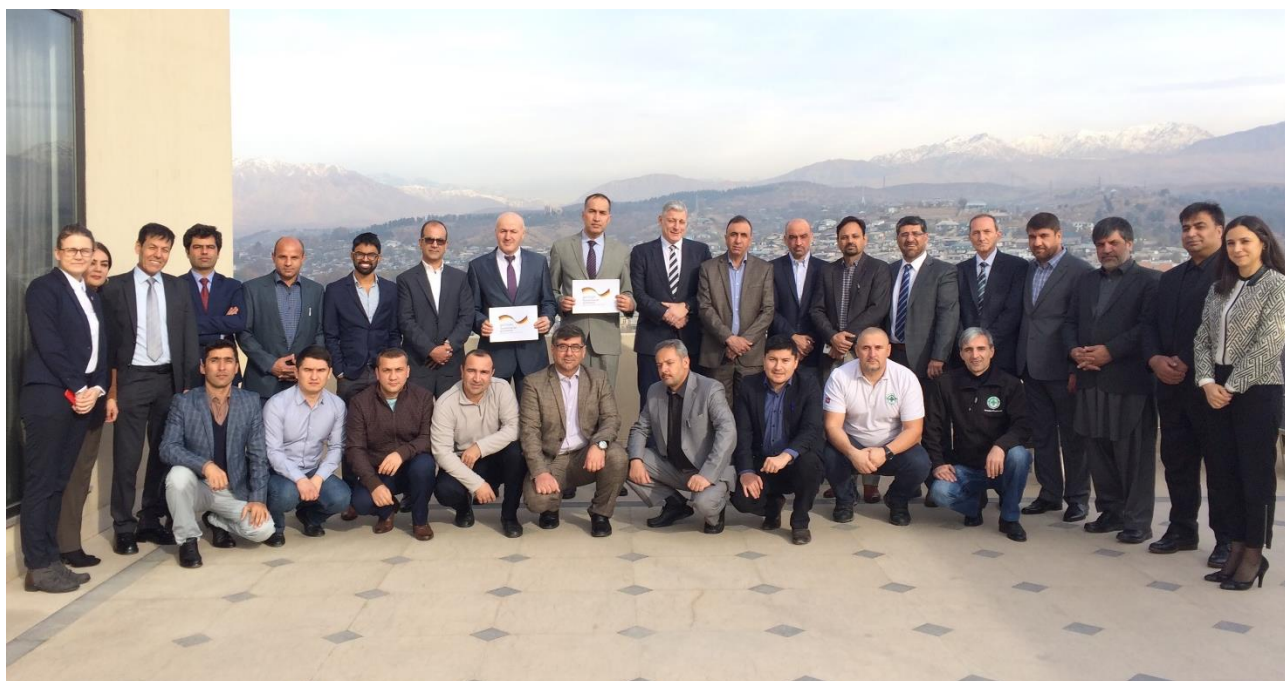
Picture 2.0: Battrick Consultancy delivery of the GICHD Legal Efficiency workshop for Afghanistan and Tajikistan National Mine Action Authorities.

Presentation and attendance at the Ukraine National Mine Action Standards (NMAAS) workshop, Kyev.