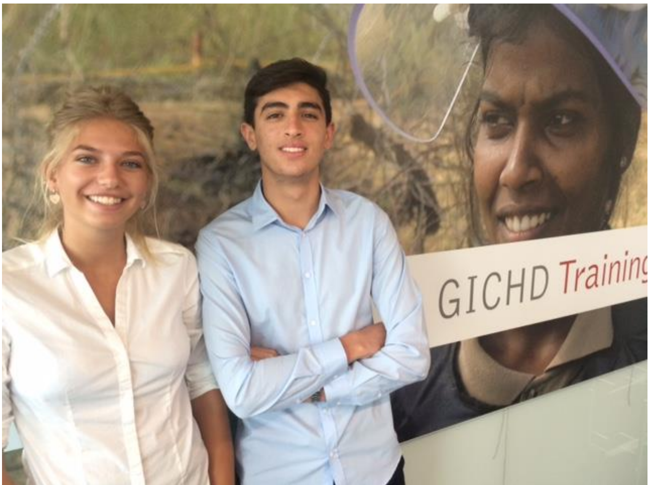
Figure 7.0: Battrick Consultancy sponsored student work experience with the Geneva International Centre for Humanitarian Demining (GICHD)

Any contravention of human rights will be documented, and the responsible partner will be placed on probation and given a timeframe to address and resolve the issue. Continued non-compliance will result in the partner relationship being terminated. Senior management will audit suppliers annually without any warning to ensure that they are working within the defined guidelines of human rights.