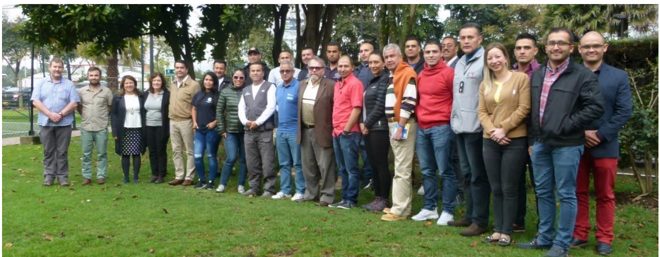
Picture 5.0: Delivery of Quality Management workshop for GICHD, Columbia.

Board Member of the Department of Environment, Food and Rural Affairs (DEFRA) UK Marine Liaison Group (MILG).