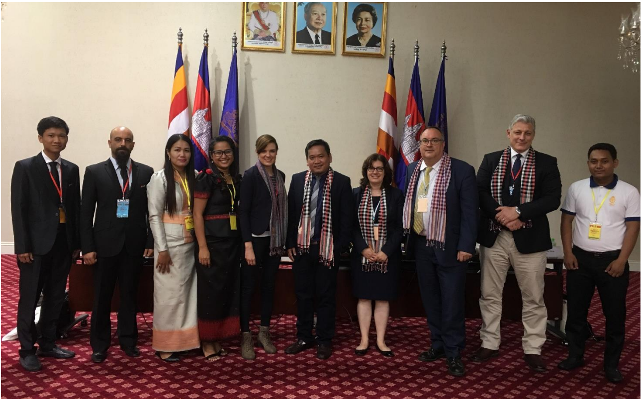
Picture 3.0: Presentation at the Cambodian Mine Action Authority, Phnom Penh with the GICHD compliance team.

Battrick Consultancy is an independent consultancy specializing in security, defence and explosive risk activities. The company conducts risk assessment and mitigation for high profile international public-private agencies, across commercial and defence sectors, promoting understanding of risk management frameworks, approved codes of practice and safe systems of work for implementation in complex or hostile environments.