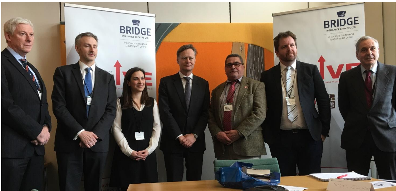
Picture 8.0: UK All Party Parliamentary Group (APPG) Explosive Threats 'Revive Campaign' launch, House of Commons, Westminster.

We have been awarded bronze status by the Armed Forces Covenant employer recognition scheme, in recognition of our employer commitment.