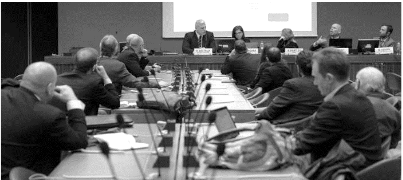
Picture 1.0: Battrick Consultancy's Managing Director, presenting to the United Nations Mine Action service (UNMAS) National Director's Meeting (NDM), Palais des Nations, Geneva.