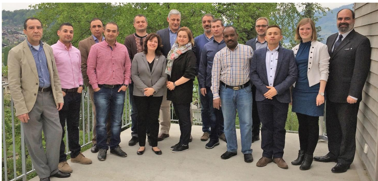
Picture 6.0: Battrick Consultancy delivery of the GICHD Partnership for Peace (P/P) course with guest lecturer from Nottingham University in Spiez, Geneva.