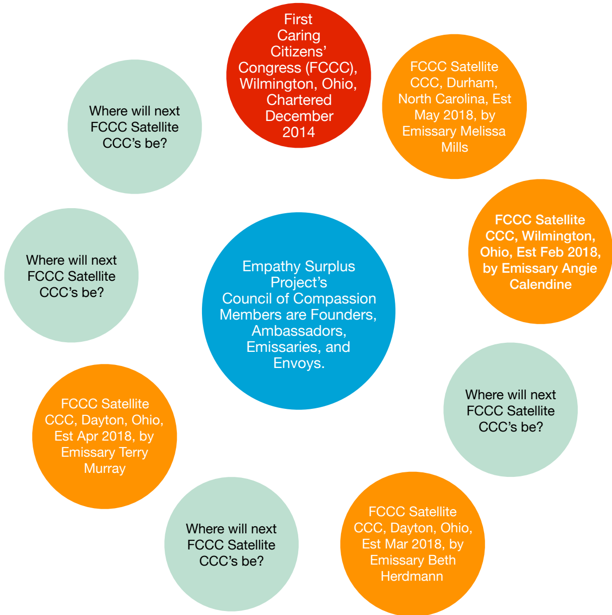
DIAGRAM OF THE EMPATHY SURPLUS PROJECT