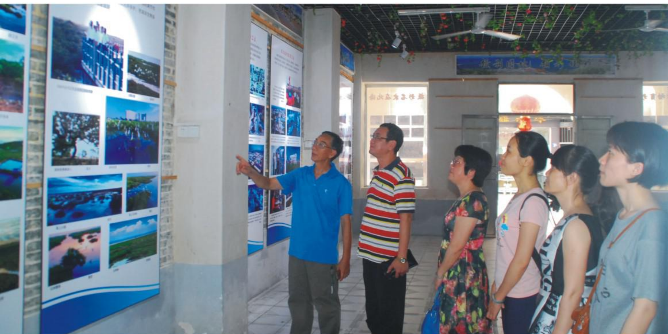
公司组织党团员和员工代表参观记录习近平总书记考察北海为内容的“随习总书记的足迹看北海”图片展。 We organized party and league members and employee representatives to visit the pictures shows of “Experience Beihai along General-secretary Xi Jinping’ s Footprint” recording General-secretary Xi Jinping’ s visit to Beihai.