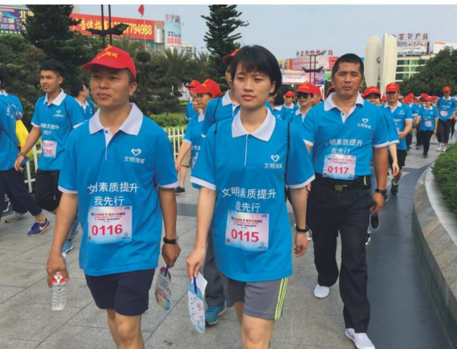
公司组织员工和共青团员参加海城区纪念“五四”运动98周年暨“文明海城”城市徒步健身走活动。 We organized employees and league members to participate in the 98th anniversary of “May Fourth” Movement of Haicheng District & “Civilized Haicheng” urban fitness hiking activity.