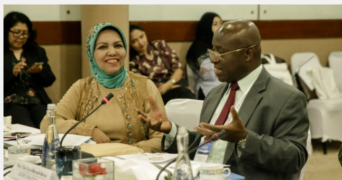
Left-to-right: Hon. Dr. Nurhayati Ali Assegaf (GOPAC Board Member), and Hon. Osei Kyei-Mensah-Bonsu (GOPAC Vice-Chair, Chair of APNAC Africa Region)

The electronic AGM has also continued during the GOPAC 7th Forum of Parliamentarians at the UNCAC Conference of States Parties (CoSP), on November 9, 2017. The global secretariat and GOPAC Board members strongly invite all GOPAC members to contribute by casting their vote for the AGM 2017 agenda items. They can do so by sending an email to secretariat which contains their name, GOPAC Chapter or country, and their vote on whether to accept or reject all agenda items. GOPAC Secretariat is open to receive and respond any inquiries on this matter.