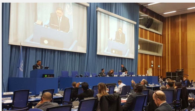
GOPAC Chair delivered GOPAC Statement at the Plenary Session of CoSP 7 UNCAC

The 7th Parliamentary Forum also adopted the GOPAC Statement on Parliament Engagement on Corruption prevention and Asset Recovery. The statement was delivered by GOPAC Chair H.E. Dr. Fadli Zon at the Plenary Session of CoSP7 UNCAC, November 7, 2017. Kindly access the full GOPAC Statement here .