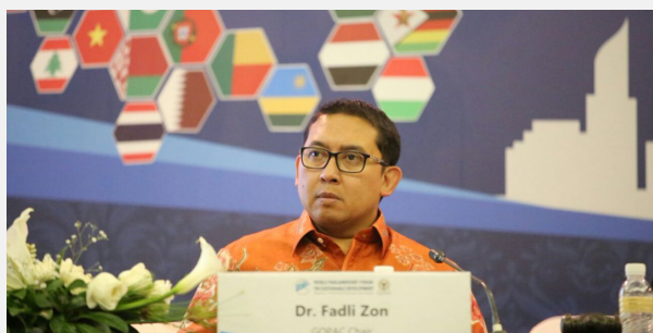
Dr. Fadli Zon encouraged Parliamentarians to use GOPAC SDGs Handbook as a valuable resource in achieving 2030 agenda

This session mainly discussed the role of parliamentarians and partnerships in ensuring that the implementation and oversight of SDGs deliver real, measurable benefits to local communities. On his opening remarks, Dr. Zon mentioned that the only way to measure the real success of SDGs is for people to feel that their lives have markedly improved. "If people are faced with corruption in their daily lives, this will not happen. Let us work to help break the culture of corruption, and help ensure that the implementation of SDGs is effective and accountable," he stated.