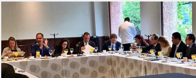
GOPAC Mexico had a joint meeting with Mexican Parliament's Anti-Corruption Caucus

Further on the works within parliament, GOPAC Mexico held a working meeting with Mexican legislators to present GOPAC and invite more members to join the global network. They also built a joint agreement between GOPAC and Anti-Corruption Caucus of Mexican Parliament.