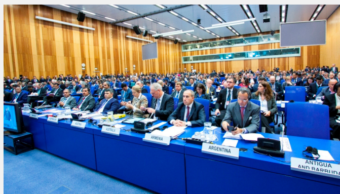
Opening of the 7th Session CoSP UNCAC at UN Vienna Headquarters