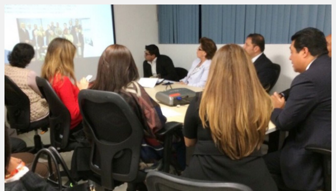
GOPAC Mexico working meeting with Mexican Parliamentarians and induction of new members