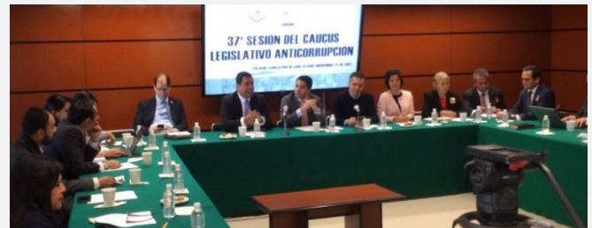
Konrad-Adenauer's discussion forum on the Mexican National Anti-Corruption System (SNA)