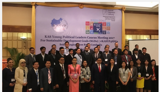
Dr. Fadli Zon with all the Konrad-Adenauer's delegates