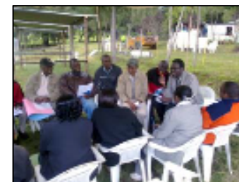
Photo 7: One of the many consultative meetings held by Management for planning purposes, grievance hearing, and monitoring and evaluation purposes

All human rights aspects are monitored on a daily basis and reported by the businesses on a Monthly basis. The Technical departments and Internal audit departments carry out impromptu visits, checks and audits and raise any issues of concern with the concerned and reports to the Top management.