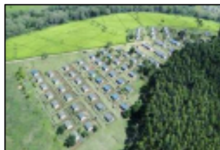
Photo 2: Aerial view of employees housing units in our estates in Nandi Hills

machinery operation in the tea factories. However, the people depending on our business for their livelihood are much more than listed above.