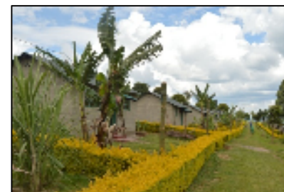
Photo1: Employee housing units in one of our estates

In 2009, the board adopted a new Corporate Social Responsibility Policy to replace the Statement of Business Principles that had been in place since 2005. The Corporate Social Responsibility Policy is available on the Camellia plc.'s website.