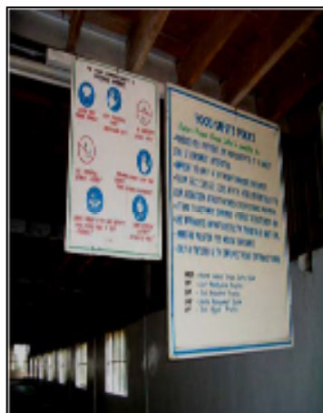
Photo 10: Safety signage within the factories promotes awareness and enhances food handling practices.

As a manufacturer and marketer of black tea, we generally do not provide products to end-users, but to other players in the industry who later extracts constituents, blends or repackages the products for the end user. We therefore base our advertisements on word of mouth backed by strong evidence of business integrity, ethical trade, and safety with assured quality. We comply with legal requirements, sector regulations and customer requirements, designed to assess product safety and also participate in voluntary initiatives.