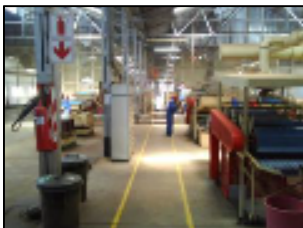
Photo 5: Inside one of the factories. Note the housekeeping, marked walkways, guarded machinery and fire extinguishers provision.

All workers receive training on how to do their work safely, especially regarding the application of agrochemicals and carrying out any hazardous work. Measures are taken on our farms to avoid the effects of agrochemicals on workers, neighbors and visitors. We also conduct risk assessments and identify potential emergencies and are prepared with plans and equipment to respond to any event or incident, as well as to minimize the possible impacts on workers and the environment.