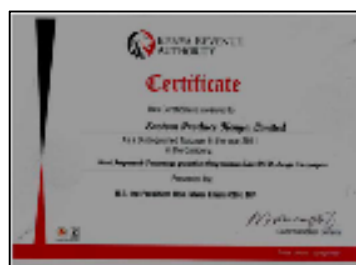
Photo 8: Copy of the certificate awarded to the Company as a distinguished tax payer in Kenya in 2011

philosophy. The management of each unit is responsible for compliance with the company codes, thereby ensuring that social and environmental issues are integrated into daily business. The codes are in form of confidential standing instructions referred to as Company Blue, Red, Green, Yellow, white and black books.