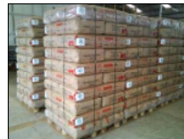
Photo 9: Hygienically packed teas with correct labeling and all relevant information indicated.

Product safety is paramount in all operations from farm, transportation, processing, packaging and freighting to customers destinations. The Operations Director has the overall responsibility for ensuring that the objectives on food safety are met. This responsibility has been communicated to the management in charge of the units. All our tea factories have attained FSSC certification and currently in the preparation phase for FSSC 22000 surveillance audits