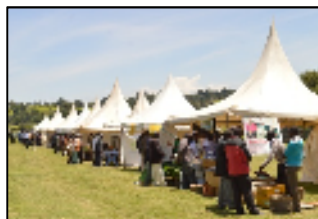
Photo 6: farmers and neighboring communities during one of the Field days

In all our businesses, employees were trained on various aspects of Human rights and their rights as employees. This included communication on their right to join a recognized workers union, right to a safe work environment and right to be considered for employment without discrimination. EPK enhanced this communication by erecting notice boards at strategic points for communicating policies related to