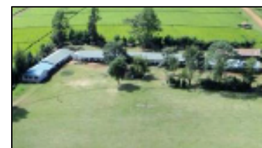
Photo3: One of the 15 primary schools constructed by the company for employees and surrounding communities children of school going age to prevent child labor

While focused on the commercial need to procure goods and services of the required specification and quality on the most favorable terms, we work collaboratively with our suppliers to ensure that availability is sustainable in the long term and that contracts are fair and business relationships are mutually beneficial.