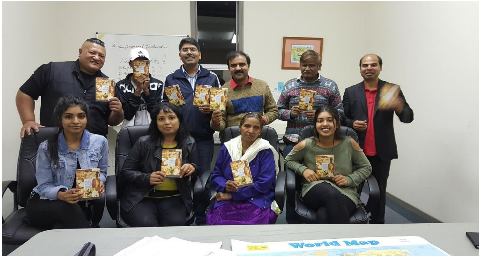
Human Rights Education Program 2.8