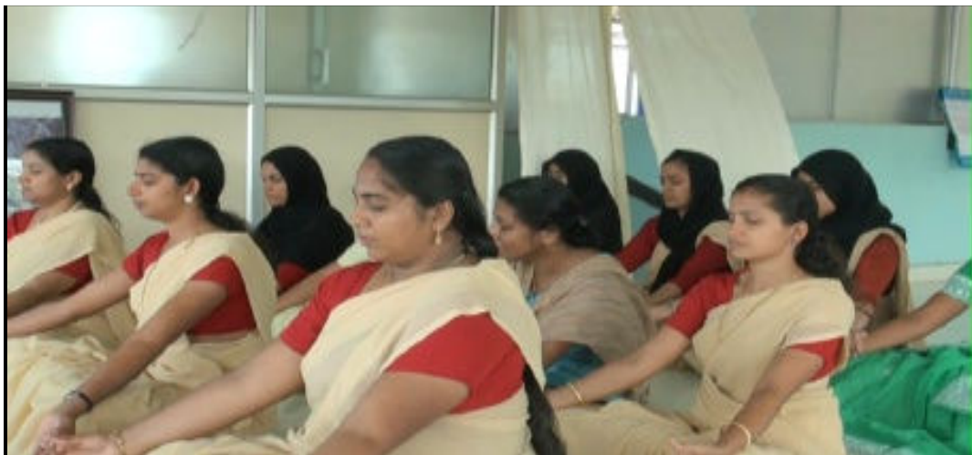
Scenery from the Meditation Training for teachers organized at Kozhikkode