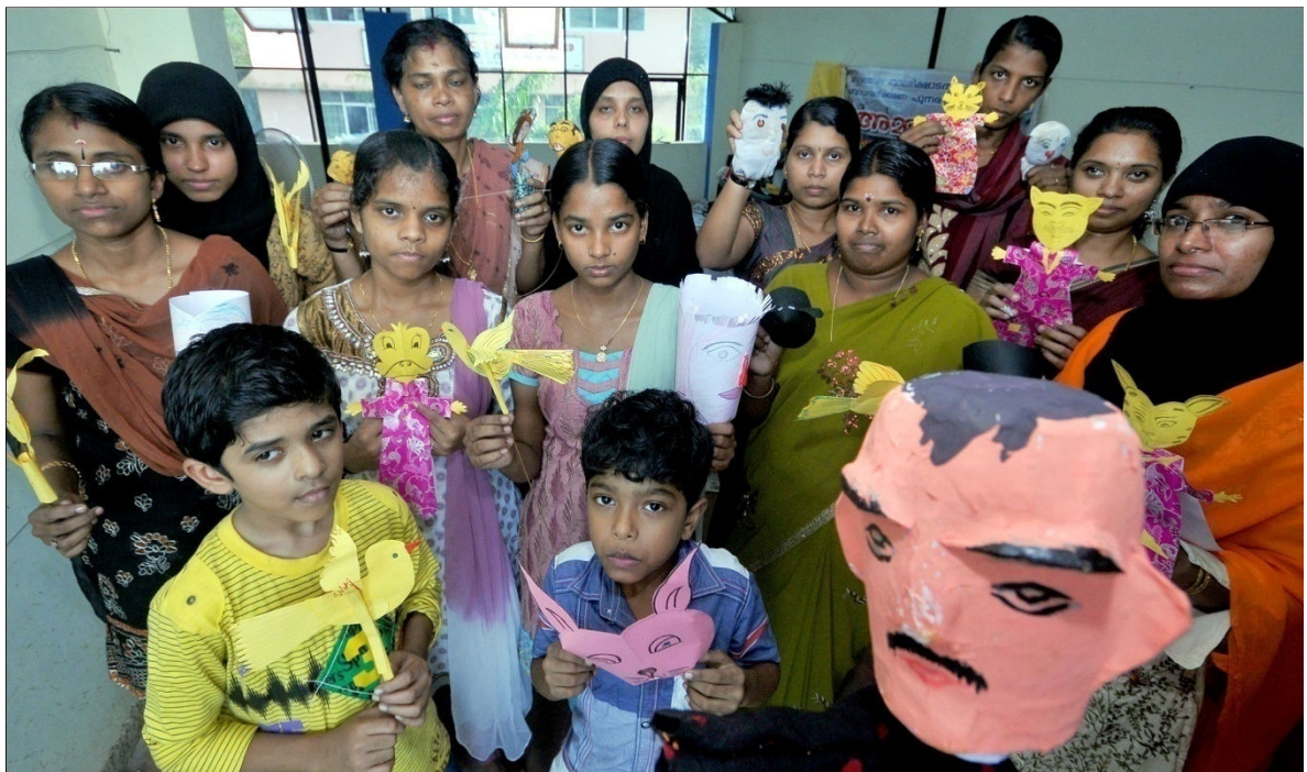
Scenery from the Puppet Making and Puppet Play Workshop organized for school children & women at Malappuram