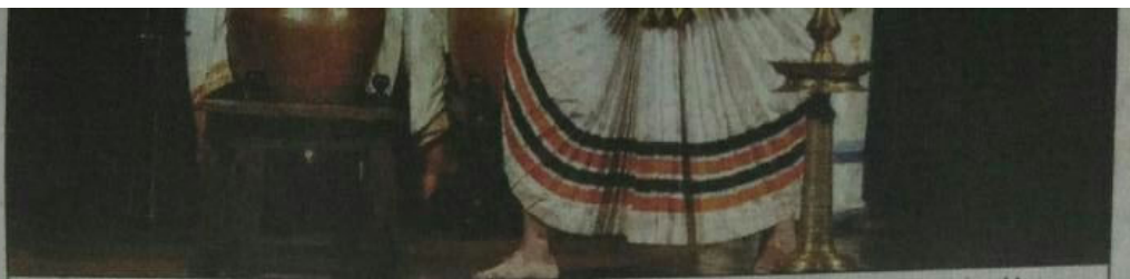
A Koodiyattam artist enacts a scene from 'Jatayu Vadham' at Chalappuram Achuthan Girls School in Kozhikode on Sunday. The event was organized by Thodayam Kathakali Yogam