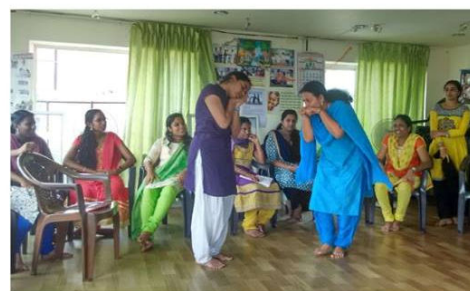
NCDC study center, Trivandrum

Calicut: Montessori TTC courses which is conducted by National Child Development Council, Kerala Region had started in Trivandrum, Kollam, Kottayam, Kannur, Malappuram and calicut district. Spoken English classes are provided freely in the beginning of the Montessori TTC. National Child Development Council is providing activity oriented practices. The students who had already completed course are