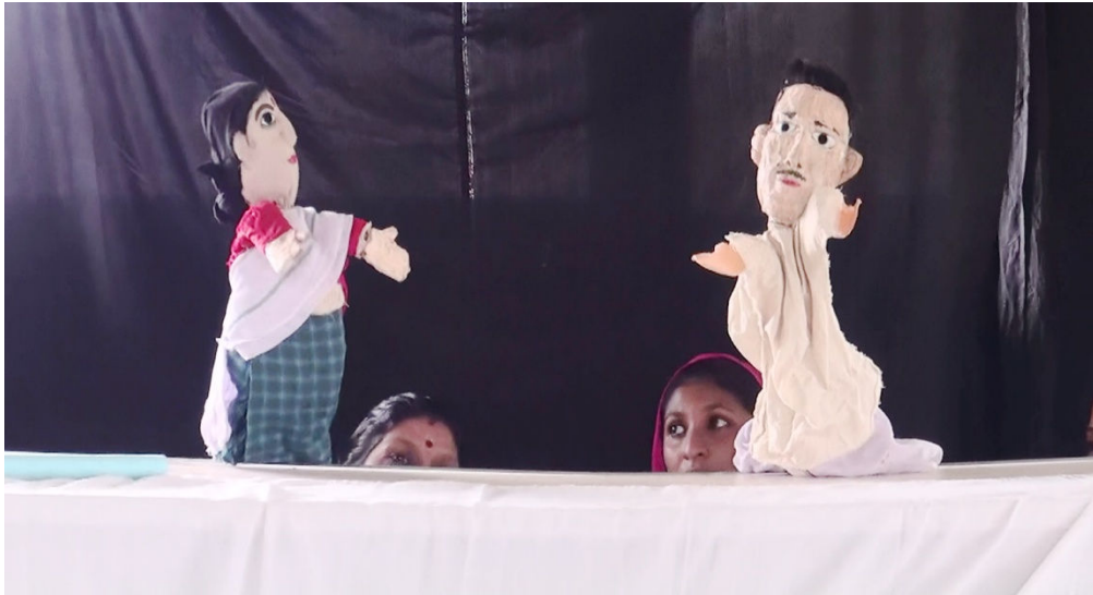
Scenery from the Puppet Making and Puppet Play Workshop organized for teachers at Kozhikkode