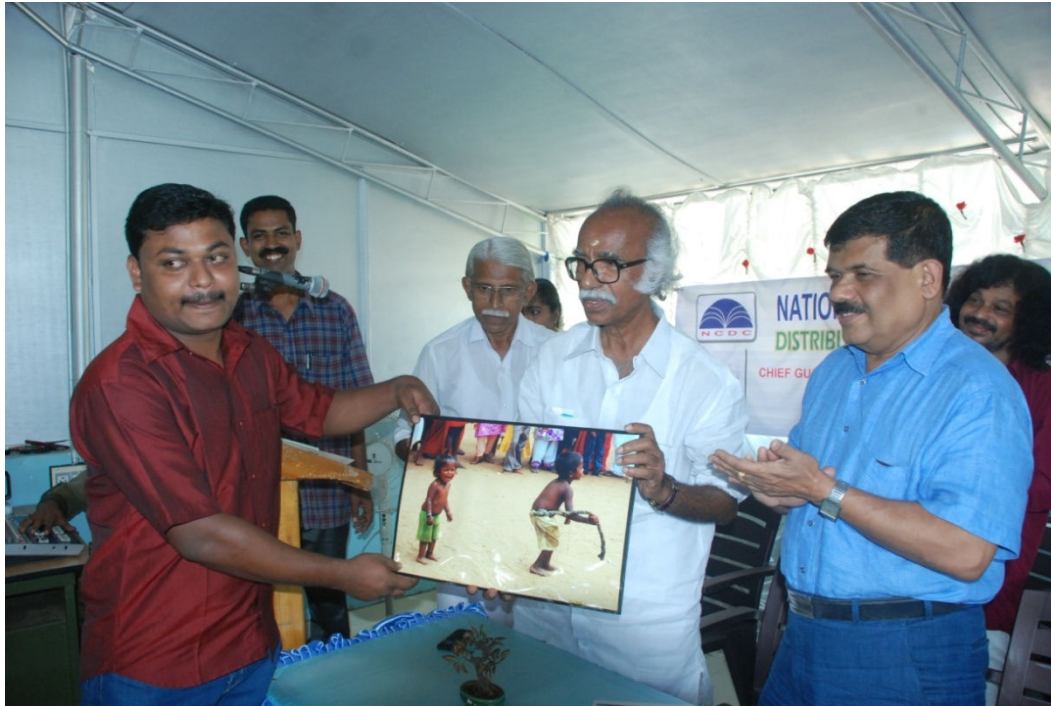
Hon. Devaswom Minister Sri. Ramachandran Kadannappally inaugurates the Exhibition of photos relates with child labor and begging arranged in the name 'Kannay Madangu' at Kozhikkode

Some of the photos exhibited in the Exhibition given below: