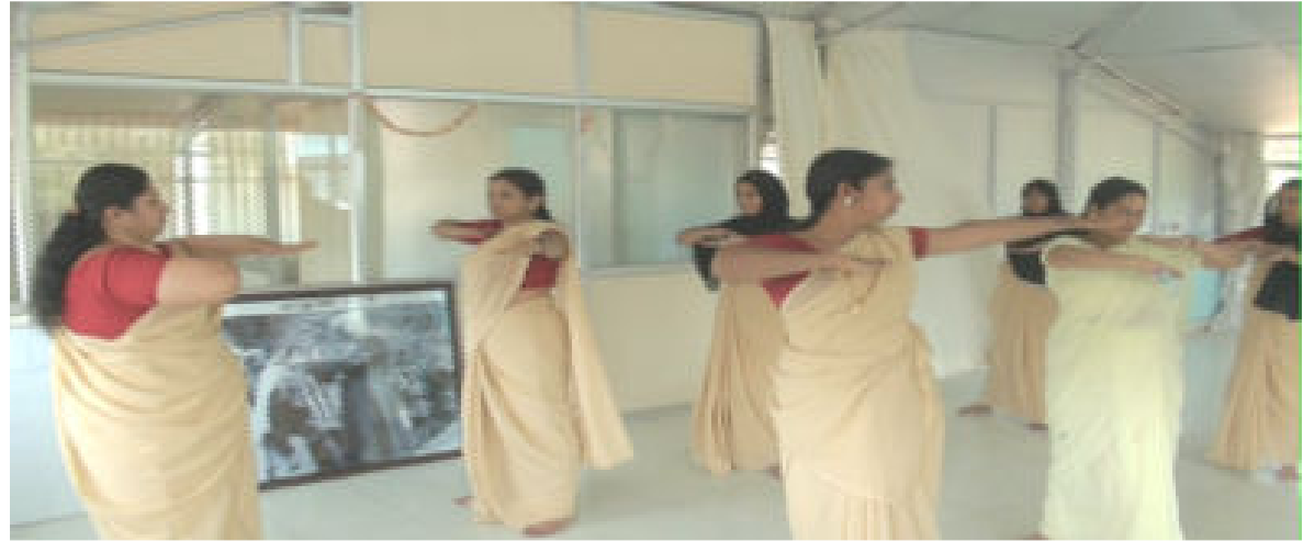
Scenery from the Yoga Workshop organized for teachers at Kozhikkode