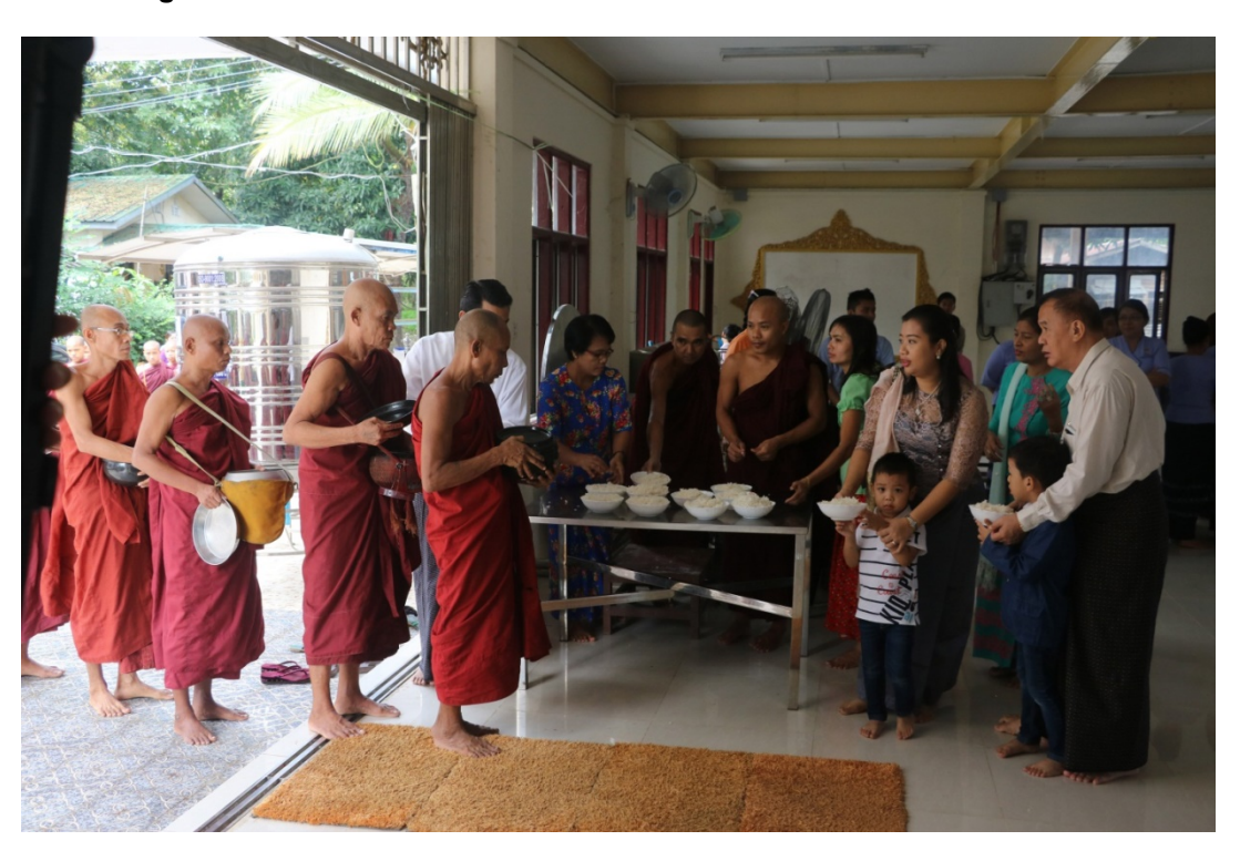
Fig: PSH Organization Donation at Monastery