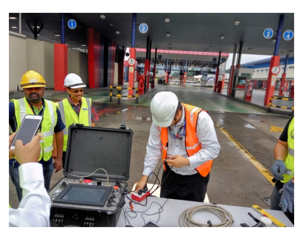
Figure: Oversea On Job Training