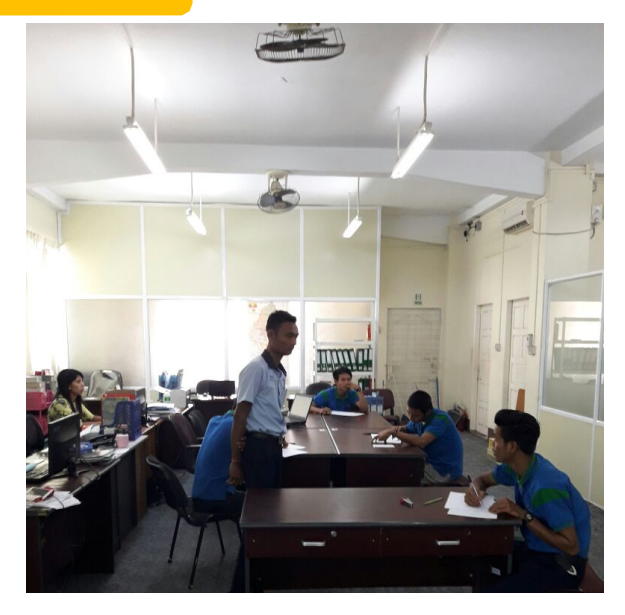
Figure: Internal Technical Skill Development Training and Assessment