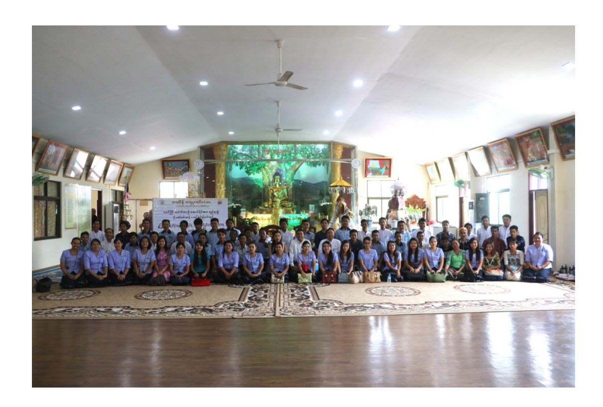
Fig: Team Donation at Monastery