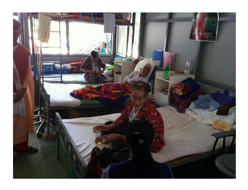
Fig: PSH's Donation (CSR) Program at Senior Citizen Care Center