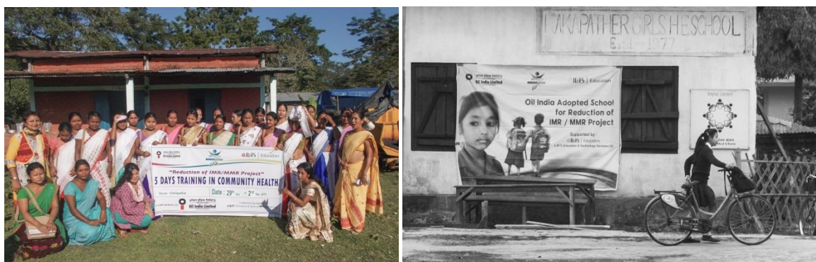
Glimpses of Project Arogya on reduction of IMR/MMR in OIL's operational areas

In all, the project has touched the lives of more than 15,000 individuals in one form or the other since inception.