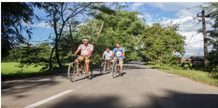
Villagers moving on newly constructed road by OIL

In FY 2016-17, OIL has constructed over 105.78 kms of rural roads, 9 nos. of rural culverts, development of around 05 nos. of playgrounds and around 11 nos. of waiting sheds in various villages of OIL operational areas of Tinsukia, Dibrugarh, parts of newly formed Charaideo districts in Upper Assam and Arunachal Pradesh.