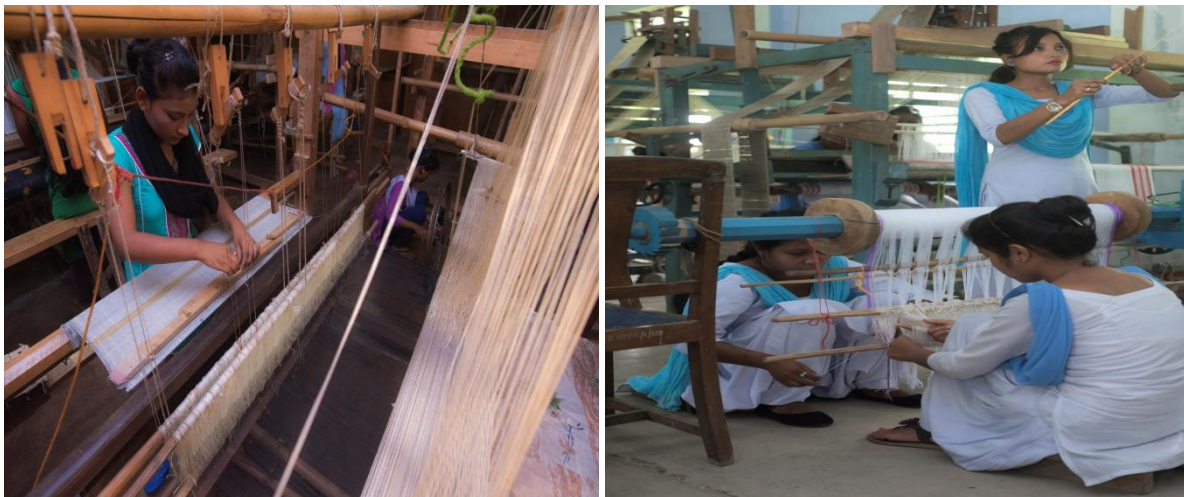
Trainees at the HTPC centre, practising the art of weaving

Handicraft Training & Production Centre (HTPC): OIL's Handicraft Training and Production Centre, located at Duliajan, Assam has been imparting nine-month stipendiary training in Weaving, Cutting & Tailoring, Embroidery & Knitting to young girls from OIL operational areas. The students are selected through written test and viva-voce. Since the launch of the project in 2013-14 till 2016-17, a total of 8,560 candidates were imparted such training. In the current year a total of 42 nos. of women are undergoing similar training in the training center. Post training assistance is also provided to the trainees. Further, entrepreneurship education programs for students and teachers of Schools and colleges were conducted under the project, benefiting 4290 participants.