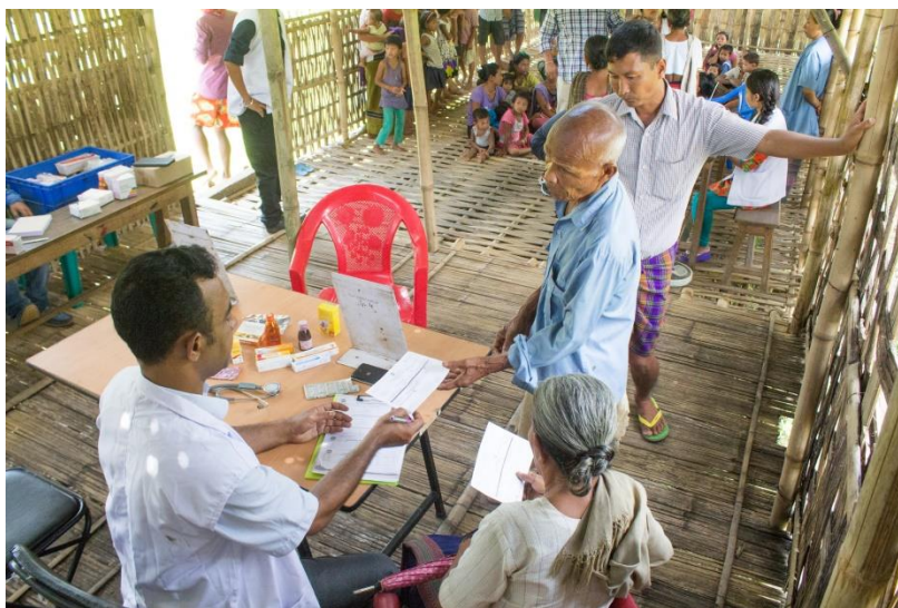
Mobile Dispensary services under Project Sparsha, being provided to local people of OIL operational areas of Assam and Arunachal Pradesh

It has always been one of the most significant community welfare projects of the Company. Started way back in the early eighties, the mobile health care project "Sparsha" covers OIL operational areas of Tinsukia and Dibrugarh districts in Assam and Arunachal Pradesh. This effort of OIL caters to the primary health care needs of the people in OIL operational areas. The project is conducted through St. Luke's Hospital in addition to OIL's in-house Mobile Health Care team. During the last 3 years from 2014-15 to 2016-17, 3,860 health camps were conducted, screening and primary healthcare services were extended to around 5,59,992 patients.