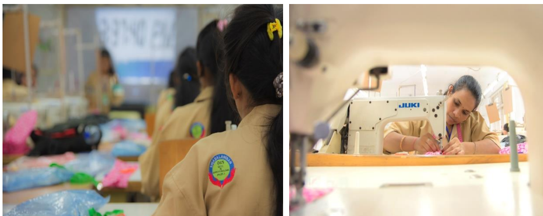
Candidates of Project Swabalamban undergoing training in various vocations

Project Swabalamban on Skill Building: Under the project, OIL provides skill based placement oriented training to youth from its operational areas, by focussing on various employable skills in sectors like Hospitality & House Keeping Management, Industrial Sewing, Construction Industry, Electrician, besides setting up of livelihood clusters in areas like handloom & handicrafts, etc. The project was started in 2013-14 and till 2016-17 over 8560 candidates have been trained and over 6669 candidates have been successfully placed in various organisations across the country.