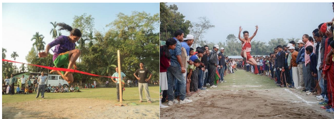
Young children participating in the OIL Rural Sports initiative

5. Promotion of SPORTS :Promotion of Sports as a CSR initiative apart from providing a platform and motivating the budding talent from the rural parts of OIL's operational areas, plays the role of uniting the communities, mobilizing, inspiring and instilling responsible behavior among the children and youth. OIL's contribution and collaboration with the social groups, district administration and sports bodies, has helped in making rural sports as one of the most popular sports event in the rural areas creating social advantage, over the years.