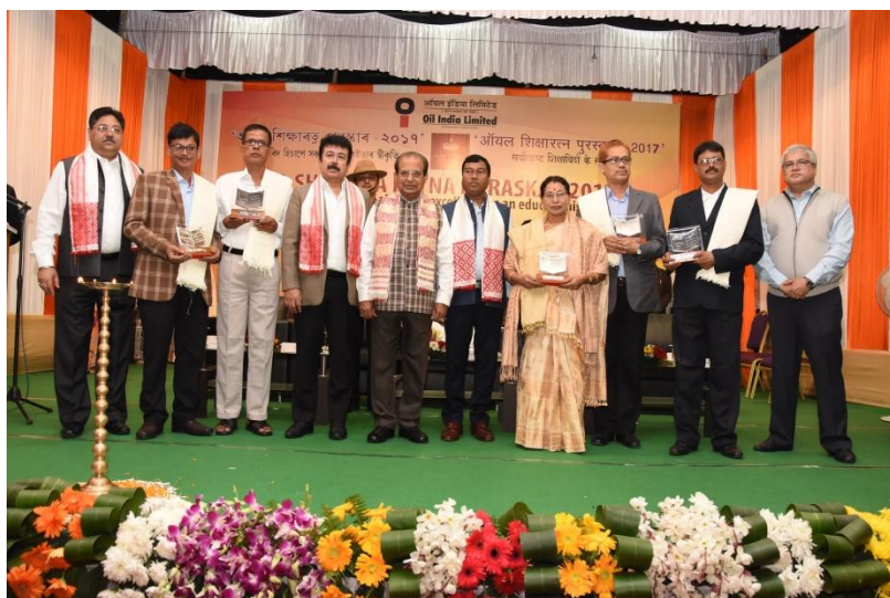
Shiskya Ratna Puraskar Event at OIL FHQ, Duliajan

Rupees One Lakh and a citation to each awardee presented on the occasion.