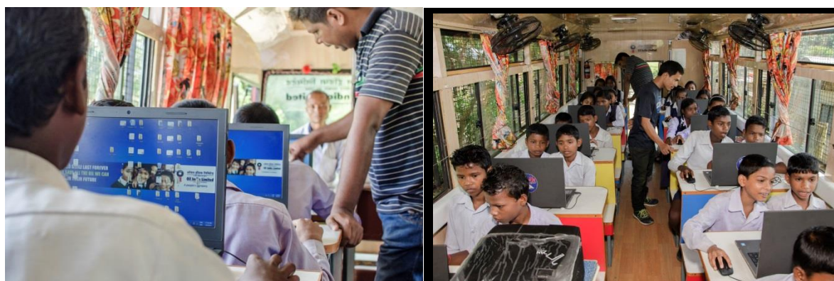
Students actively participating in the Computer Bus learning sessions under Project Dikhya

Computer Education under Project Dikhya: {Project on imparting mobile computer education to school students, through innovation teaching and learning methodologies.}The computer literacy programme is being implemented in eighteen schools within OIL's operational areas in the districts of Dibrugarh, Tinsukia and Sivasagar. The project is being implemented through State Institute of Rural Development (SIRD), Assam and IL&FS Education & Technical Services via mobile education vans/buses which visit each of the areas and schools. The program has so far (2016-17) benefitted 19,466 students via custom designed and fabricated mobile education buses / vans equipped with laptops