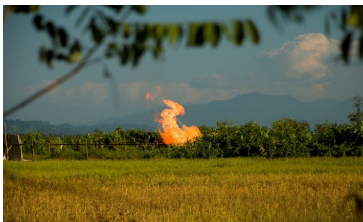
OIL aims at reduction of Gas Flaring through initiatives such as the one mentioned above

This strategy is then extended in initiating projects such as the proposed 5.0 MW Kumchai Power Plant (KPP), which was inaugurated in November, 2013. The proposed site of power plant is in the Changlang District of Arunachal Pradesh and is about 450 Kms from Itanagar. The power plant is to be fed with the associated gas production (presently approximately of 30,000 SCMD) for running this KPP. It is proposed that the existing 11 KV line would be converted to 33 KV line for evacuation of power. The project will lead to a reduction in GHG emissions because of a reduction in the flaring of gas. It will also lead to the utilisation of high calorific value gas, which is presently flared as a substitute for higher carbon intensive fuels. Finally it is set to have the beneficial impact towards conservation of depleting non-renewable natural resources and thus the promotion of sustainable economic growth via the implementation of an environment friendly technology. Presently the Project is under Environmental Clearance State .