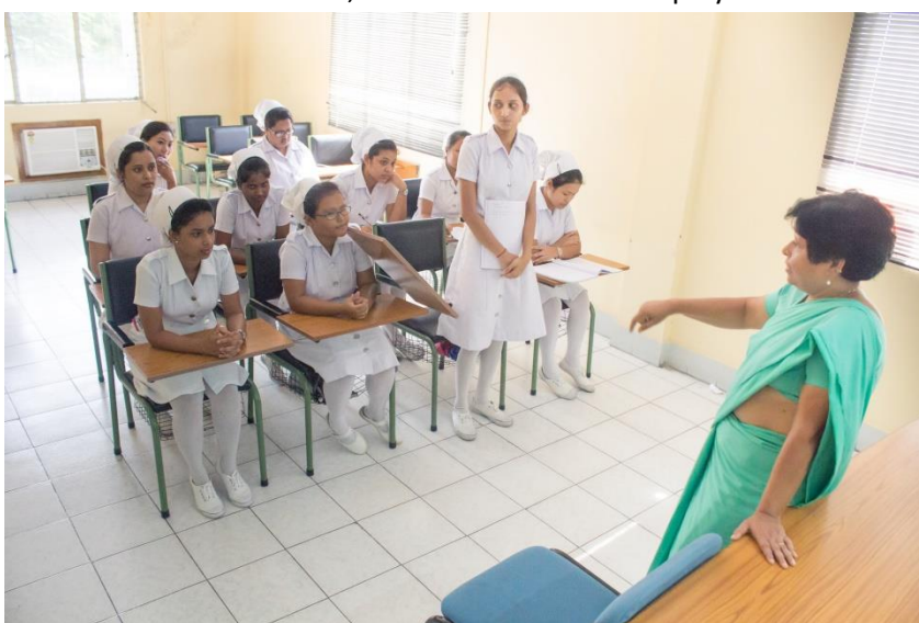
A Training Course underway at OIL Hospital, Duliajan

General Nursing Midwifery (GNM) training: The nursing school in OIL Hospital Duliajan conducts 3 years General Nursing Midwifery (GNM) training course, which is recognized by the Directorate of Medical Education, Government of Assam. Stipend is paid to the students in addition to limited hostel accommodation, uniform and protective clothing. Started in 1991, the school has provided training to more than 300 candidates, who have also been employed in different health institutions across the state.