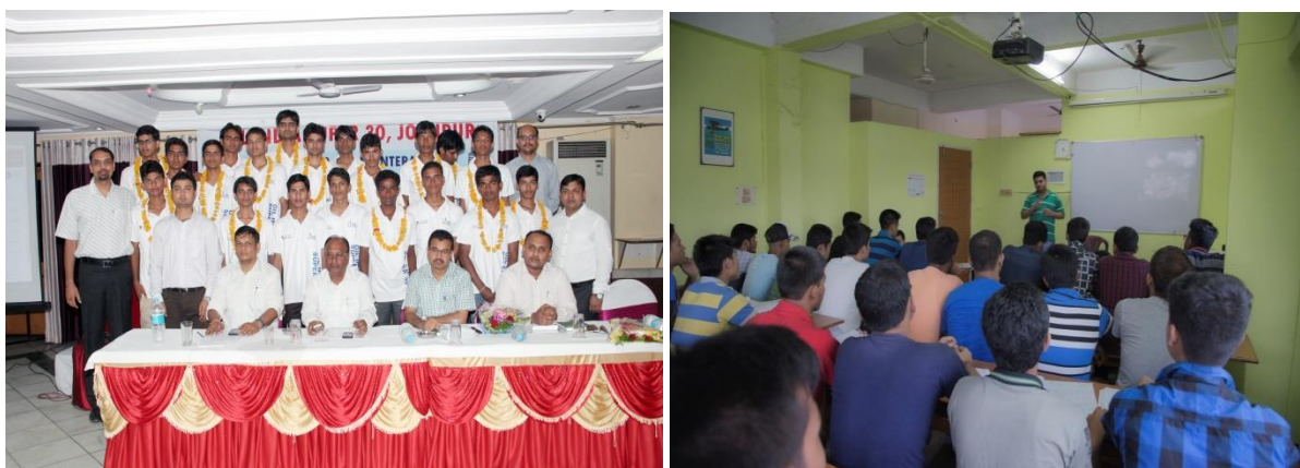
Glimpses of the OIL Super 30 Project

OIL Super 30: OIL India Super 30 which started in July 2010, is an 11 months completely residential coaching program for IIT-JEE & other Engg. entrance examinations, for the meritorious students from backward sections of the society. Presently there are 6 OIL Super 30 centres at Guwahati, Jorhat, Nowgaon and Dibrugarh in Assam, Jodhpur in Rajasthan and Itanagar in Arunachal Pradesh (started in 2015-16) with a sixth centre being operational at Nowgaon (2017-18). Students have been admitted in various engineering institutes like IIT, ISRO, NIT, State Engineering colleges, Medical institutes and leading Engineering Colleges.