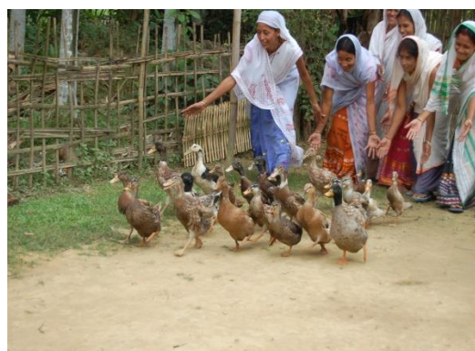
Left: Women participants at the training session for SHGs under the project Right: Women given training on Duck Farming