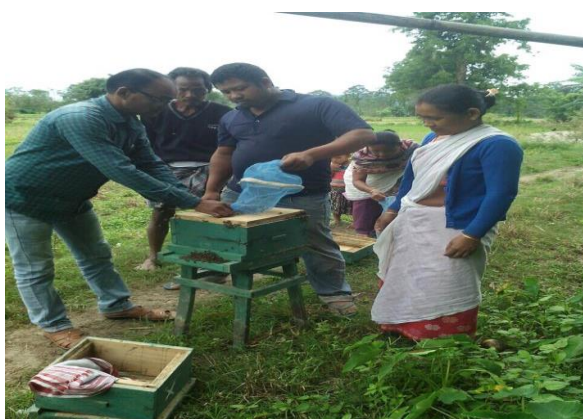
Participants given training on beekeeping & honey processing at OIL operational area in Arunachal Pradesh

Project OIL 'Jeevika': Launched in 2016-17 fiscal and implemented by India Institute of Entrepreneurship (IIE), Guwahati, Project OIL Jeevika is a community cluster based sustainable livelihood promotion project is currently implemented in OIL's operational villages of Arunachal Pradesh aiming to benefitting 400 households. The project aims at imparting skill development and upgradation training to the targeted beneficiaries on beekeeping & honey processing, mustard buckwheat and local pulses processing for generating alternate source of income and formation of self-sustainable livelihood clusters.