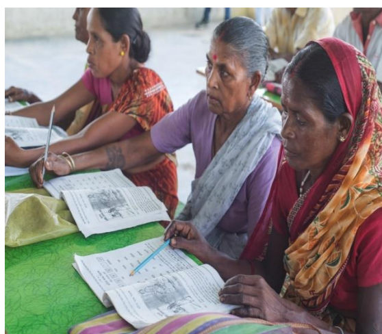
Adult Literacy classes under Project Dikhya in session in villages of OIL operational areas in the Assam