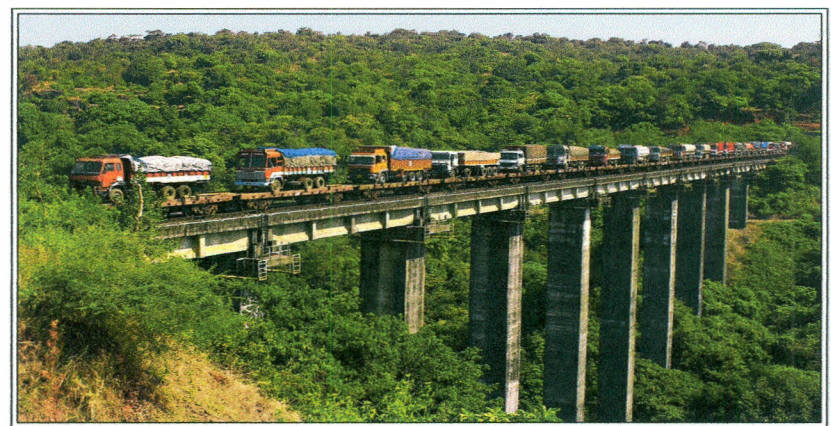
RO- RO TRAIN CROSSING POMENDI BRIDGE BETWEEN RATNAGIRI - NIVASAR RAILWAY STATION

Roll On - Roll Off (RO-RO) services has been introduced in Konkan Railway since the year 1999 in which loaded trucks are transported by trains from one end to the other end which results in saving fuel and reduction of pollution caused by road traffic and also leads to safe transportation of trucks. This service besides contributing to significant savings on fuel, also reduces wear and tear of trucks' tyres and parts, with least pollution and high safety. This service is unique to KRCL.