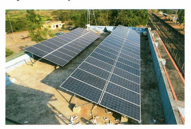
Besides,20 KWp solar plants have been installed at Karmali station roof top, Hybrid (Wind + Solar) System at Level Crossings (LC) gate No.17& 32 (950 W each) and Vinhere station (7.5 KW) provided at Ratnagiri region.

Continuing our initiatives to promote usage of clean energy, roof top solar panels of 25 KWp capacity each at Chiplun, Kankavali & Kudal, 20 KWp capacity at Sawantwadi & Karmali, 7 KWp at Thivim & Udupi and 2 KWp capacity each at Khed, Chiplun & Kankavali stations have been installed.