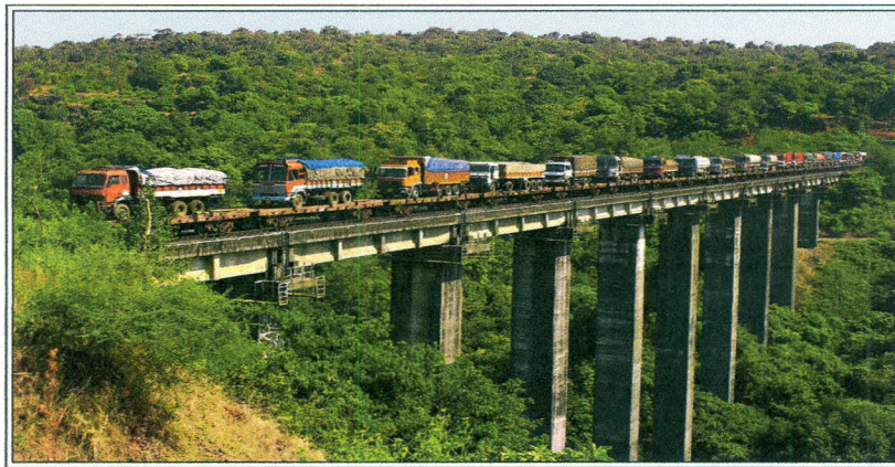
RO-RO TRAIN CROSSING POMENDI BRIDGE BETWEEN RATNAGIRI - NIVASAR RAILWAY STATION

Roll On - Roll Off (RO-RO) services has been introduced in Konkan Railway since the year 1999 in which loaded trucks are transported by trains from one end to the other end which results in saving fuel and reduction of pollution caused by road traffic and also leads to safe transportation of trucks. This service besides contributing to significant savings on fuel, also reduces wear and tear of trucks' tyres and parts, with least pollution and high safety. This service is unique to KRCL.