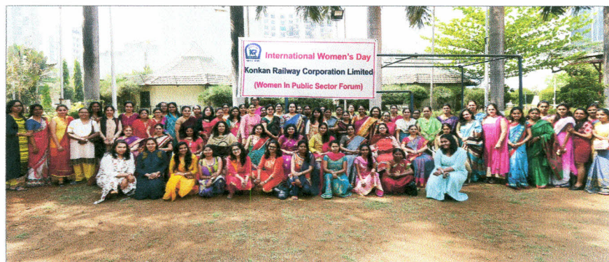
INTERNATIONAL WOMEN'S DAY CELEBRATION AT KONKAN RAIL VIHAR, NERUL NAVI MUMBAI (08.03.2017)

Participation of employees has been ensured in staff welfare activities viz., Medical Camps, Cultural Competitions, Sports etc. Women's Day and Children's Day are being celebrated every year. All group 'D' Staff are being given in-house Computer training. The Children of the Employees of KRCL are also being counselled with regard to Career Guidance for their future development.