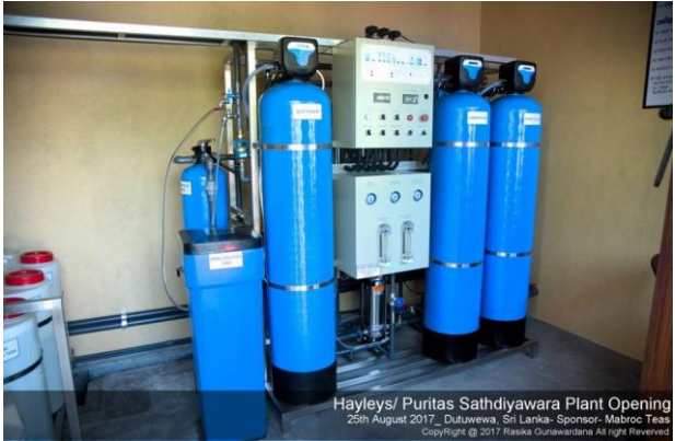
Fig 5. Puritas Sathdiyawara project opening ceromony