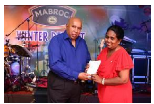
Fig 12. Long service award 2017