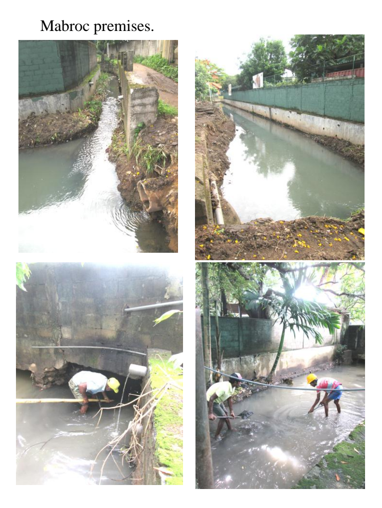
Fig 14. Shramadana campaign