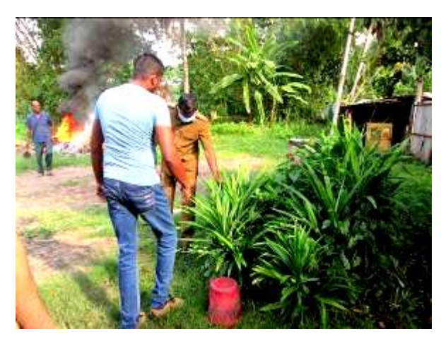
Fig 3. Dengi Irradication program conducted by Mabroc Teas (Pvt) Ltd.