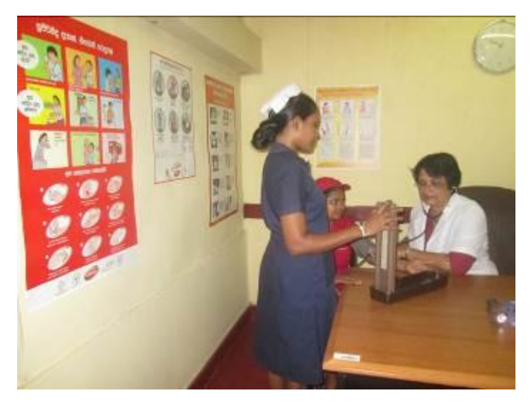
Fig 8. Weekly basis medical checkup in Mabroc Teas premises