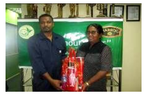
Fig 9. Year-end book donation 2017