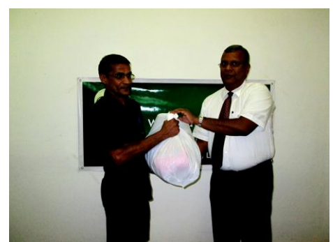
Fig 10. New Year donations (Dry Rations) 2017