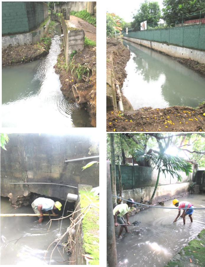
Fig 14. Shramadana campaign