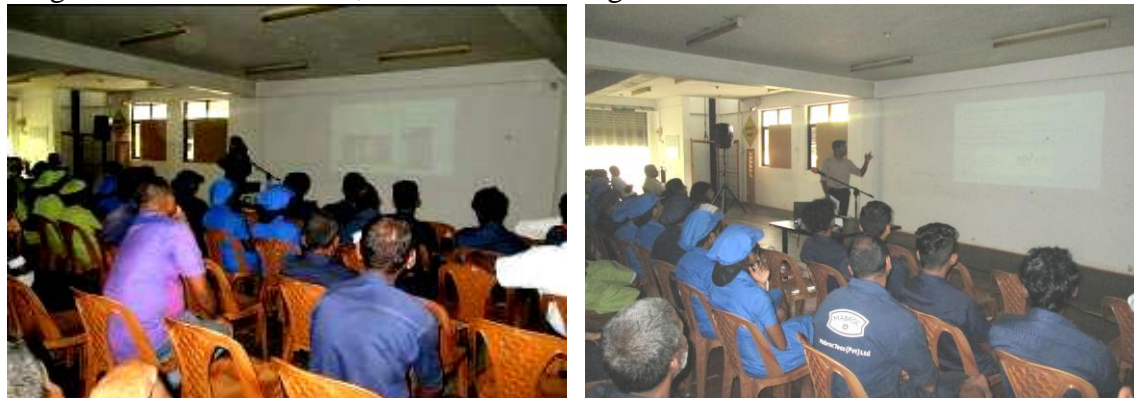
Fig 2. Training on solid waste management