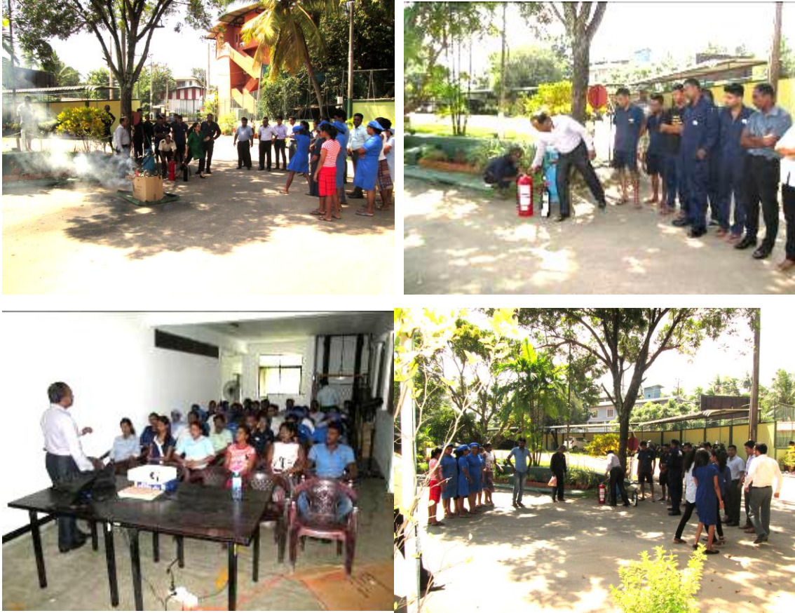
Fig 1. Fire Demonstration, Evacuation training