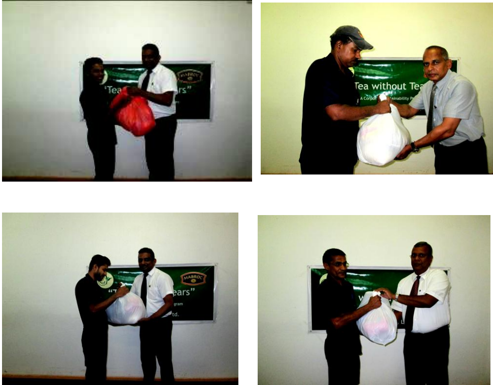
Fig 10. New Year donations (Dry Rations) 2017