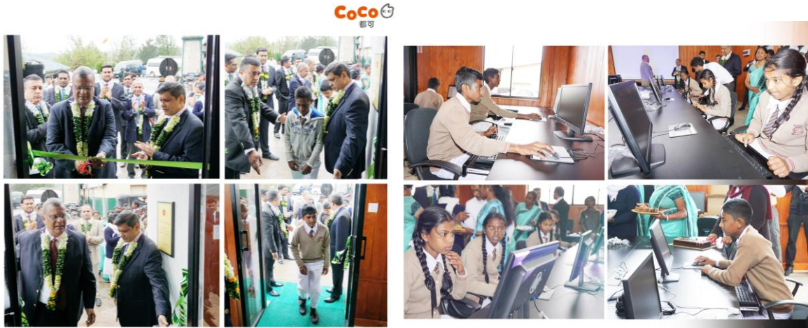
Fig. 7 Opening ceremony of E-Learning Centre at Pedro Estate Nuwara Eliya

the learning capacities of children of the workers at the estate.