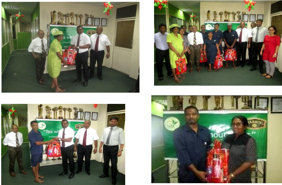
Fig 9. Year-end book donation 2017