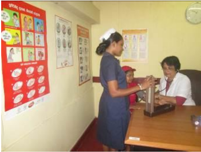
Fig 8. Weekly basis medical checkup in Mabroc Teas premises