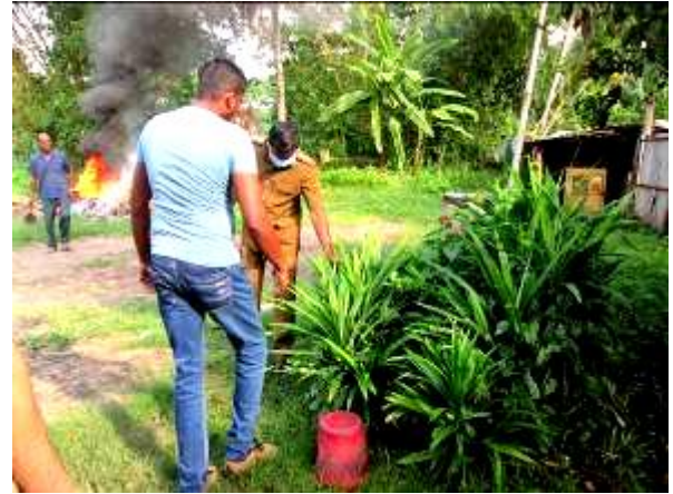
Fig 3. Dengi Irradication program conducted by Mabroc Teas (Pvt) Ltd.