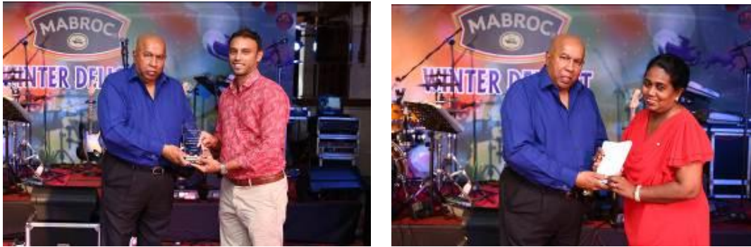
Fig 12. Long service award 2017