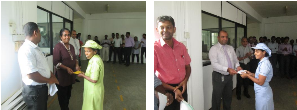
Fig 13. Best worker of the Quarter