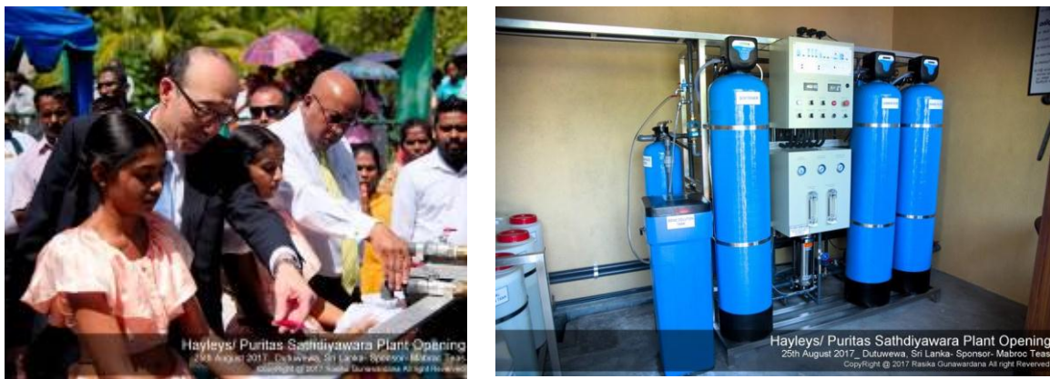
Fig 5. Puritas Sathdiyawara project opening ceromony