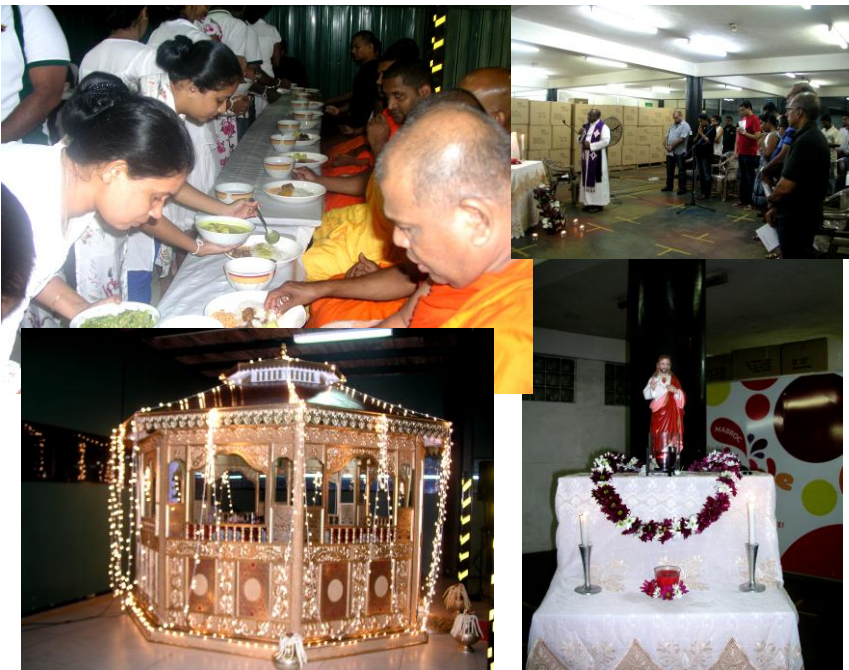
Fig 11. Multi religious ceremony