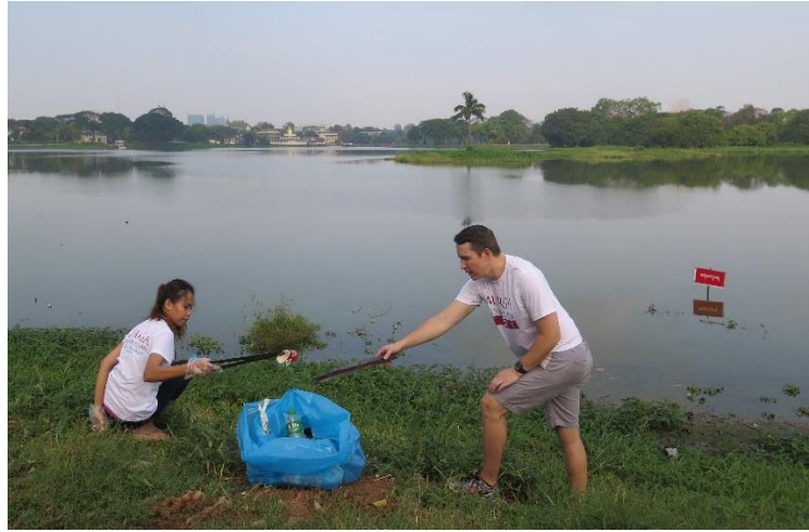
Volunteers collecting the trashes along the lakeshore

Marga Community Care recognises that other than our philanthropic efforts, effective and proper preservation is required to help preserve the environment and the community we live in. In the morning of 6th May, 2017, Marga Community Care held a community cleaning day at Inya Lake in collaboration with Yankin – Agora Center.