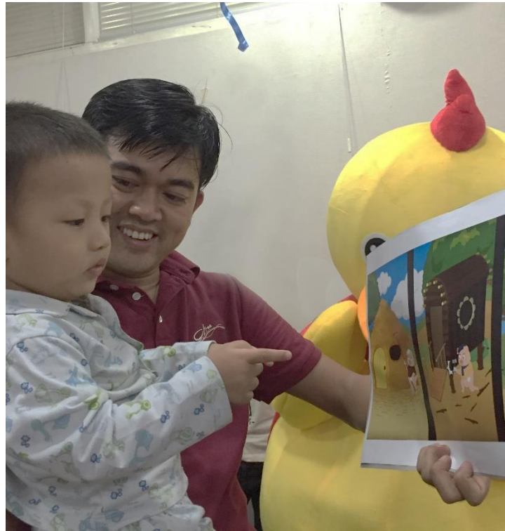
A little boy listened to a MCC member telling the story of “The Three Little Pigs”

We were delighted to give the children their first experience of “magic”. Everyone at the conference hall was mesmerized by the charm and skills of the magician whose tricks surely give the children and their parents a magical moment of laughter and awe. Besides magic, our MCC team brought the story of the “3 little pigs” in colorful storyboards. We hope this story with the message of unity, discipline and friendship can instill energy and spirit into the children who are hospitalized due to different medical conditions.