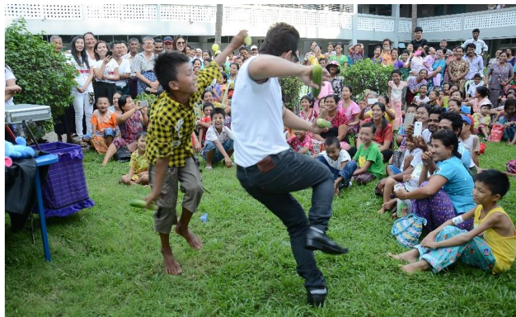
A magical dance performed together with the magician and a volunteer kid.

We started off the day's program with two Hello Kitty cartoon characters leading the participants to a warm-up dance to the famous nursery rhyme "Old MacDonald Had A Farm." The first highlight of the program was the dance competition in which 10 pairs of child-parent "dancers" competed with one another. All the teams had so much fun even though only two could win the prize. After the action, the participants were all drawn into the