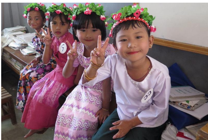
Super cute kids waited excitedly to show off their talents at the "beauty pageant"

Children's laughter filled the outdoor playground when we staged the fun games with two traditional games Arr-Lu-Kout (collecting potatoes) for boys and Za-Gaw-Ywat (walking with the plates on the head) for girls. The children were so loud that even other families in the neighborhood came into the school to enjoy the fun.