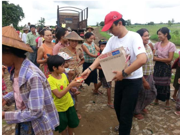
MCC team member passed the relief supplies to flood victims at Pay-Gone Village, Kantbalu Township.

More than 3800 units of medicine for diarrhea, cold & flu, water purification tablets and rehydration salts (dat-sarhtoke), 2700 units of nutritional drinks, noodles, and more than 230 pieces of clothes were directly handed over to the victims.