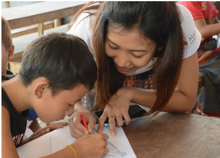
One of our MCC team helping kids with the coloring.