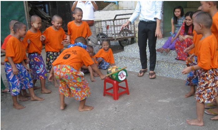
The team-mates of the winning team watched anxiously as he hit the tin at the final round.