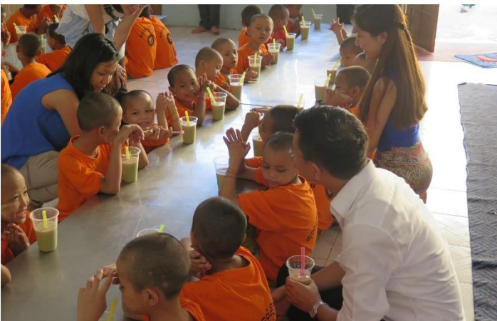
Our team members distributed the drinks and food to the children.

The MCC team had an early start that morning in order to prepare chicken burgers and fruit punch for the children who had never eaten them before. We were glad that we were able to serve the children their first burgers and fruit punch which they really liked. After a small feast, there were rounds of rounds of games which the children participated enthusiastically. The highlight of the day was Than-Pone-Yite (hitting a tin box blind-folded) which got the children most excited and incited the loudest cheers from the entire school. The winners and participants were each awarded with a bag loaded with stationery, snacks and a frisbee.