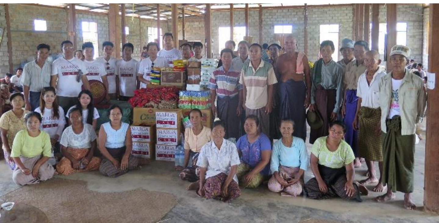
MCC flood relief team with the flood victims at one of the shelters.