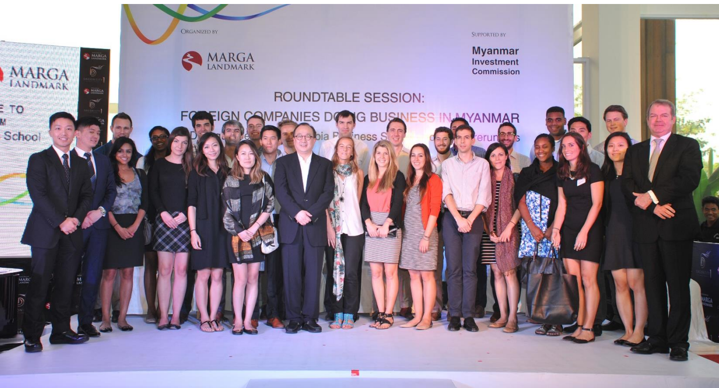
Columbia Business School delegates with the senior team of Marga Group.

Delegates from more than 12 local enterprises and foreign companies operating in Myanmar, representatives from Yangon University and British Council attended the roundtable.