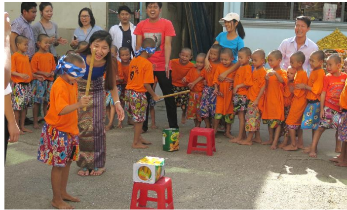
The team excitedly cheered a kid as he was preparing to hit the tin blind-folded.