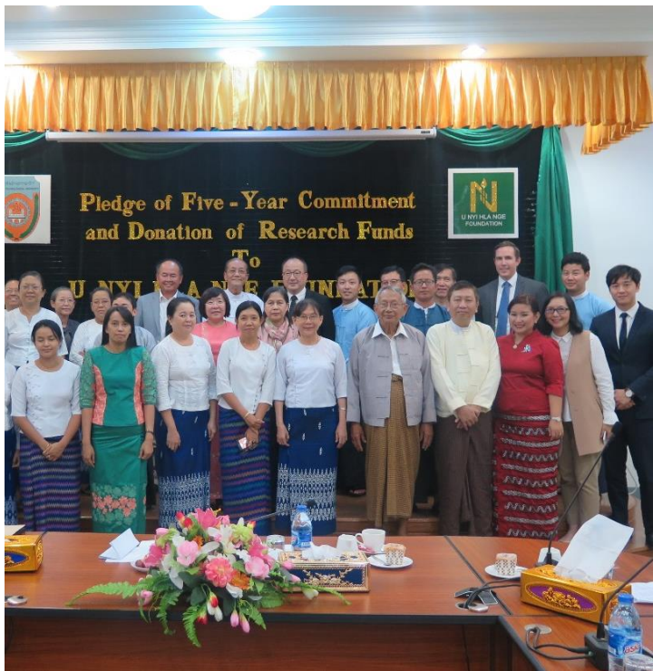
The donation and agreement signing ceremony was attended by Representatives from the foundation, YTU & Marga Group.