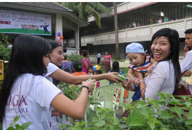
Happy faces of children and their guardians participating in our children's fun day event