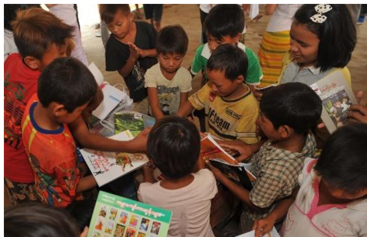
The children are overjoyed with the new books.