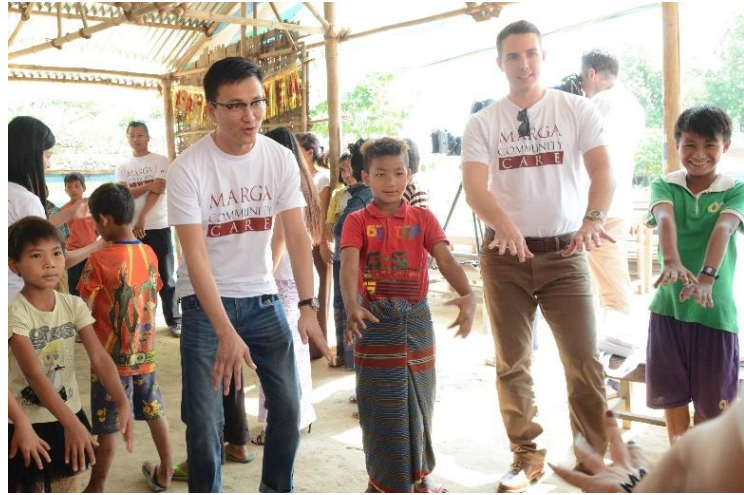
Together, we can put rays of hope on the faces of these children in spite of their poor conditions.