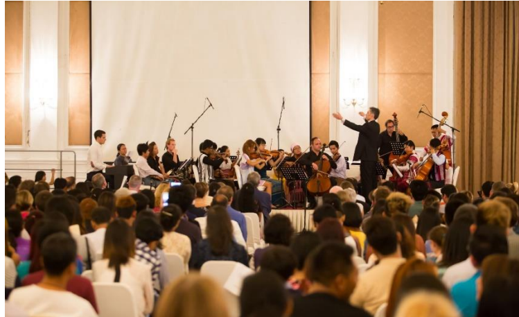
The "Orchestra for Myanmar" was joined by an international ensemble of musicians at their concert held at the Strand Hotel in March 2016.

Inspired by the founder's vision for the orchestra to become a symbol of a peaceful, united and successful future for the country, Marga Youth Foundation has pledged a 10-year commitment to support the 'Orchestra for Myanmar and the Children's Choir.'