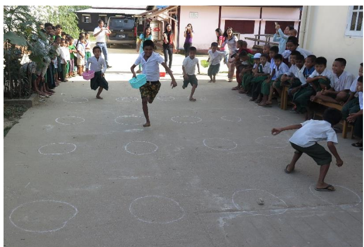
Look who is the fastest collector of potatoes!