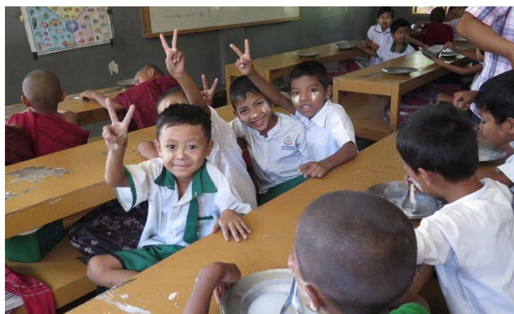
The kids posed happily after enjoying their favorite food.

We understand that a fun day wouldn't be complete without delicious food. So our team made a few pots of milk porridge for the children to enjoy before the games, and then quenched the thirst of the sweaty children after the "actions".