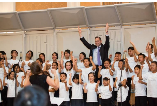
The American Ambassador performing together with the "New Children's Choir"