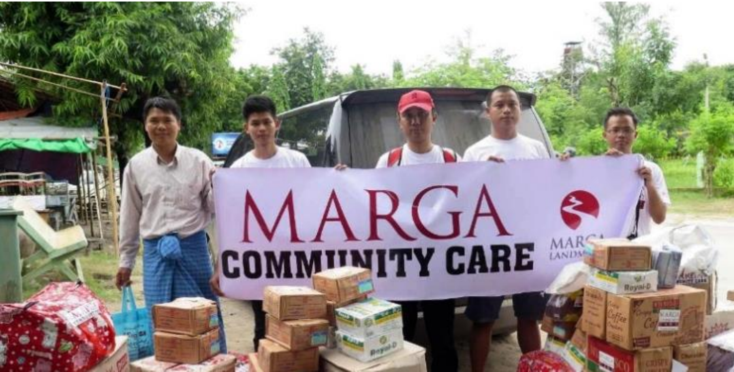
Our first flood relief team delivered relief supplies to the Kantbalu Flooding Rescue Committee Office.

Marga Community Care (MCC) team responded quickly to the victims' call for help and mobilized two teams comprising 15 staff members in total to deliver emergency aid to victims at Sagaing Division and Magway Divisions, two of the worst hit areas.