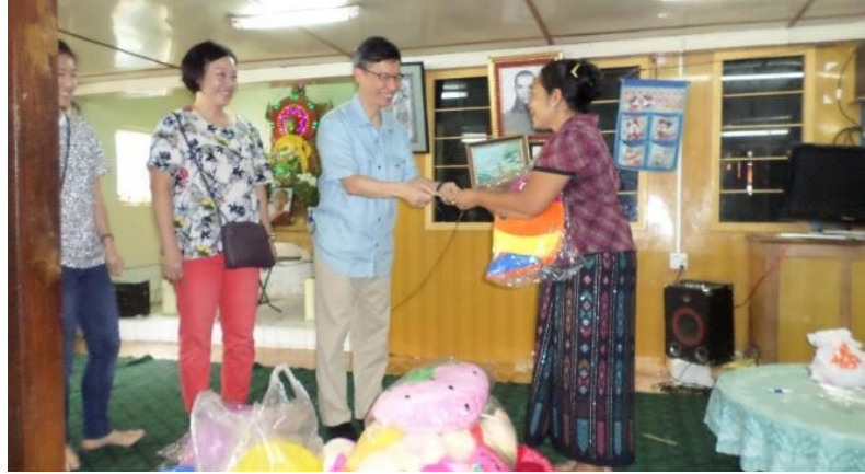
A representative from Marga Senior Management giving the cash and gift donation to the guardian.

The MCC team visits different orphanages and child care centers on a regular basis because we firmly believe that every child deserves care and affection regardless of their backgrounds.