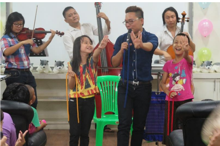
Children enjoyed co-performing with the magician.

An atmosphere of joy and peacefulness filled the packed conference room as the 10-people string ensemble from Orchestra for Myanmar played happy tunes for the audience. When the MCC team sang the familiar “Moe” song to the melody played by the orchestra, the parents and the older children sang along and clapped.