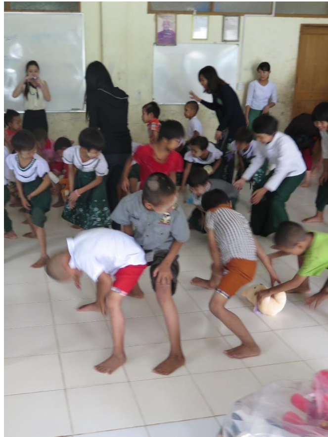
The team teaching kids how to play harmoniously as a team.

Their happy, genuine smiles are the best reward for us, motivating us to do more good.