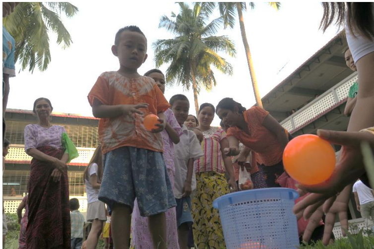
Children lining up to participate in basket-ball-throwing game

irresistible world of magic with the exciting and captivating tricks by the famed magician Ko Lynn Nay. Other than all the participants in the central garden, young patients and even nursing staff at the other floors of the four-storey main building came out and enjoyed an aerial view of the show.