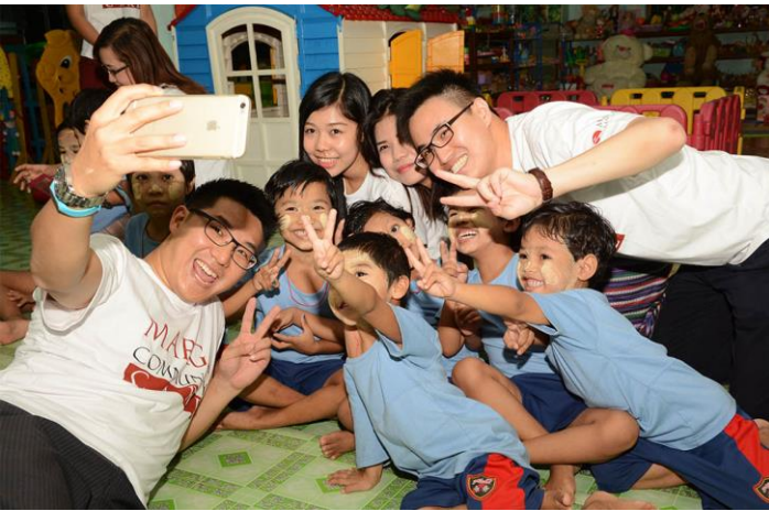
Our senior team with the children at the nursery.

“As a father, I fully understand that children need their parents to guide and support them in their different stages of life. I hope that our presence can assure them that many people care for them and that they are not alone. Our MCC activities are a long-term program so that we will keep supporting these orphans in the hope of helping them become good and responsible citizens of society.”