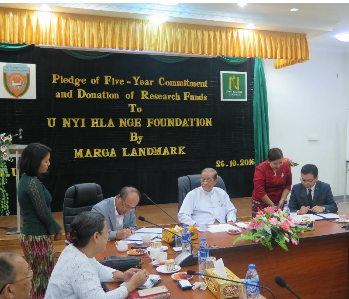
A donation and agreement signing ceremony was held at YTU to formally kick off Marga Group's long-term sponsorship for research fund for students from YTU.