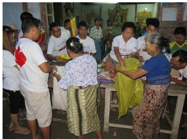
Villagers collecting relief supplies directly from our flood relief team.