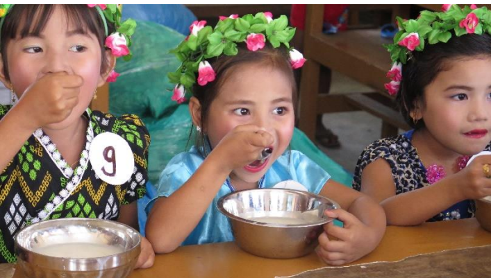
The kids really enjoyed the milk porridge our team prepared for them.