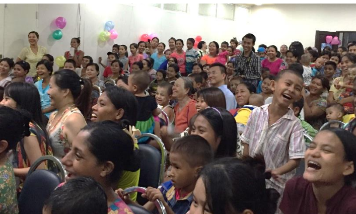
The children and their parents had a fun time together.

The day’s program ended with more warm smiles when the children received the soft toys we specially brought for them, and took pictures with the chicken characters. We also got toys for the children who were not able to join us due to their special conditions. “My daughter told me that it is her happiest day in the hospital ever,” a smiling mother told us. These words of encouragement really warm our hearts.