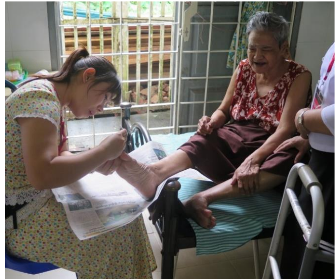
A grandma enjoying the service from our team member.

“We (MCC) did our bit by giving our warm hands and embrace to the elderly people who really need to feel more warmth in their aging lives. These experiences give us happiness, and also teach us to be more responsive to the needs of the elderly at our own homes.”