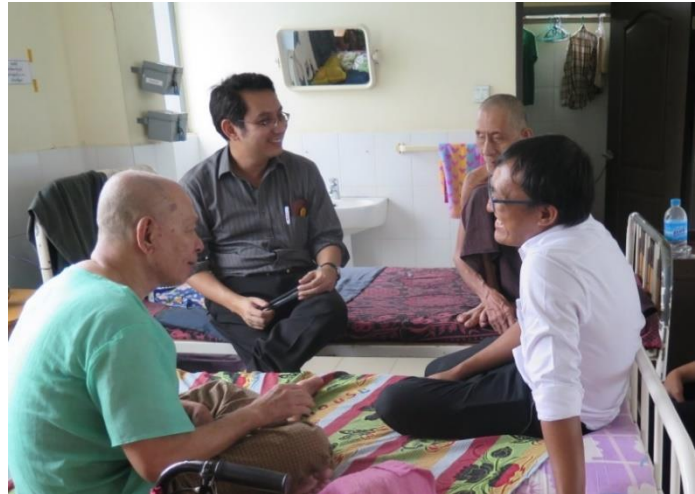
The grandpas sharing their life stories with our team members.

We wish all elderly citizens happiness and good health, and that we shall continue to put smiles on their faces.