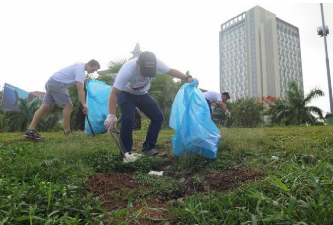
MCC team collecting the trash along the bank of Inya Lake

With sweat dripping down their faces, coupled with their satisfied smiles, our enthusiastic volunteers did not just stop at collecting trash along the Inya Lake bank, but even ventured further and took additional efforts to collect bottles, plastic bags, and other trash from the shoreline. Aside from cleaning up Inya Lake, our other main objective was to raise awareness and reduce littering in Yangon public spaces.