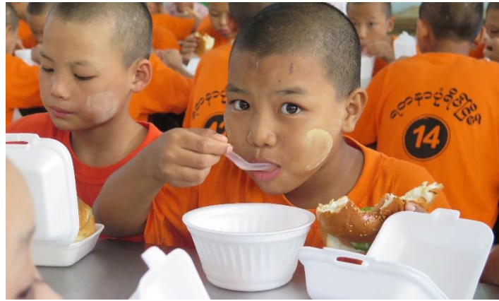
The kids enjoyed the special treats we prepared for them.

October is the month in a year that Nate Ban Zay is most frequently organized across the country. To honour this beautiful tradition, the MCC team organized "Nate Ban Zay" at Yadanar Pone Yeik Nyein Monastic School with some extra fun games on 14 th October, 2015. We were charmed by the peace and quiet of the school in spite of the number of children the school houses. Most of the children are trained to become Buddhist novices. The trainer is very strict, yet very affectionate with the children. They look very calm and disciplined for their young age.