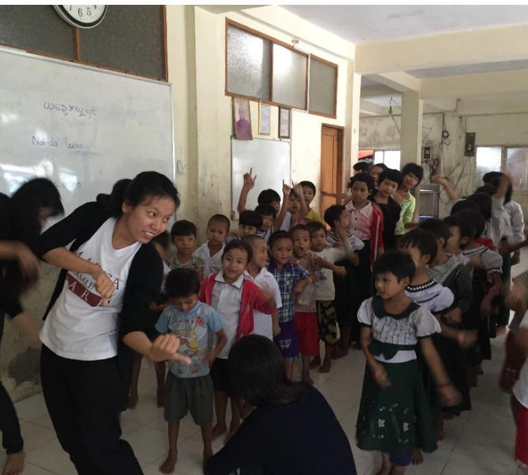
The team teaching the children to dance.