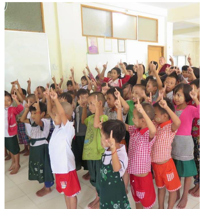
The group who had the best dance moves got the grand prize.