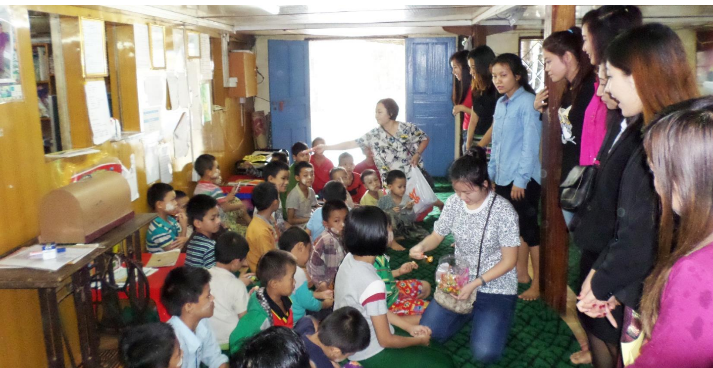
The team distributing the small gifts to the children.