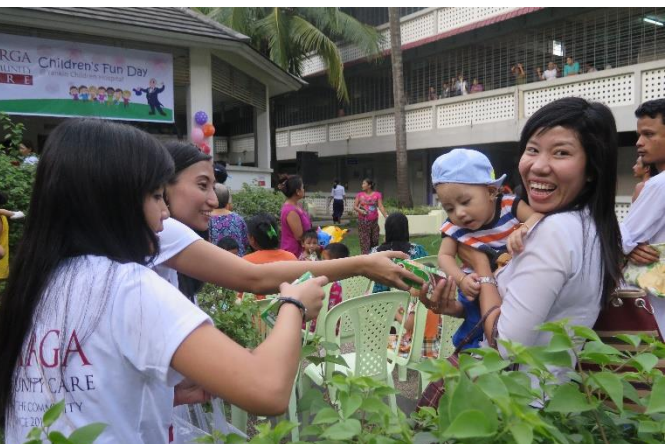
Happy faces of children and their guardians participating in our children's fun day event