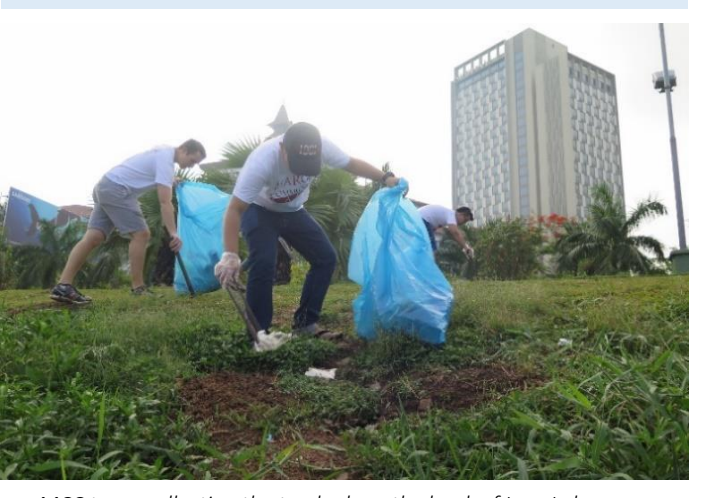
MCC team collecting the trash along the bank of Inya Lake

Marga Community Care recognises that other than our philanthropic efforts, effective and proper preservation is required to help preserve the environment and the community we live in. In the morning of 6th May, 2017, Marga Community Care held a community cleaning day at Inya Lake in collaboration with Yankin – Agora Center.