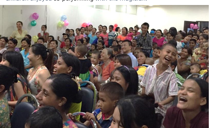
The children and their parents had a fun time together.