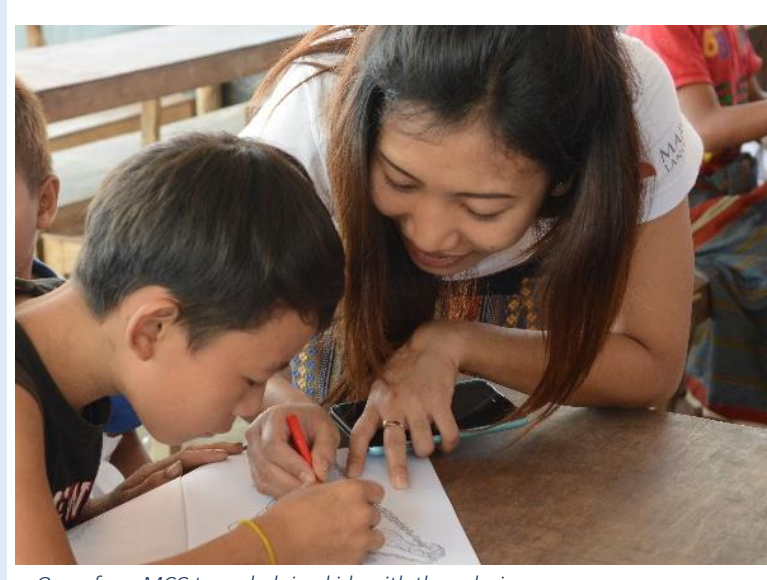
One of our MCC team helping kids with the coloring.