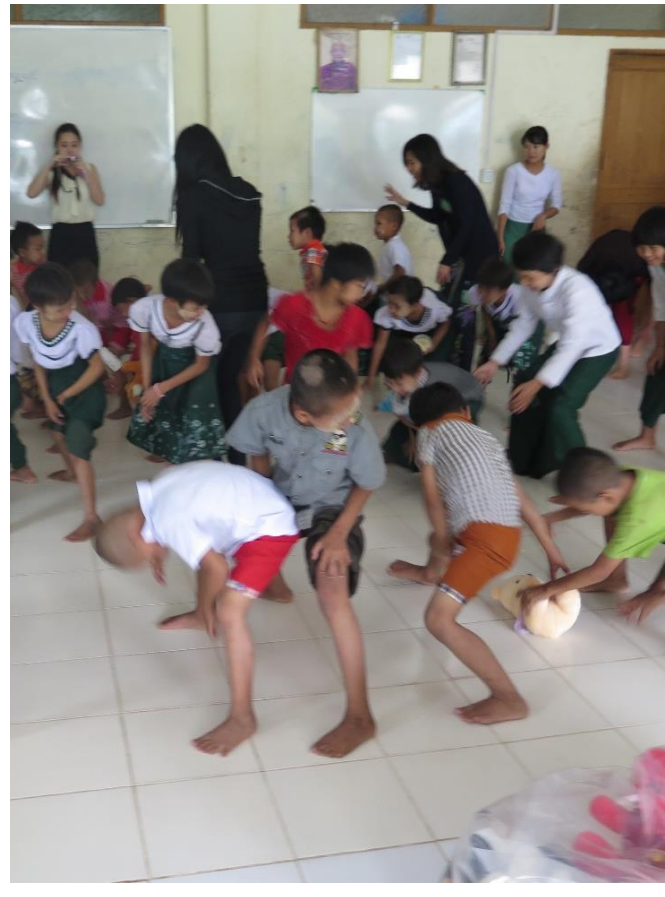
The team teaching kids how to play harmoniously as a team.

Their happy, genuine smiles are the best reward for us, motivating us to do more good.