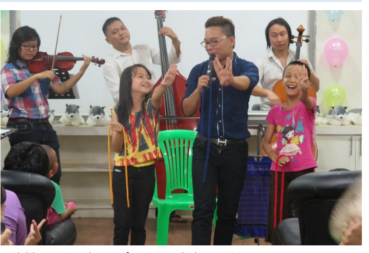
Children enjoyed co-performing with the magician.

We were delighted to give the children their first experience of "magic". Everyone at the conference hall was mesmerized by the charm and skills of the magician whose tricks surely give the children and their parents a magical moment of laughter and awe. Besides magic, our MCC team brought the story of the "3 little pigs" in colorful storyboards. We hope this story with the message of unity, discipline and friendship can instill energy and spirit into the children who are hospitalized due to different medical conditions.