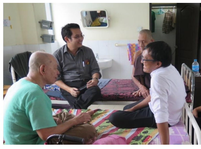
The grandpas sharing their life stories with our team members.

We wish all elderly citizens happiness and good health, and that we shall continue to put smiles on their faces.