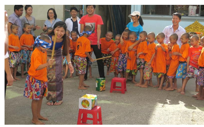
The team excitingly cheered a kid as he was preparing to hit the tin blind-folded.

The MCC team had an early start that morning in order to prepare chicken burgers and fruit punch for the children who had never eaten them before. We were glad that we were able to serve the children their first burgers and fruit punch which they really liked. After a small feast, there were rounds of rounds of games which the children participated enthusiastically. The highlight of the day was Than-Pone-Yite (hitting a tin box blind-folded) which got the children most excited and incited the loudest cheers from the entire school. The winners and participants were each awarded with a bag loaded with stationery, snacks and a frisbee.