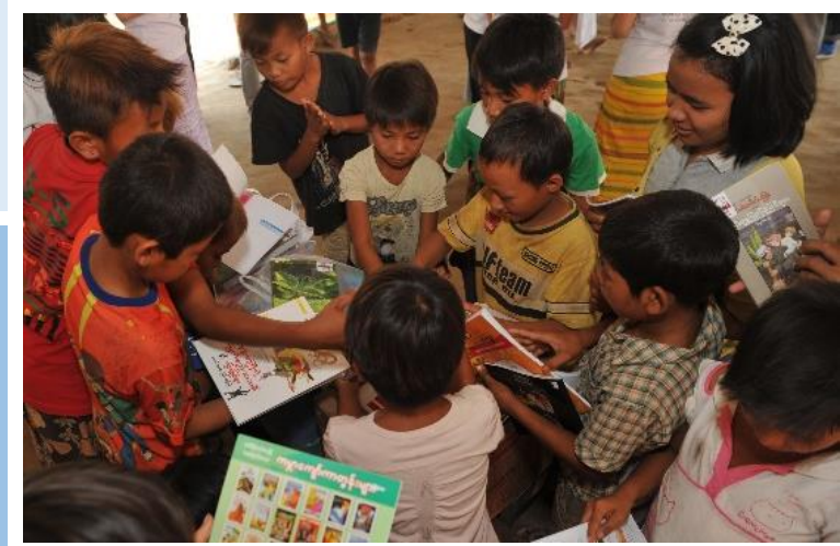
The children are overjoyed with the new books.

"It is pure joy to be able to help the underprivileged children. Their bright eyes and grateful smiles remind us that their future depend on us."