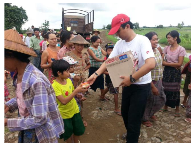
MCC team member passed the relief supplies to flood victims at Pay-Gone Village, Kantbalu Township.

More than 3800 units of medicine for diarrhea, cold & flu, water purification tablets and rehydration salts (dat-sar-htoke), 2700 units of nutritional drinks, noodles, and more than 230 pieces of clothes were directly handed over to the victims.