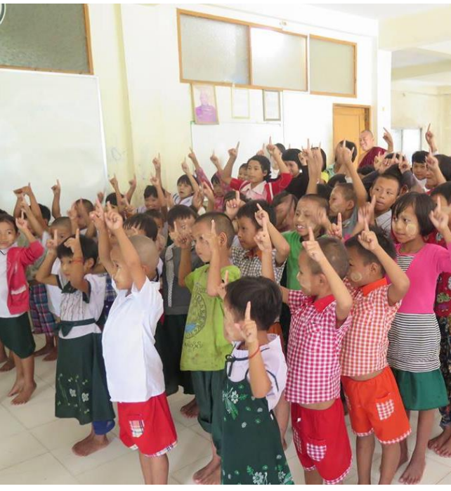
The group who had the best dance moves got the grand prize.