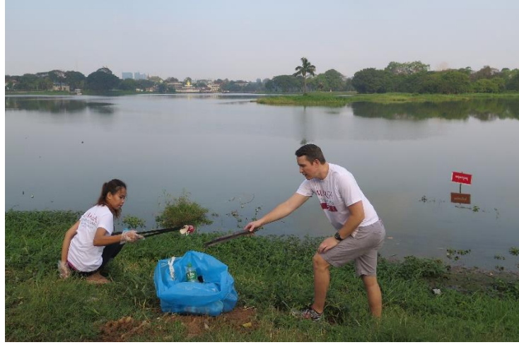
Volunteers collecting the trashes along the lakeshore

With sweat dripping down their faces, coupled with their satisfied smiles, our enthusiastic volunteers did not just stop at collecting trash along the Inya Lake bank, but even ventured further and took additional efforts to collect bottles, plastic bags, and other trash from the shoreline. Aside from cleaning up Inya Lake, our other main objective was to raise awareness and reduce littering in Yangon public spaces.