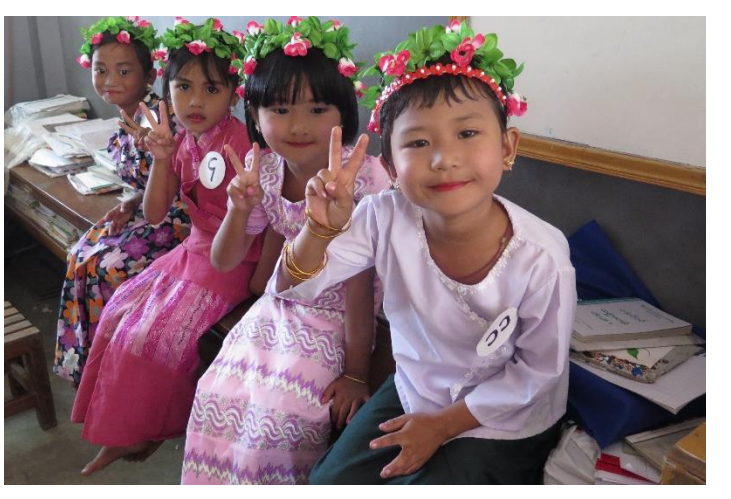
Super cute kids waited excitedly to show off their talents at the "beauty pageant"