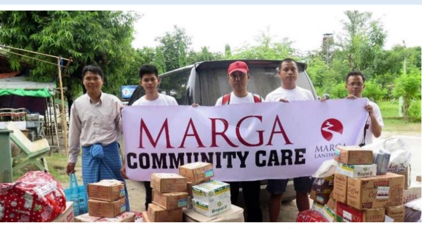
Our first flood relief team delivered relief supplies to the Kantbalu Flooding Rescue Committee Office.

Marga Community Care (MCC) team responded quickly to the victims' call for help and mobilized two teams comprising 15 staff members in total to deliver emergency aid to victims at Sagaing Division and Magway Divisions, two of the worst hit areas.