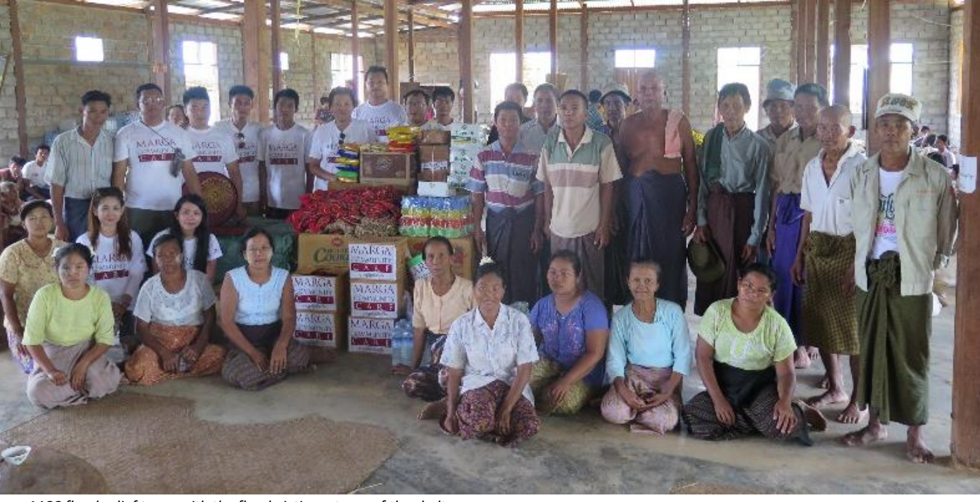
MCC flood relief team with the flood victims at one of the shelters.