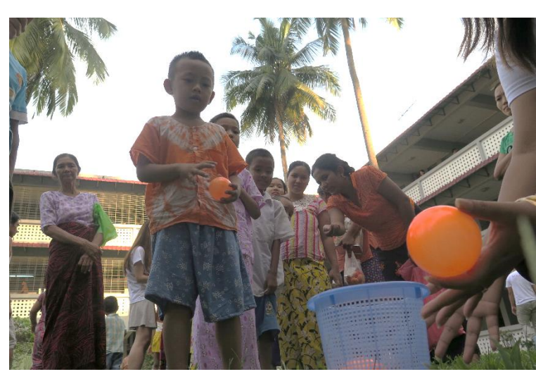
Children lining up to participate in basket-ball-throwing game

irresistible world of magic with the exciting and captivating tricks by the famed magician Ko Lynn Nay. Other than all the participants in the central garden, young patients and even nursing staff at the other floors of the four-storey main building came out and enjoyed an aerial view of the show.