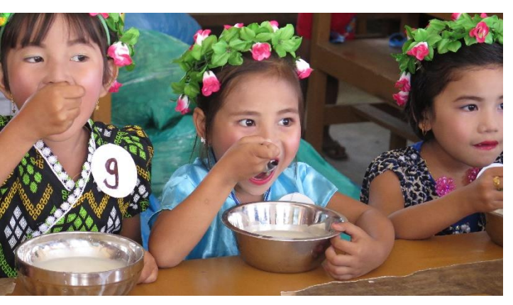
The kids really enjoyed the milk porridge our team prepared for them.

We understand that a fun day wouldn't be complete without delicious food. So our team made a few pots of milk porridge for the children to enjoy before the games, and then quenched the thirst of the sweaty children after the "actions".