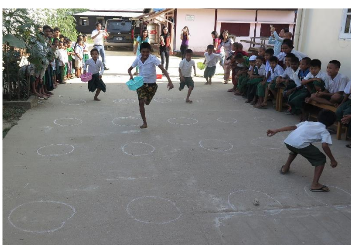
Look who is the fastest collector of potatoes!

Children's laughter filled the outdoor playground when we staged the fun games with two traditional games Arr-Lu-Kout (collecting potatoes) for boys and Za-Gaw-Ywat (walking with the plates on the head) for girls. The children were so loud that even other families in the neighborhood came into the school to enjoy the fun.