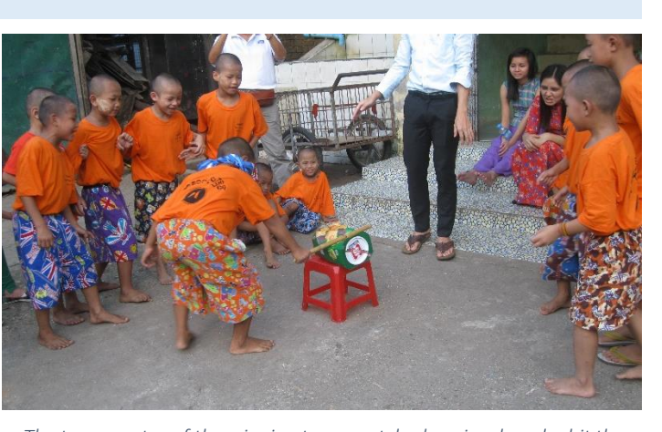
The team-mates of the winning team watched anxiously as he hit the tin at the final round.

October is the month in a year that Nate Ban Zay is most frequently organized across the country. To honour this beautiful tradition, the MCC team organized "Nate Ban Zay" at Yadanar Pone Yeik Nyein Monastic School with some extra fun games on 14<sup>th</sup> October, 2015. We were charmed by the peace and quiet of the school in spite of the number of children the school houses. Most of the children are trained to become Buddhist novices. The trainer is very strict, yet very affectionate with the children. They look very calm and disciplined for their young age.