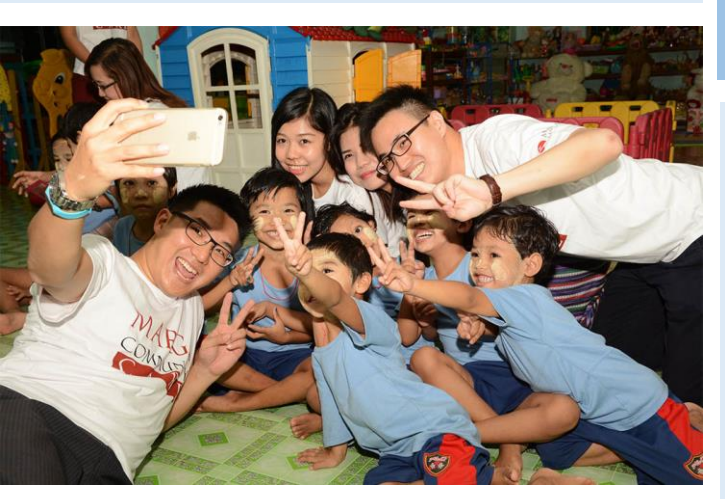
Our senior team with the children at the nursery.

In October 2014 Marga held its first "Race to the Light – Children's Fun Day" to honour the Myanmar Thadingyut Festival and Nate Ban Zay. On that sunny day in October, 200 Orphans from Youth Development Benevolent Villa and Department of Social Welfare and Development came to enjoy all the fun and surprises we prepared for them: singing and dancing, magic show, storytelling, caricature drawing and arts and crafts. Highlight of the day's pack programs was the hunt for hidden treasure in the maze specially constructed for the fun day.