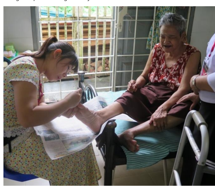
A grandma enjoying the service from our team member.

"We (MCC) did our bit by giving our warm hands and embrace to the elderly people who really need to feel more warmth in their aging lives. These experiences give us happiness, and also teach us to be more responsive to the needs of the elderly at our own homes."