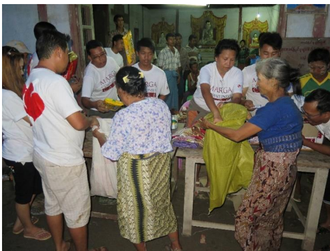
Villagers collecting relief supplies directly from our flood relief

The victims received help from all over the country. Many individuals and companies contributed through various formats and channels. Marga is glad that our help reached the victims.