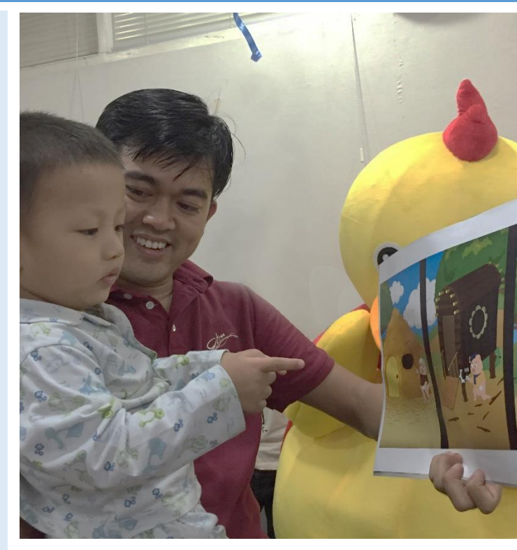
A little boy listened to a MCC member telling the story of "The Three Little Pigs"

An atmosphere of joy and peacefulness filled the packed conference room as the 10-people string ensemble from Orchestra for Myanmar played happy tunes for the audience. When the MCC team sang the familiar "Moe" song to the melody played by the orchestra, the parents and the older children sang along and clapped.