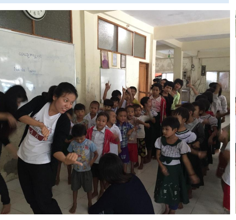
The team teaching the children to dance.