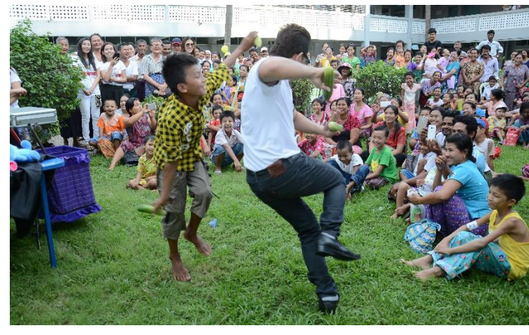
A magical dance performed together with the magician and a volunteer kid.