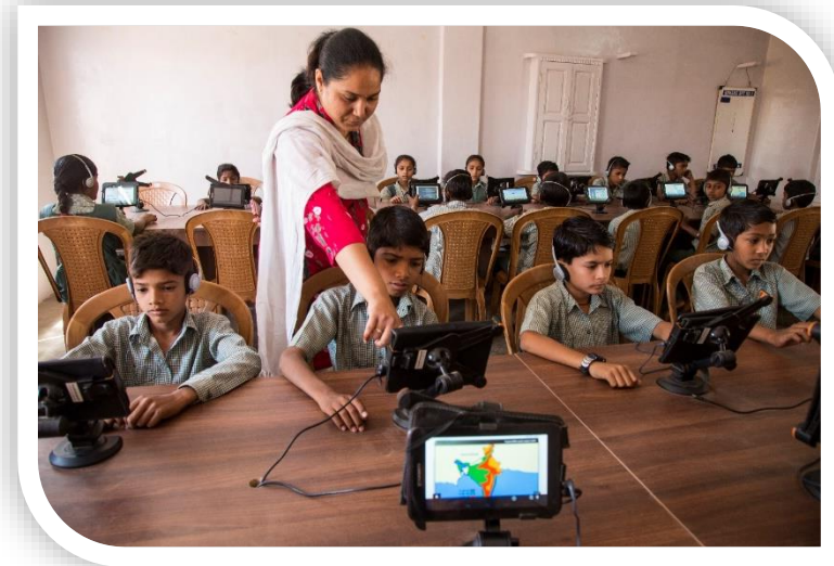
Students in Odisha are provided with computers through the Digital Equalizer program with AIF.

DIGITALWorks is an initiative launched as part of Avasant Foundation's commitment to ensure job creation and skills enhancement for high caliber graduates. In Trinidad & Tobago, Avasant Foundation's DIGITALWorks initiative trains, hires and provides on-the-job coaching and career mentorship to deserving youth. DIGITALWorks offers a range of high quality ICT-enabled and BPO services from entry-level data content and rule-based processing to marketing, research and web design.