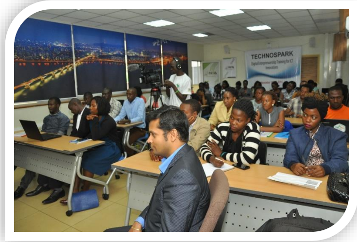
World Bank Funded the Technospark training, which had a majority of women attendees.

Avasant worked with the Government of Uganda to develop and strengthen ICT led innovation among the youth to enhance productivity competitiveness and promote efficient delivery of public services. Avasant and its Foundation helped the government of Uganda promote entrepreneurship by creating and piloting a “ TechnoSpark ” training. Through this World Bank funded effort, Avasant partnered with the RAN Innovation Lab and NITA-UICT industry association to offer the training in Kampala, primarily for women. Avasant Foundation is now looking to expand its iGNITE entrepreneurship training and incubation model in Africa and globally.