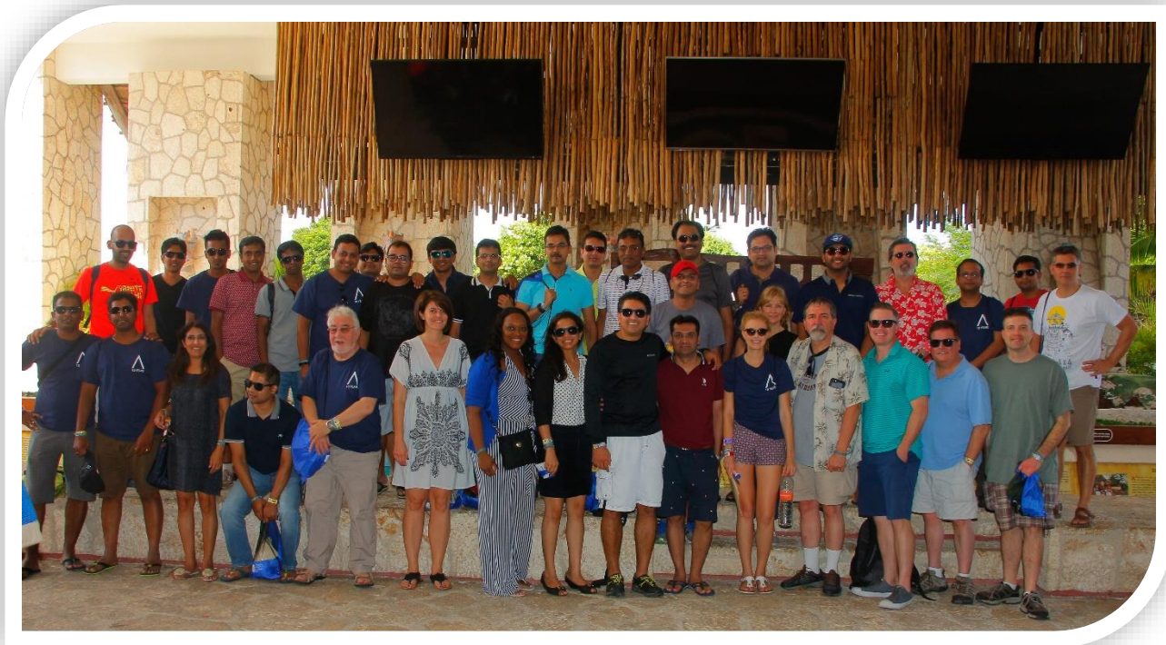
A number of Avasant employees visited Xel-Ha in Cancun, Mexico as part of a bonding activity at the most recent company offsite.

Avasant does not discriminate in hiring, remuneration, access to training, promotion, termination or retirement based on age, race, caste, national origin, religion, disability, gender, sexual orientation, union membership, or political affiliation.