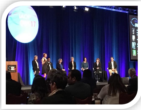
IAOP and AF presenting the Women Empowerment and Opportunity in Outsourcing survey results at IAOP OWS17.