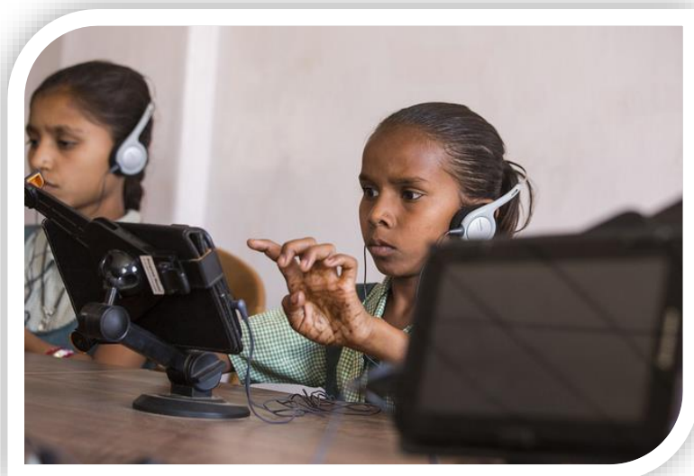
Students learn digital skills in Karnataka and Odisha schools aided through AIF.