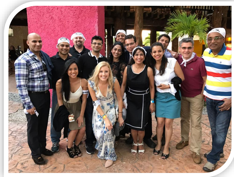
Avasant employees at the most recent Avasant Company Offsite 2016.

Avasant is committed to a consistent and fair tender process and to facilitate this, all potential suppliers receive: Request for quotation/proposal RFP/RFQ letters inviting suppliers to participate, Intent to respond documents, and Non-disclosure documents.