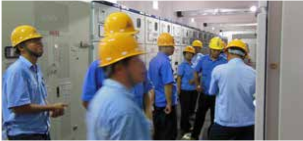
Hainan Mining EHS System Audit captions

The Group is committed to providing a safe and comfortable working environment for its employees. In order to keep in line with the International Safety Performance Indicator System, the Group issued the “Occupational Health, Safety and Environmental Protection Performance Indicators Management Procedure of the Safety and Environmental Protection Special Standard of Fosun Group” in September 2016, requiring the enterprises to report all lost time injury and the frequency of such cases and other EHS leading indicators, which has further enhanced and refined EHS management.