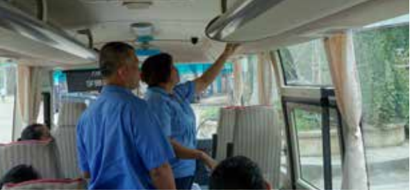
Vehicle escape emergency drill