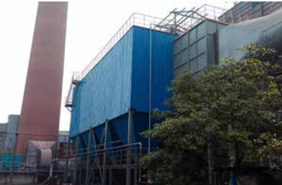
1#Sinitering machine tail

Nanjing Nangang strengthened the management of environmental protection facilities to ensure the emission of all kinds of pollutants according to standard, satisfactorily completed the emission reduction target issued by the municipal government, successfully passed the inspection by the Central Supervision and Inspection Group for Environmental Protection and withstood the test of G20 Summit environmental management and control. The plant environment and environmental management work of Nanjing Nangang were recognized and well–received by the environmental protection authorities of the government and Nanjing Nangang was accredited as a clean production environmentally friendly enterprise by China Iron and Steel Association.