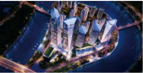
Forte Financial Island in Chengdu

Fosun emphasizes the construction quality of real estate, adheres to establishing brands with quality and implements them in the various stages of project construction. There were also a number of outstanding projects emerging in 2016 and two selected projects are briefly described as follows: