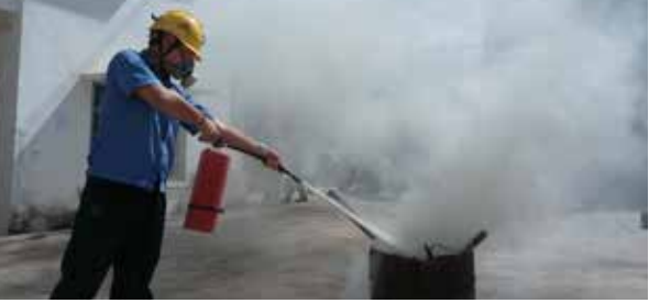
Firefighting emergency drill