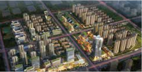
Xinghong Hefei Financial Innovation City

Forte Financial Island was recognized as “Standardized Construction Site of Chengdu”, “Standardized Construction Site of Sichuan” and “Green Site of Chengdu”. It hosted the “Construction Quality and Safety Standards On-site Observation Meeting of Sichuan Province for 2016” and accepted the on-site inspection conducted by the Ministry of Housing and Urban-Rural Development in December 2016 and was highly appraised.