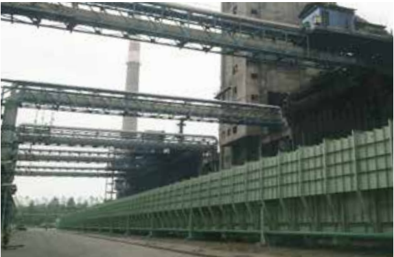
dust removal efficiency enhancement

Hainan Mining attaches great importance to environmental protection. In 2016, effective monitoring data for various kinds of pollutants amounted to nearly 20,000. Both the annual self–monitoring result and the supervisory monitoring result met the standard. Good results were achieved in environmental protection emission, energy saving and emission reduction. The industrial wastewater discharge compliance rate was 100% and the exhaust emission compliance rate was 100%, In particular, the water cycle utilization rate has been greatly improved, reaching 91%.