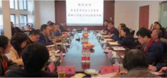
Suzhou Erye EHS System Audit