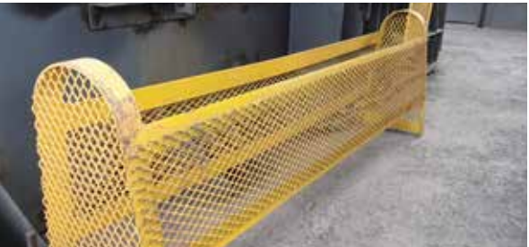
Mechanic guarding rectificationMechanic guarding rectification