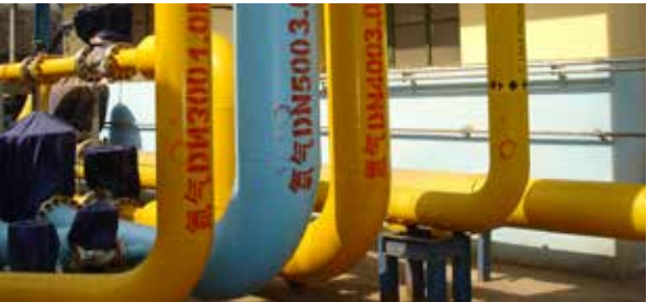
Carrying out anti-corrosion works

The Group firmly believes that product quality is the core of product strength. We strive for excellence and make use of advanced quality control methods and means such as the implementation of Lean Six Sigma Management to strive to provide customers with safe and high-quality products.