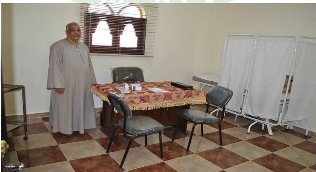
(A picture of the general clinic)