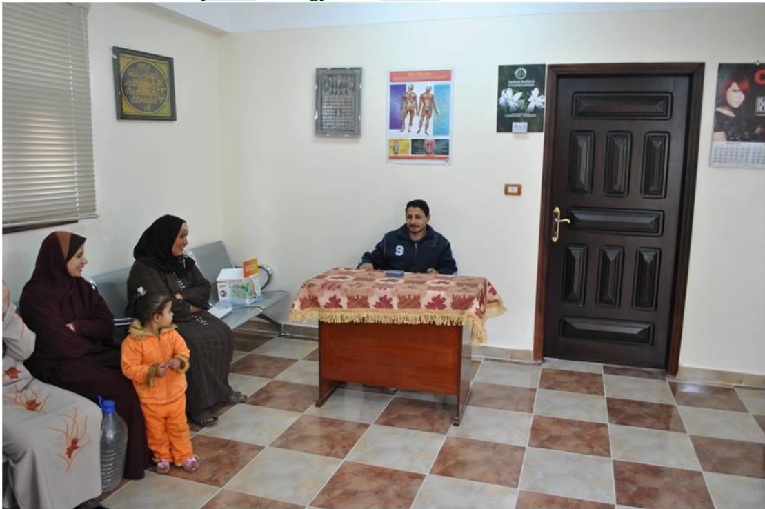
(A picture for the gynaecology clinic)