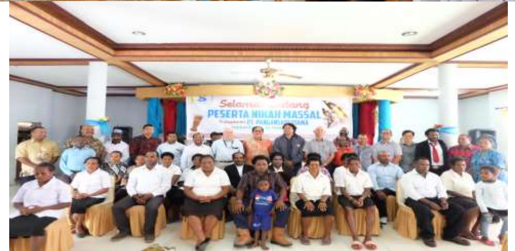
Scholarship for Local Papuan batch VI 2016