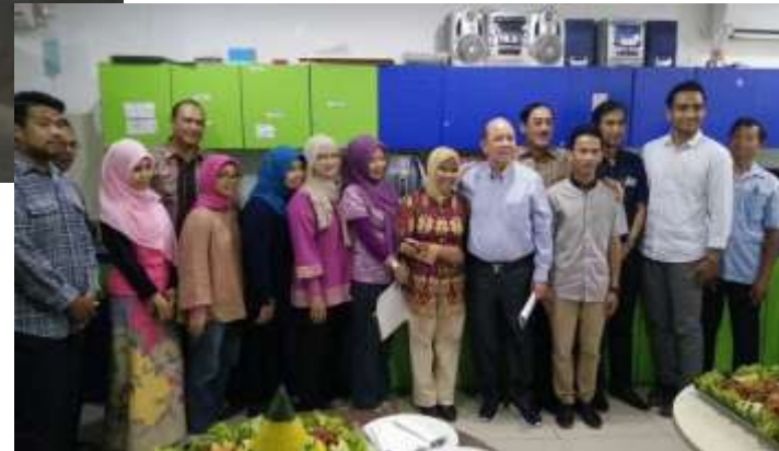
Monthly Employee's Birthday