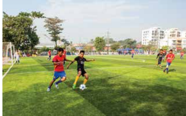
Winter Sports organized by GGI