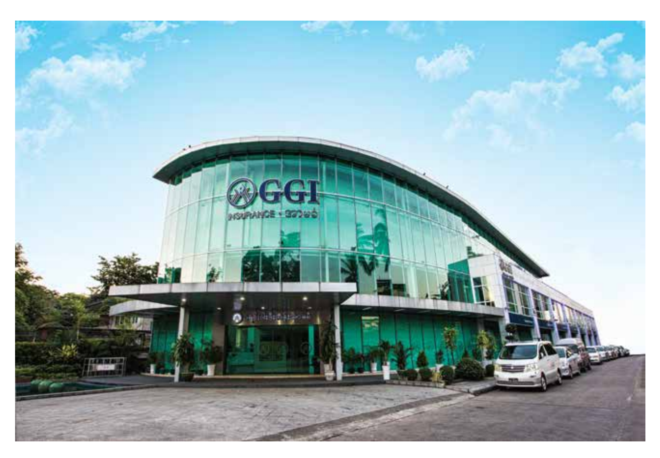
Grand Guardian Insurance Public Co., Ltd. Head Office at Yangon, Myanmar

The Head Office was inaugurated on 12th June 2013. In the following year, Mandalay Branch was opened on 20th January 2014. Given the importance of having strong distribution channel, GGI has opened a total of 13 branches including the Head Office in various parts of the country. The Head Office of GGI, located at Pyay Road, Yangon has more than 200 employees. The following is a list of various branches of GGI in different parts of the country: