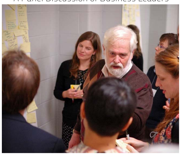
A Working Group Brainstorms Together