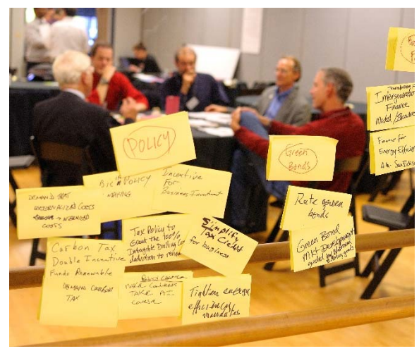
An Appreciative Inquiry Breakout Session