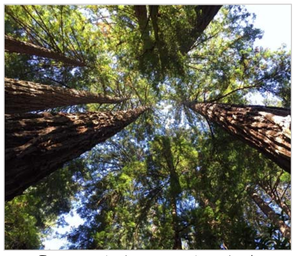
Strategic Innovation Lab