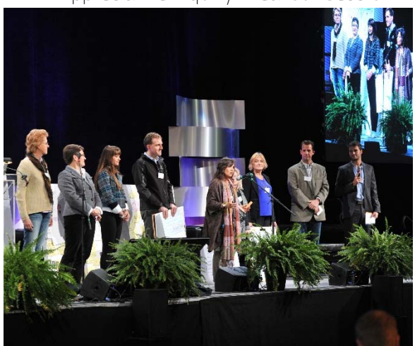
Another Group Reports Out to the Forum