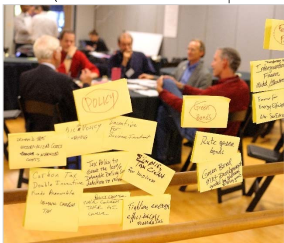
Global Forum Series