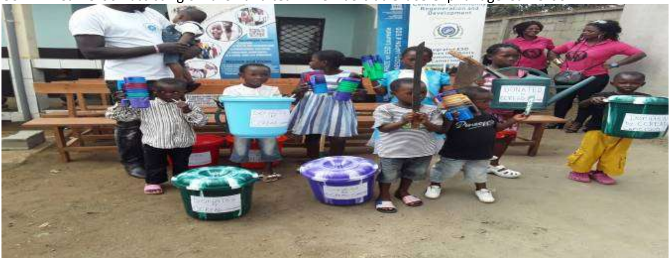
Donation of benches, buckets and gardening materials to orphanages-Cameroon