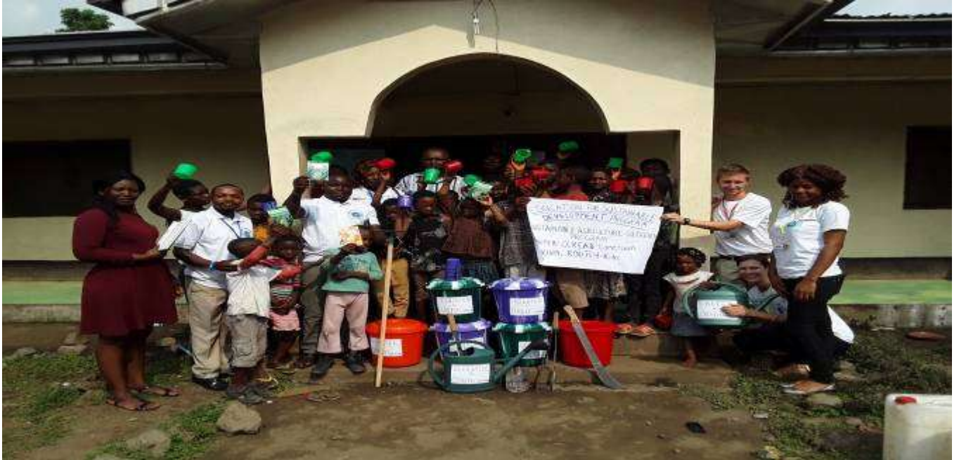
CCREAD-Cameroon assisting children and team members at Grace Orphanage-Cameroon