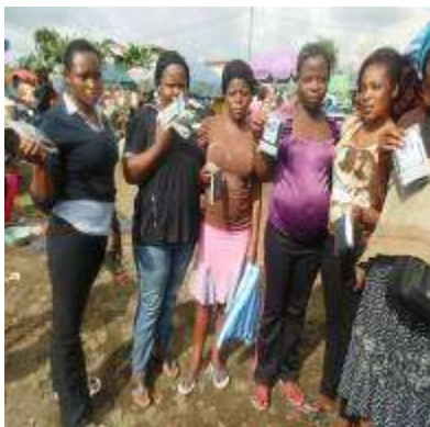
Giving hope to pregnant village women