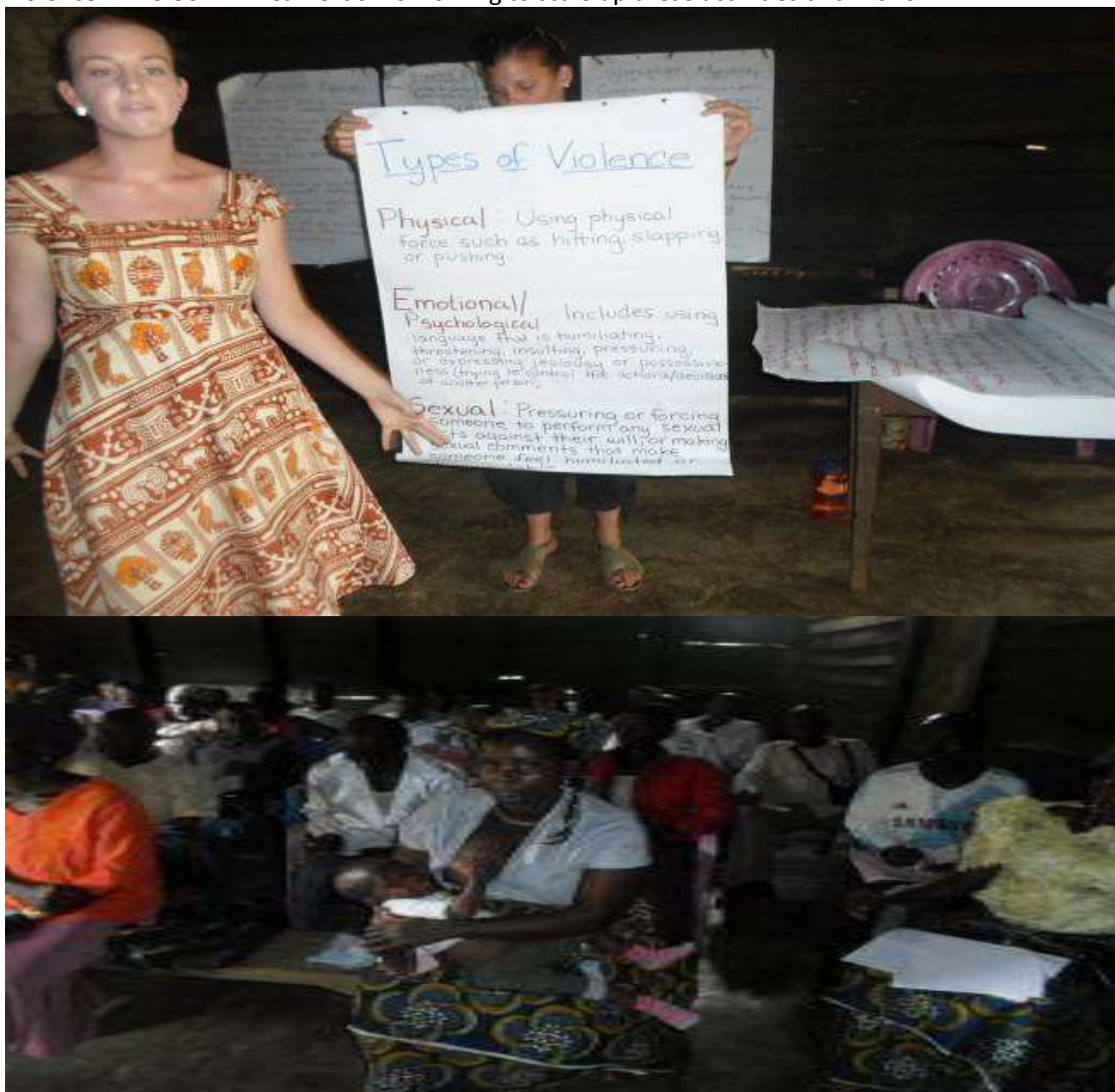
CCREAD-Cameroon focuses on fighting all forms of domestic violence on women and girls

Functional groups are now campaigning against sexual, physical, emotional and other forms of violence while CCREAD-Cameroon is working to scale up these activities until 2020.