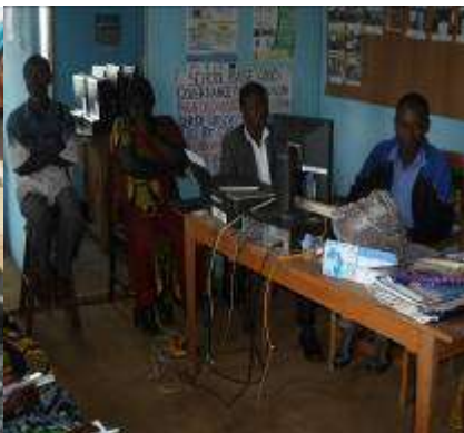
Women take part in action planning