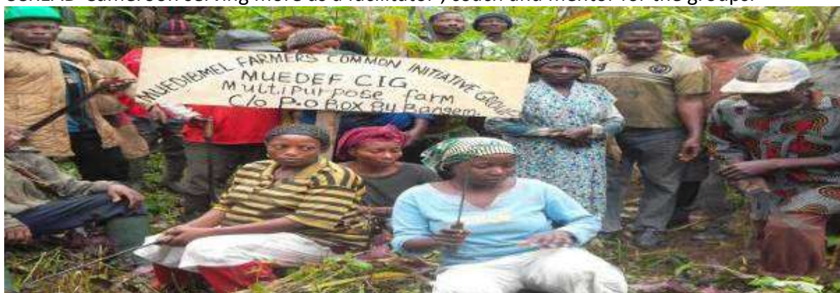
Groups created and coordinated by CCREAD-Cameroon in actions during an on farm training

This was thought to be an important activity because local communities have come to be very effective and efficient in projects and programs through these groups which they are the leaders with CCREAD-Cameroon serving more as a facilitator , coach and mentor for the groups.