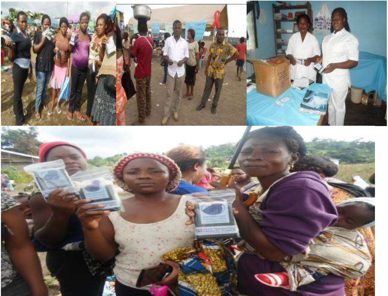
PMTCT actions and the donation of life saving birthing kits to pregnant women in villages

The project is a long term commitment of CCREAD-Cameroon to reduce maternal mortality within impoverished communities.