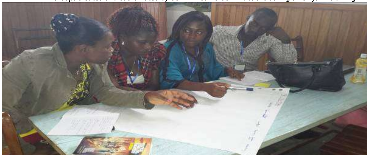
Providing training to leaders of community development groups