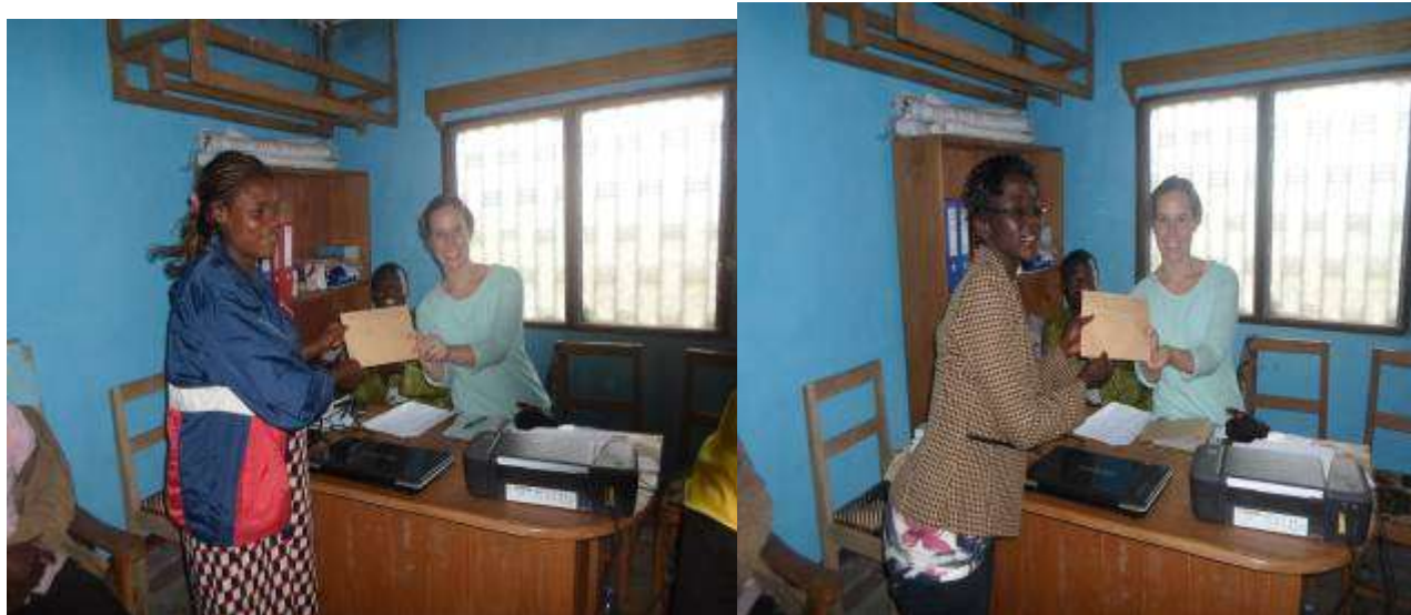
Teenage mothers supported by CCREAD-Cameroon to reduce poverty incidence on their families

Another activity which took the time and resources of the management of CCREAD-Cameroon was a response to the many appeals made by a group of teenage mothers who have been abandoned by men. A total of 50 teenage girls were assisted through the granting of small micro finance scheme to enable them set up small businesses to generate income. The scheme was financed by voluntary crowd funding donations. CCREAD-Cameroon's international volunteers coordinated the project which took place in Bangem, Bakassi and Mamfe in the year 2016. By December 2016, these teenage girls were already in business with the help of small financial donations from CCREAD-Cameroon