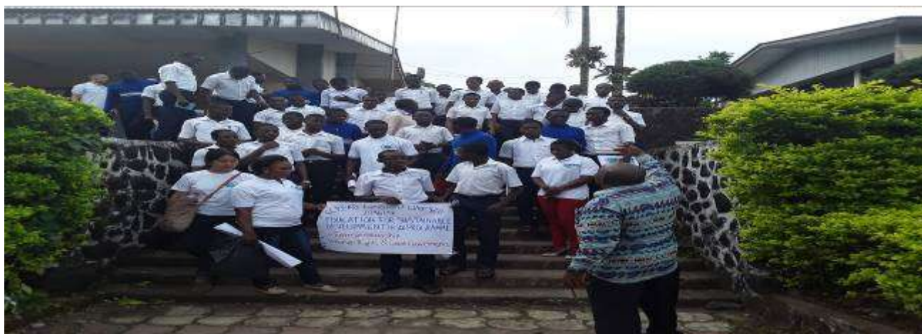
Youths educated on vital human development through educational workshops