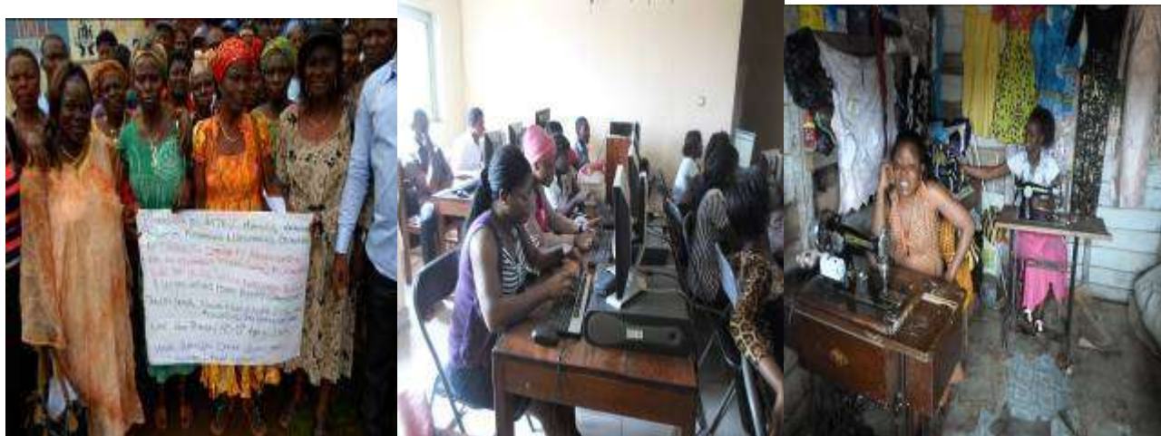
Actions implemented and impact being created on the lives of rural women