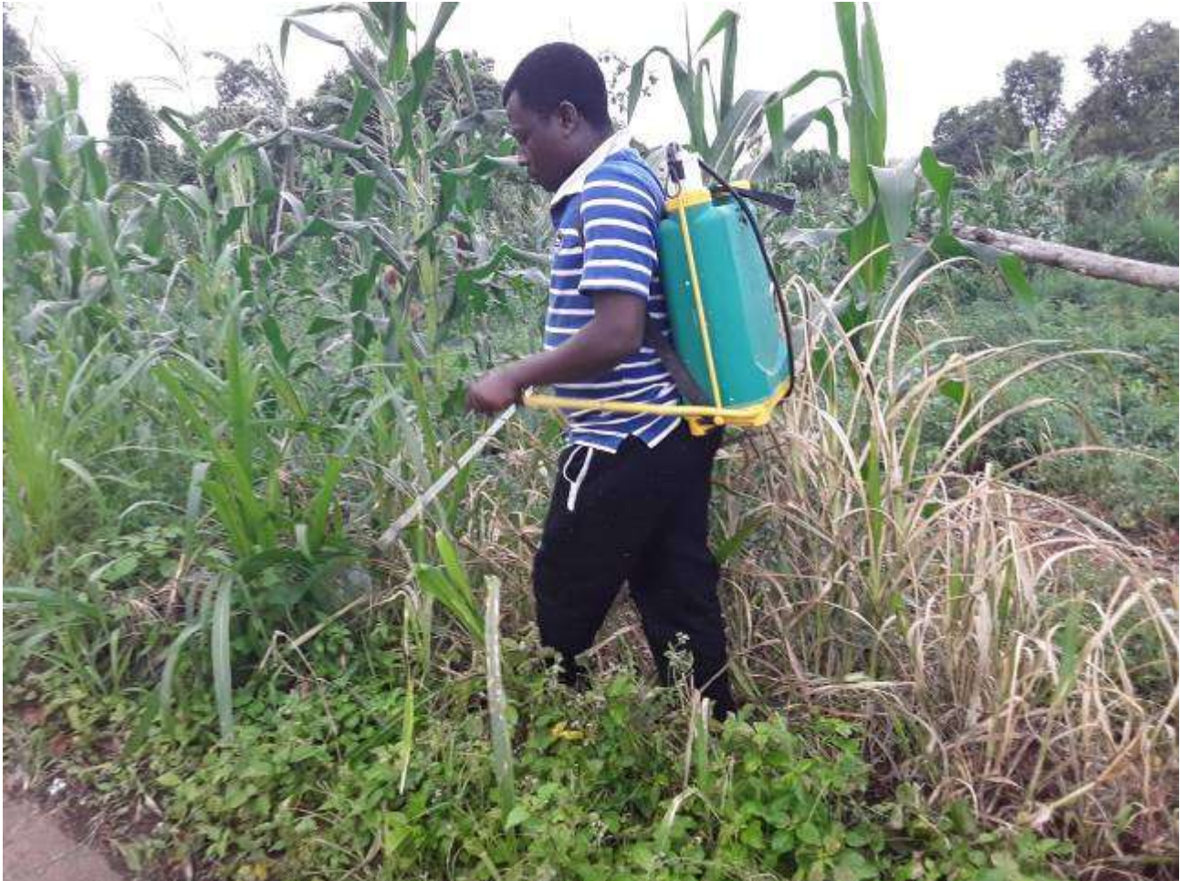
The Director of CCREAD-Cameroon Trains youths in action on mix cropping on the same piece of land