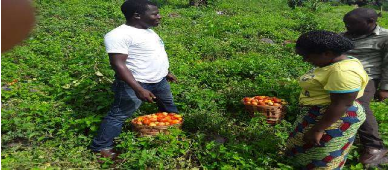
CCREAD-Cameroon assists a family to grow and market fresh tomatoes for income generation