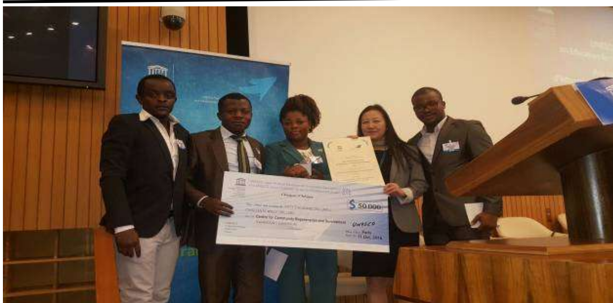
Creating opportunities for the empowerment of marginalised children, women and youths in Cameroon's poorest and marginalised communities merged with the promotion of environmental sustainability (2016-2020)