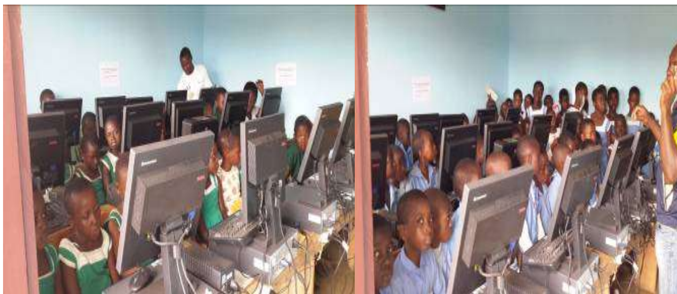
Charity ICT training units for marginalised community primary schools managed by CCREAD-Cameroon

Working with 5 community schools in 2015, CCREAD-Cameroon through donations was able to set up ICT training rooms for 3 schools where CCREAD-Cameroon locally recruited volunteers to provide free ICT training for children and community schools within very poor communities where parents cannot afford purchasing computers and the children need to have computer lessons as part of their end of year examinations. A minimum of 700 children were trained in 2016 by these charity schools ICT training units managed by the community and volunteers from CCREAD-Cameroon. This phase of the project was implemented in the Littoral Region of Cameroon and towards the end of 2016, CCREAD-Cameroon had handed over the training units to the local councils who are managing the units fully while expert trainers from CCREAD-Cameroon go periodically to check the progress made.