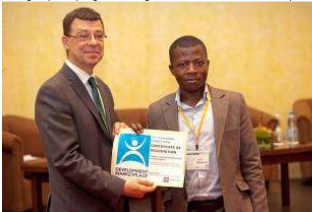
Recognition from the world Bank