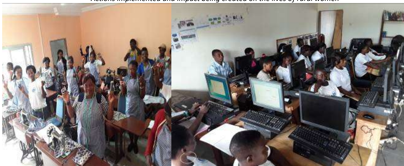
Intensive vocational training schools established for women and youths in 2016