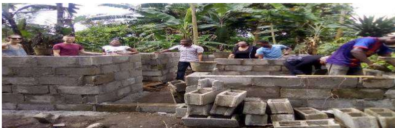
Building of a multipurpose and production livestock Unit for widows and single mothers