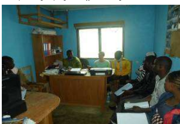
Youth delegates present their option documents