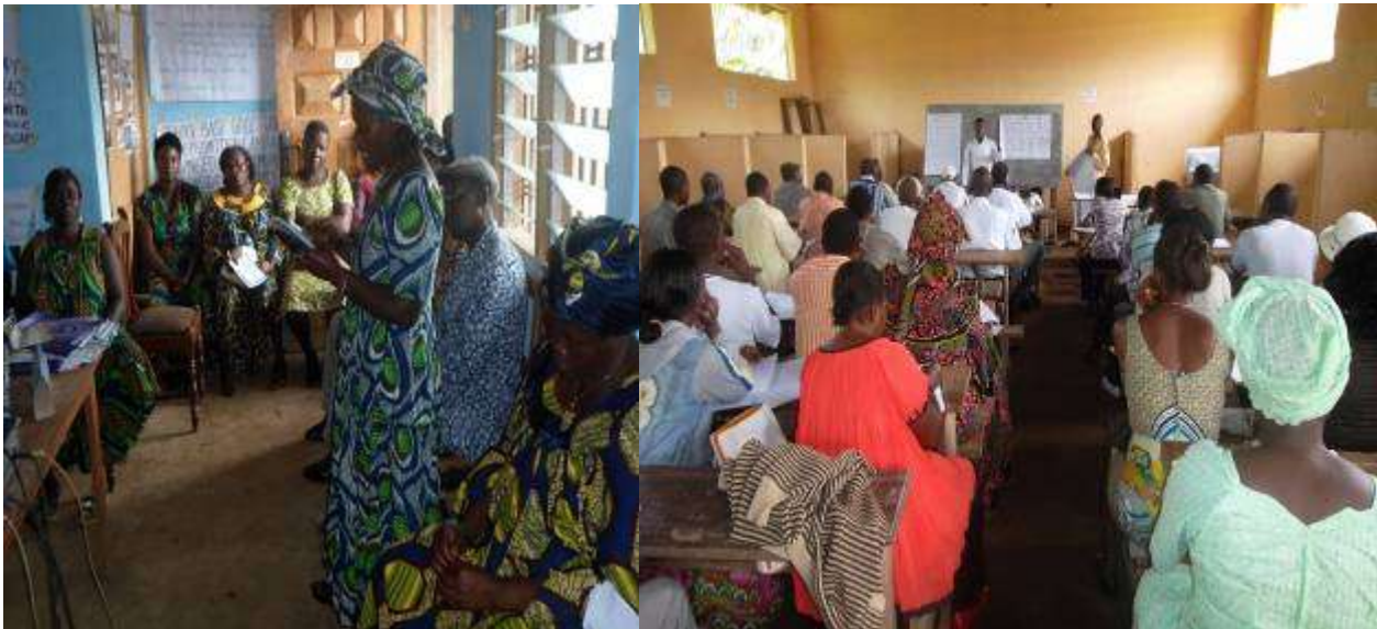
Rural women local governance and leadership training activities organised by CCREAD-Cameroon