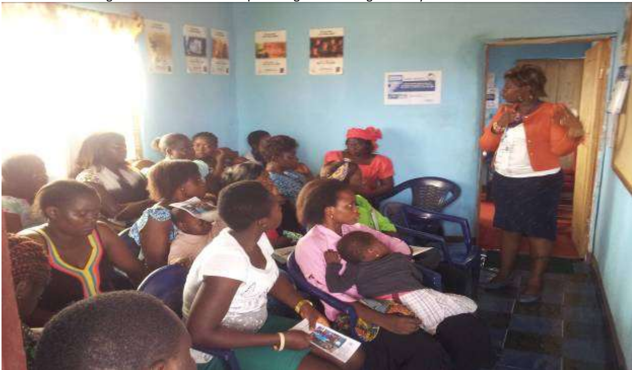
Training single mothers on staying alert against sexual and GBV within communities