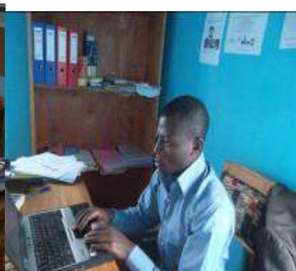
programs office in Bangem