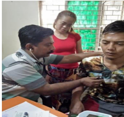
Periodical health check-up

Our organization has signed MoU with OM SAI SWARAHANTRA Pvt. Ltd. and has started the program, “Project LAST-RITE” for promotion and implementation of Improved Wood Based Cremation System – ‘Swarahantra - Cremation System’, which is wood saver, eco friendly, comparative economical and easy to use with keeping religious ritual in practice, ie Agni Kastha, Mukhagni, Panch samidha, Kapal kriya, AsthiPuja etc before, during and after burning the dead bodies (cremation process).