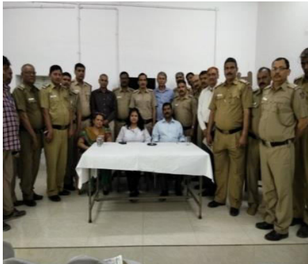
After group discussion