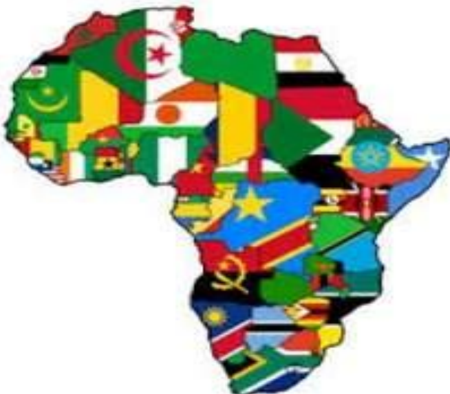
Photo: Map of Africa's 54 independent countries