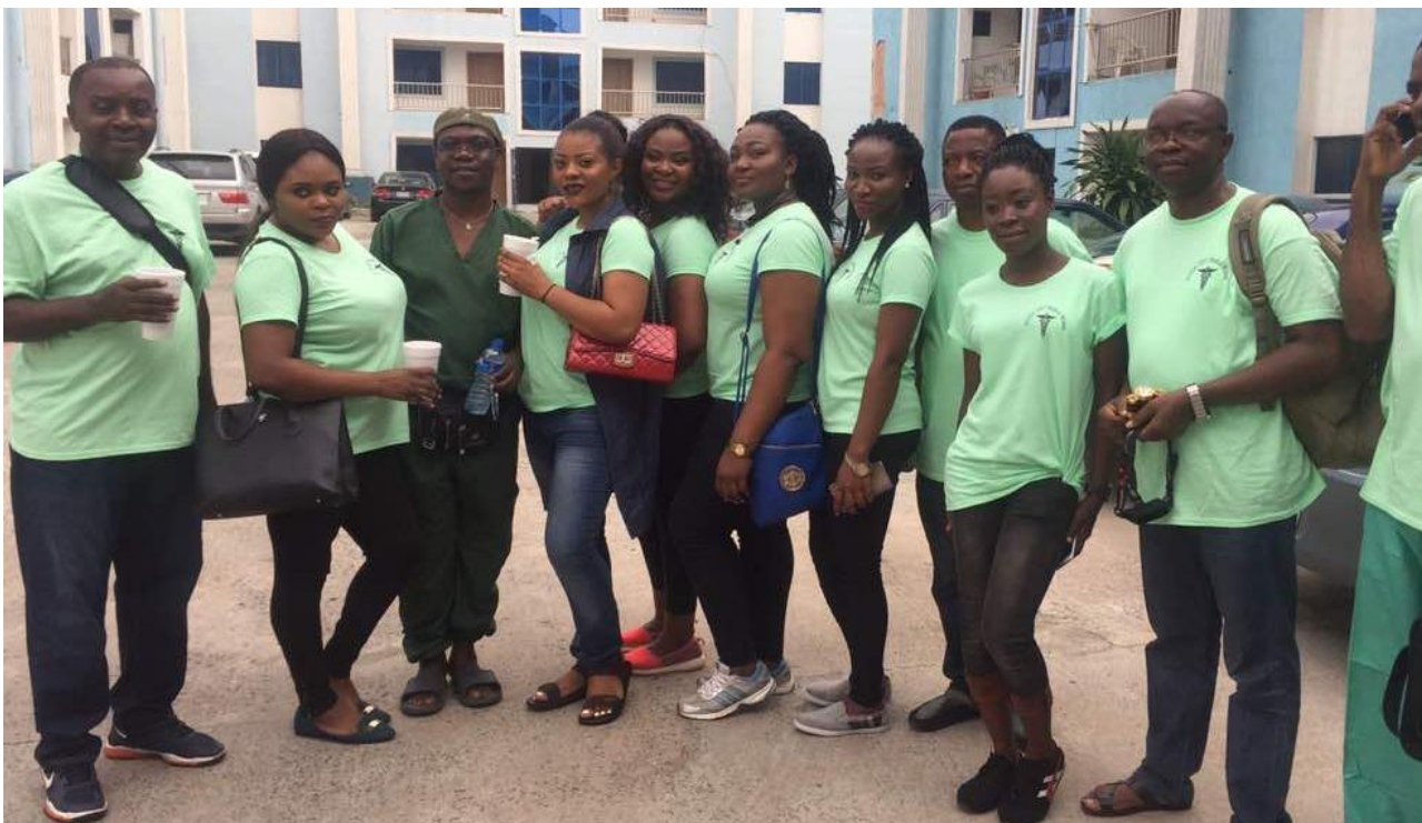
Photo: PROFOH medical team during the Imo state Medical Mission