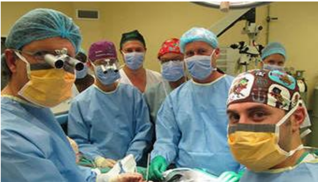
Photo: Team of South African Doctors inside the operating room

PROFOH South Africa issued a statement that congratulated a team doctors from Stellenbosch University and the Tygerberg Academic Hospital both near Cape Town. this is the second time such operation is performed in the world. The recipient name was withheld for ethical reasons; he is a 40 year-old male who had lost his penis seventeen years ago due to complications after a traditional circumcision. After the surgery, he did remarkably well as there are no signs of rejection and all the reconnected structures heal well. The intensive and marathon operation lasted almost ten hours at the Tygerberg Hospital. The patient is expected to regain all unitary and reproductive functions of the organ within six months of the transplant. The operation was described as a remarkable ground breaking procedure which is a testimony to the high level of skill that exists in the public health sector in South Africa. The world's first successful penile transplant was also performed by same team and Hospital December 11, 2014,that patients is doing extremely well both