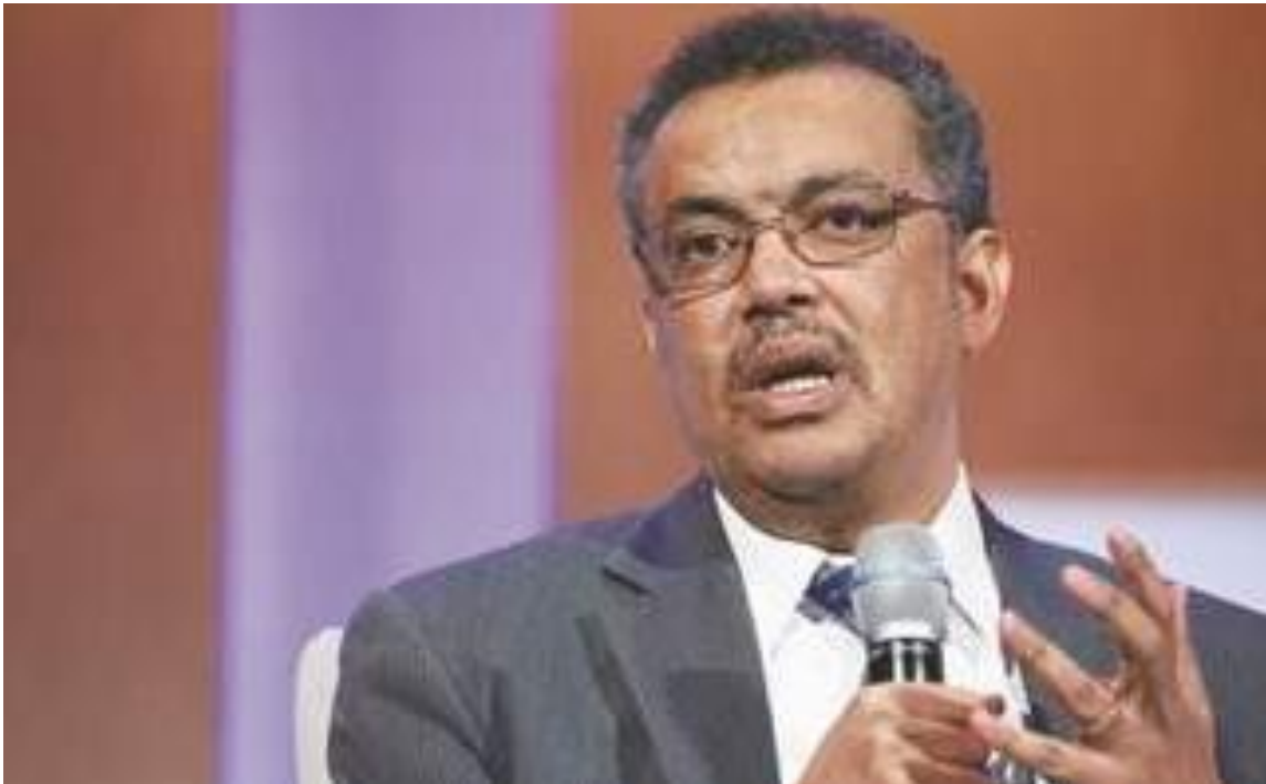
Photo: Dr Tedros Adhanom Ghebreyesus WHO Director General

Dr Tedros emphasized his experience as Ethiopia's health minister, overseeing the expansion of basic health services across the country. In six years, he oversaw the building of more than 16,000 health posts, 3,000 health centers, and deployed more than 40,000 female health extension workers. This innovative work done under his leadership was further supported by several of the Stop TB Partnership's TB REACH initiative's work in accelerating active case finding in Ethiopia. . As Minister of Foreign Affairs, he led the effort to negotiate the Addis Ababa Action Agenda, in which 193 countries committed to the financing necessary to achieve the Sustainable Development Goals Dr Tedros has also promised that transparency will be at the heart of the WHO once he takes charge. Dr Tedros will start his new term on 1 July 2017 Dr. Tedros, of Ethiopia; will begin his five-year term on 1 July 2017