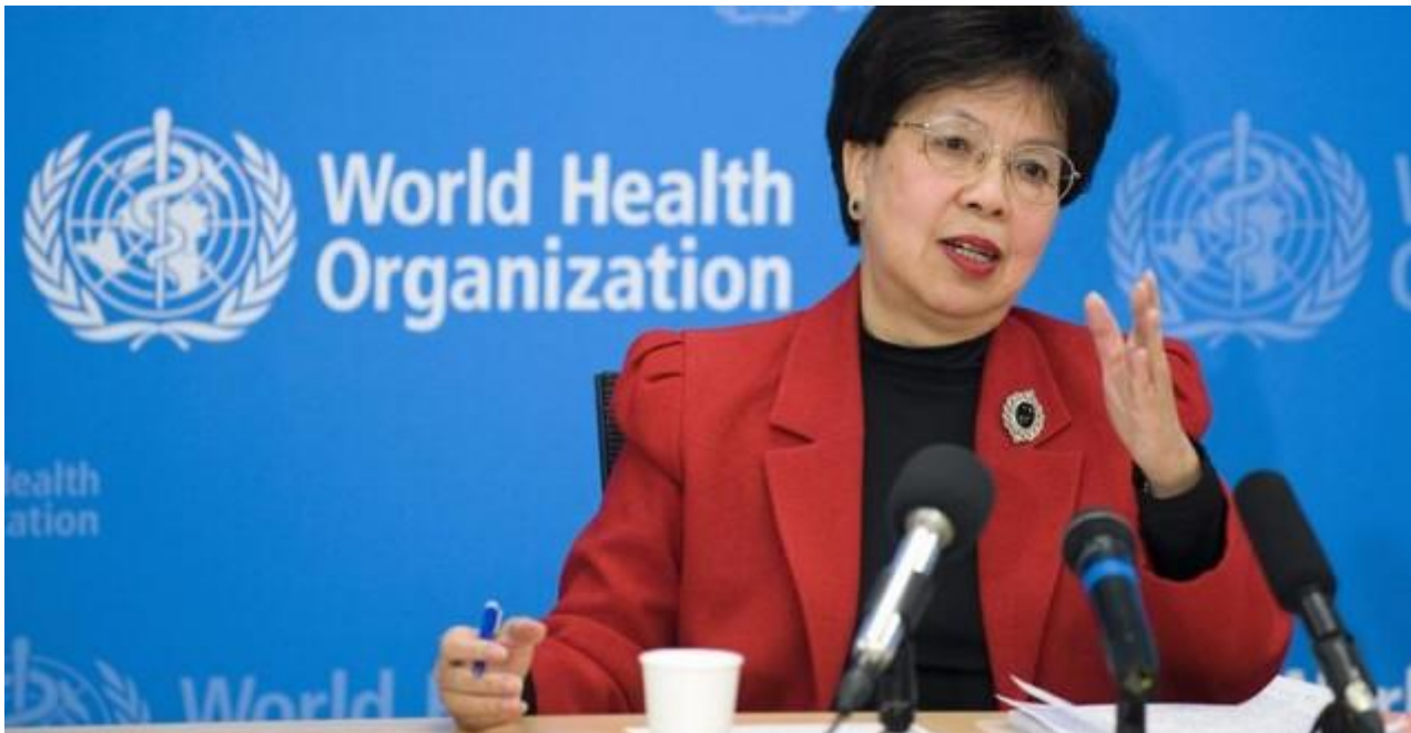
Photo: Dr .Margaret Chan, outgoing WHO Director General