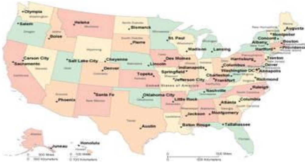
Photo: Map of America's 50 states

American individuals, estates, foundations and corporations contributed an estimated $390.05 billion to U.S. charities in 2016, according to Giving USA 2017: The Annual Report on Philanthropy for the Year 2016 . Total giving rose 2.7 percent in current dollars (1.4 percent adjusted for inflation) from the revised estimate of $379.89 billion. The source of the report is Giving USA, the longest-running and most comprehensive report of its kind in America, is published by Giving USA Foundation, a public service initiative of The Giving Institute. It is researched and written by the Indiana University Lilly Family School of Philanthropy. Charitable giving from individuals, foundations and corporations all increased in 2016, while gifts by estates decreased sharply. Giving to all nine major categories of recipient organizations grew, making 2016 just the sixth time in the past 40 years that this has occurred. The nine categories are religion; education; human services; giving to foundations; health; public-society benefit; arts, culture and humanities; international affairs; and environment and animals. The rise in total giving was spurred largely by giving from individuals, which increased nearly 4 percent in 2016. The Numbers for 2016 Charitable Giving by Source: