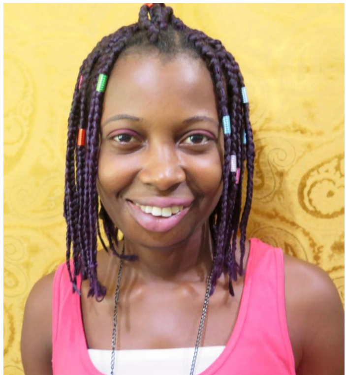
Photo: A patient from April Mission with a plexiform ameloblastoma