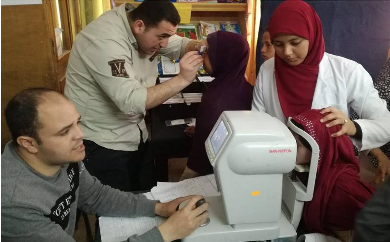
Photo: Egypt medical mission screening for visual defects