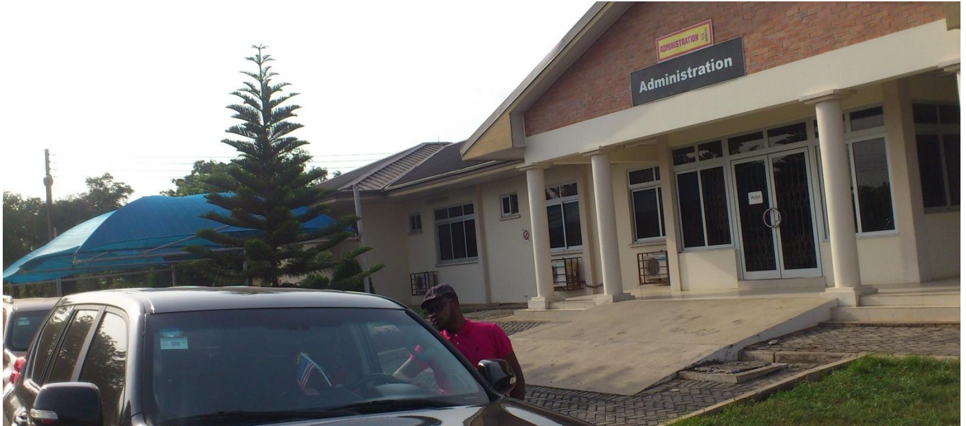
Photo: The Administrative Department of Winneba Specialist and Trauma Hospital Ghana