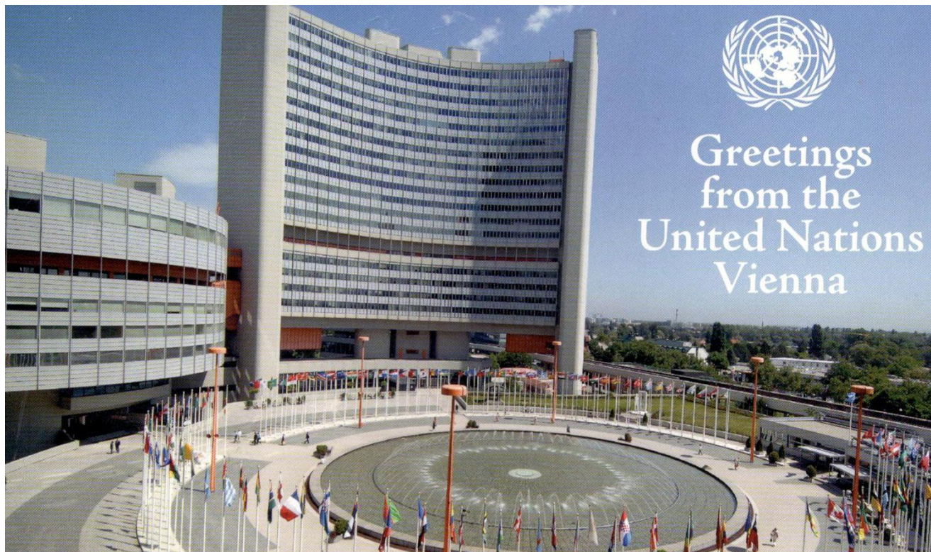
Photo: The United Nations building in Vienna, Austria

Our organization received a letter from the UN office in Vienna inviting us and requesting official names of delegates. PROFOH is classified as relevant non-profit organization by the United Nations and is invited as observer for eight years running. PROFOH has attended three of such impressive briefings in Vienna, Austria. This year the briefing will take place at the United Nations Office in Vienna, Vienna International Centre, Conference Room 3, 7th floor, C-Building, Wagramer Strasse 5, 1220 Vienna, Austria.