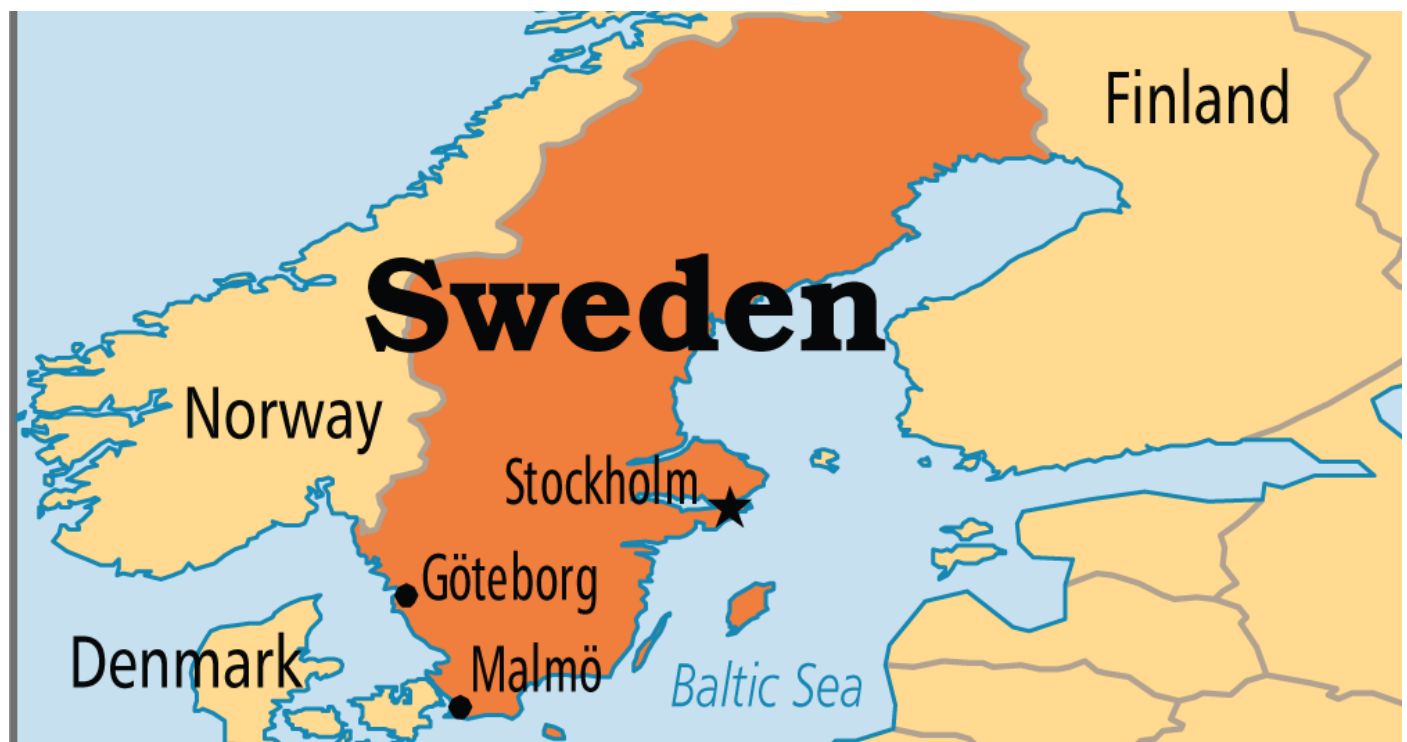
Photo: Map of the Nordic country of Sweden in Europe