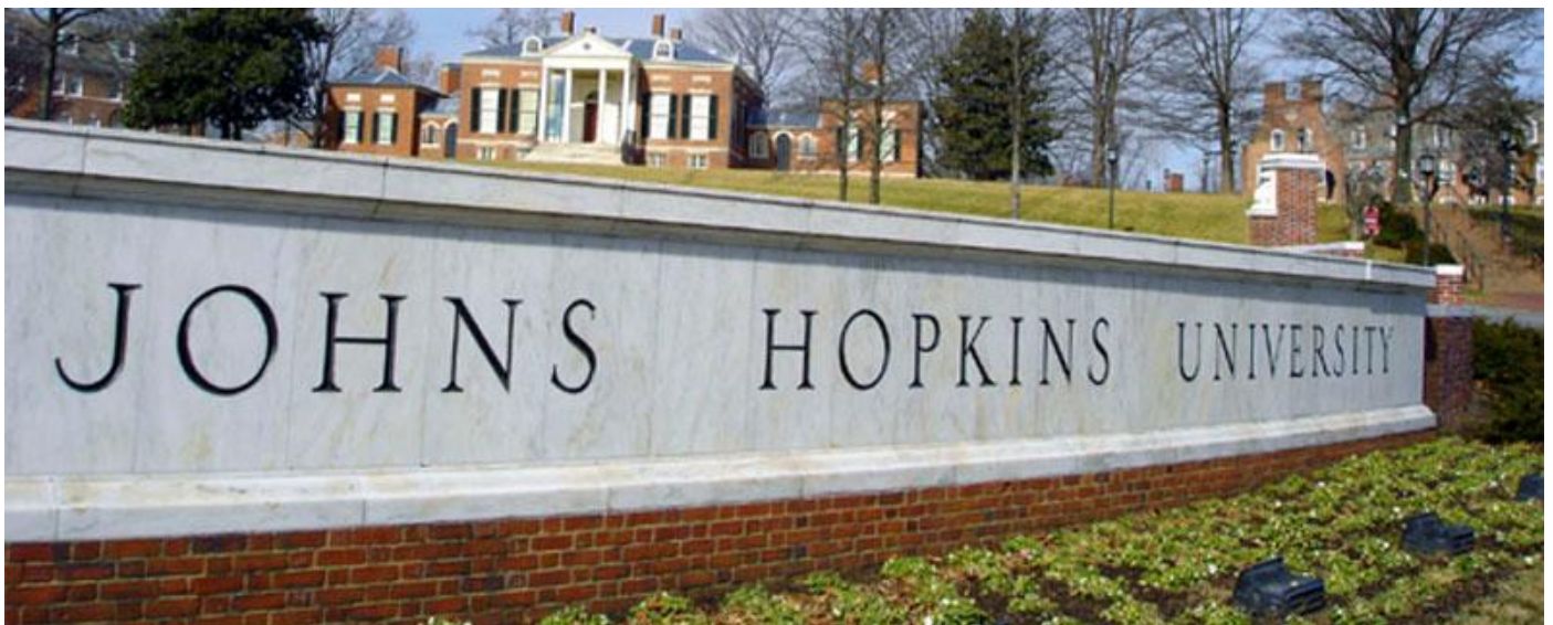
Photo: John Hopkins University Campus.