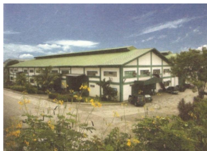
Cavite Manufacturing Plant Main Building

Shinkozan is the summit of Taiwan, and Shinkozan Corporation is a fine company created by Taiwanese in the Philippines. We know very well that localizing our strategies is essential to growing and standing firmly. Therefore, we made it our policy to cultivate Filipino Executives and bring them into management of the company, enabling them with a bird's eye view for decision-making in order to create a sustainable corporate culture. Only by doing this would we be able to accompany our clients to new heights, develop products that satisfy customer demands and make the lives of people everywhere easier.