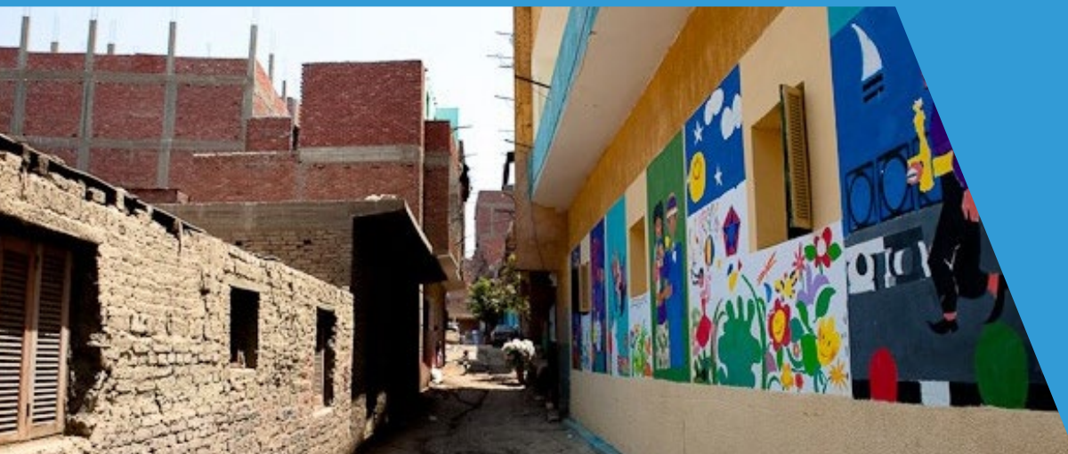
Tawasol Old Building