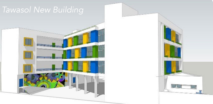
Tawasol New Building