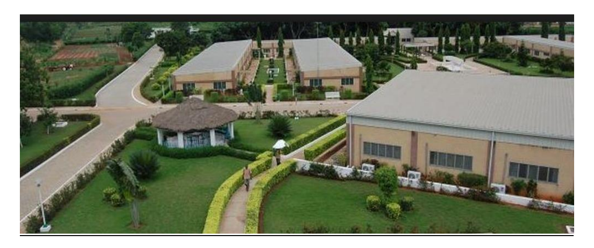
Pictures of the CIEVRA (Center for Experiments and Valorisation of African Resources) created by Fondation Espace Afrique in the Benin Republic to develop the autonomy of rural populations through implementation of organic farming, agro-food and health projects

In 2016, Fondation Espace Afrique has carried on with projects it conducts by itself or in parnership with other organizations (financing schools, offering scholarships for students, etc). In 2016, Fondation Espace Afrique has also signed new agreements of partnership in the agro ecological field and in education with 3 organizations, Mercy Ships, Conférence des Evèques Suisses and the Saint Thomas d'Aquilin Catholic University of Ethiopia