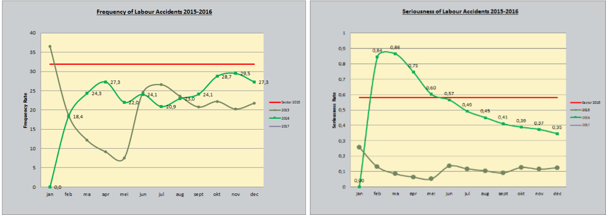
Figures: Frequency and Seriousness of Labour Accidents, 2015 and 2016 figures, compared with the average Rate in our specific sector.