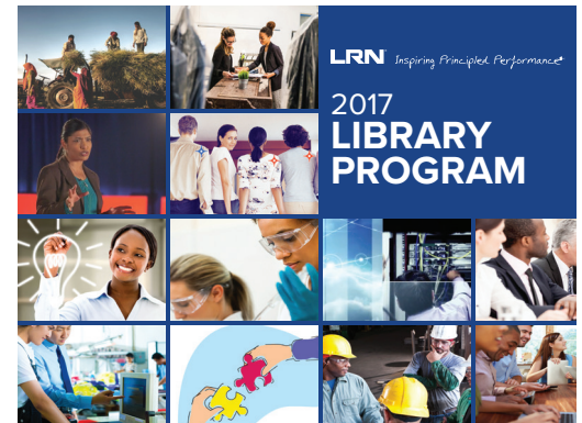
LRN 2017 Course Library

In 2016, we added the following new courses that reflect these principles: “Labor and Employment: An Overview (Global);” “Labor and Employment: Creating an Ethical Culture (Managers);” “Global Data Protection and Privacy: Respecting a Person’s Privacy;” and, “Preventing Harassment in the Workplace.” Our courses “Respect in the Workplace” and “Global Trade Sanctions” were updated to become accessible on all commonly used mobile devices.